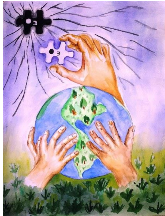
The best drawings under age category 16+