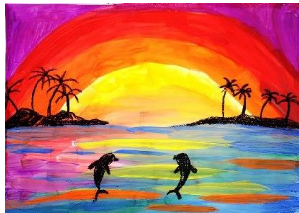
The best drawings under age category 3-7