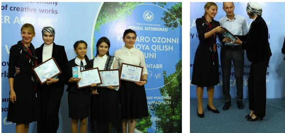
Photos from Awarding Ceremony.

The contest involved electronic essays prepared by students of educational institutions on the importance of ozone layer preservation and its protection. All the winners were identified by the Jury team and awarded diplomas and prizes.