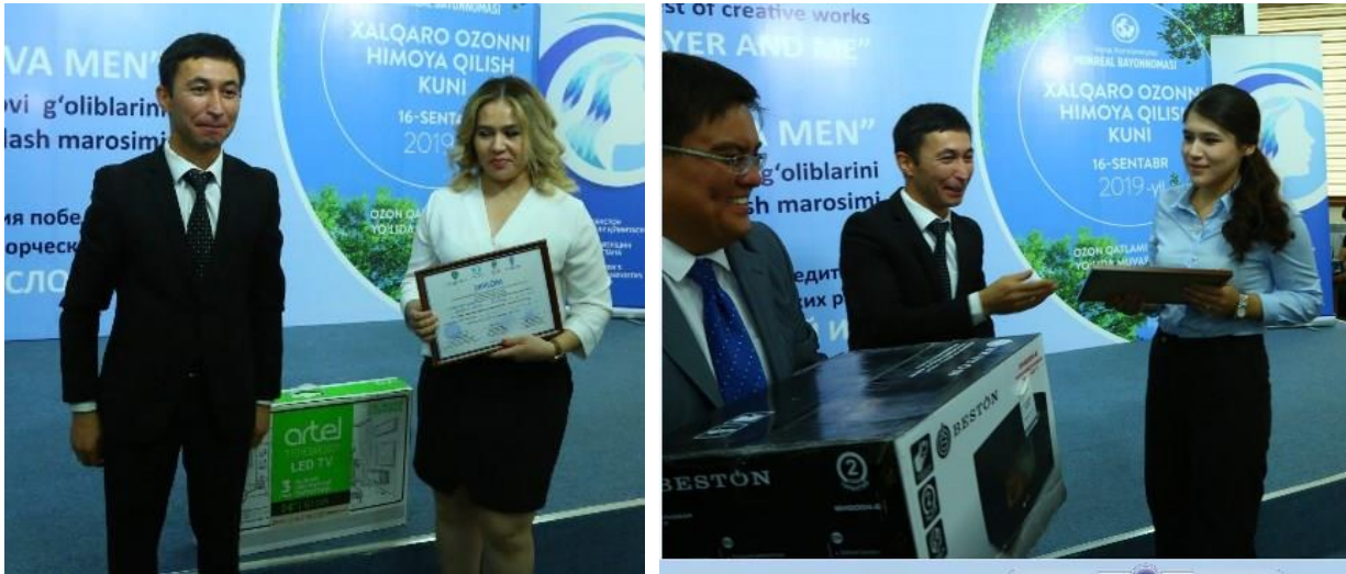
Photos from Awarding Ceremony.