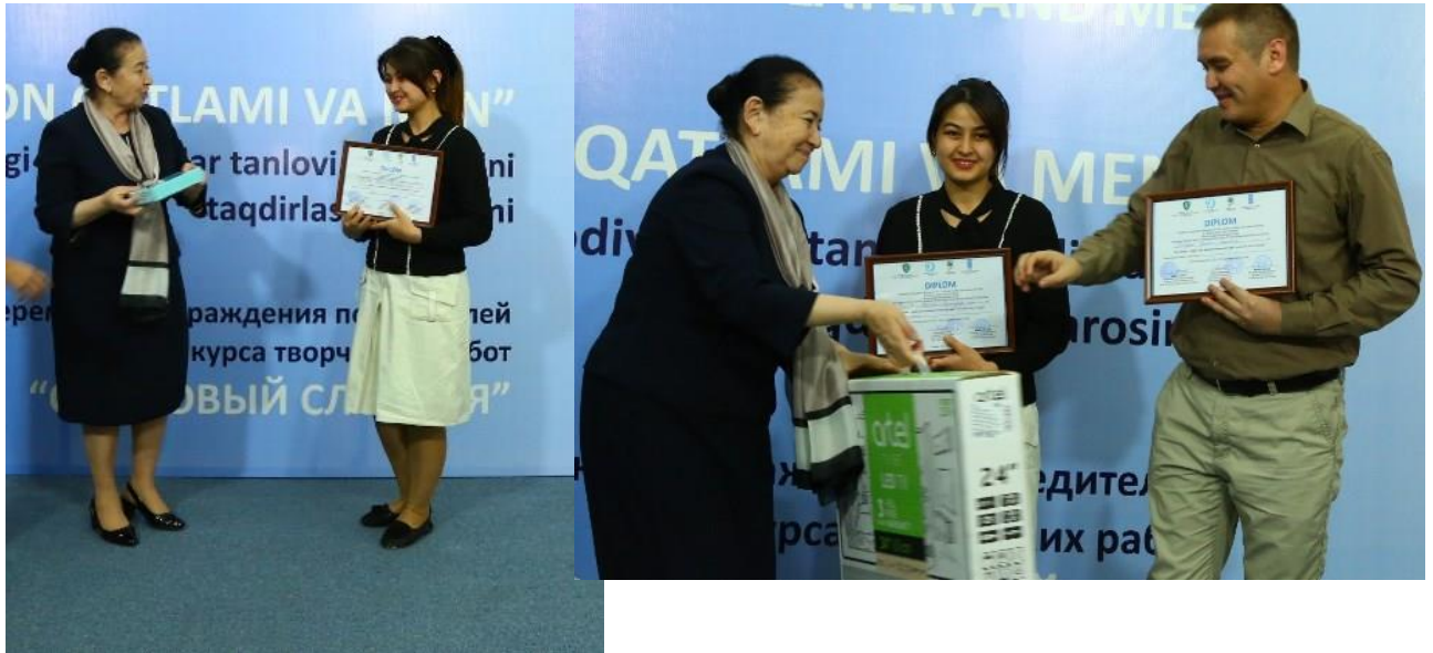
Photos from Awarding Ceremony.

50 articles of Journalists published in newspapers, magazines and on Internet websites about the importance of Ozone layer protection were received, judged by the Jury team and the winners were awarded diplomas and valuable prizes.