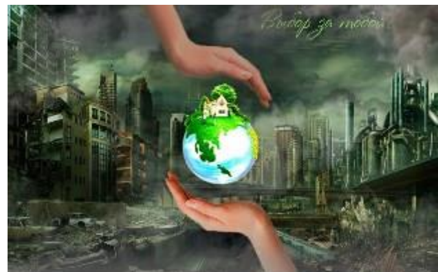
The best electronic posters