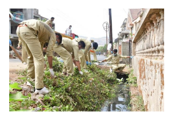
Volunteers cleaning up in Lonavla, India.