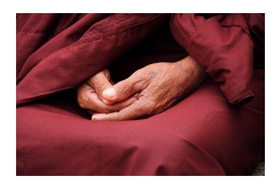
Buddhist monk praying.

Faith-based organizations took a leading and relevant role in WED, organizing different and spiritualrelated activities to generate awareness on protecting environment. Clean-ups, prayers, seminars, speeches tree plantation were some of the activities. All main religions and spiritually-based organizations participated in the World Environment Day activities.