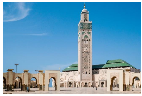
Above Skalhalt Church, Iceland. Below Hassan II Mosque, Casablanca, 2019.