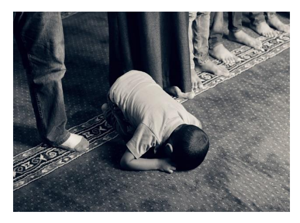
Kid praying in a mosque.