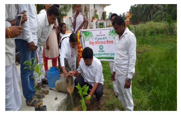
Activities performed in Raipur, India.