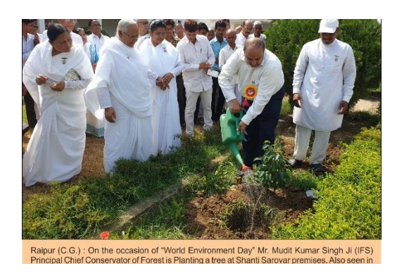
Plantation of trees in Raipur, India.