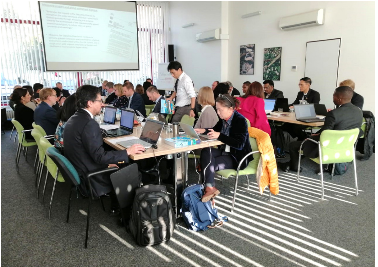
For a more detailed summary of the meeting, please see the Outcome Document from the meeting.

The timeline of the whole process was then discussed, and edits made. The budget table was adjusted to reflect the option of using a consultancy with two face to face facilitated meetings, regional consultation meetings followed by production and layout of the final document. The Committee also recommended that the draft options paper be presented to the Annual Sub-Committee of the Committee of Permanent Representatives to the UN Environment Programme at its late 2020 session (19-23 October 2020). This presentation would prepare Member States for the eventual presentation of a resolution on the Future of GEO to be decided upon at UNEA-5.