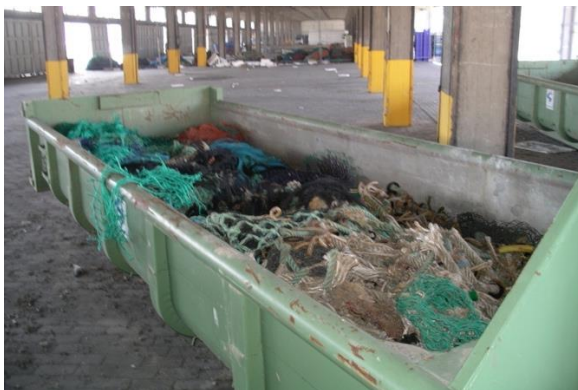
Receptacles for garbage in Ostend (Belgium)