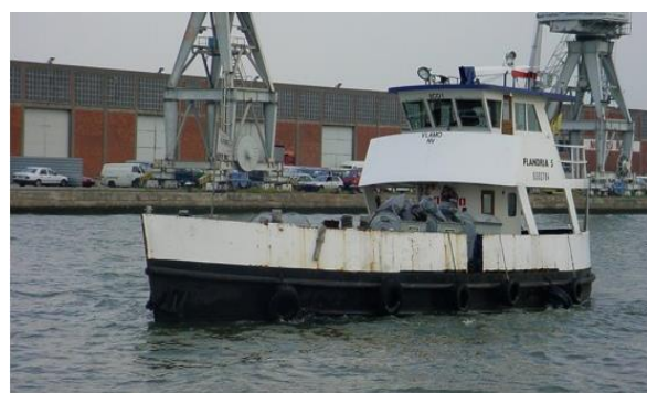
Barge collecting garbage only