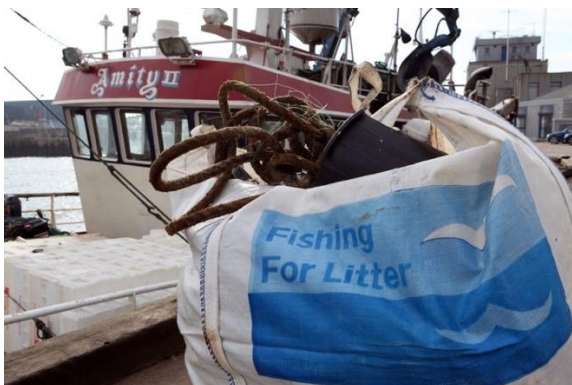
Big bag used for the on-board collection of passively fished waste in UK

136. In cooperation with regional and/or national stakeholders, participating vessels are given hardwearing bags to collect marine litter that is caught in their nets during their normal fishing activities. Filled bags are deposited in participating ports on the quayside where they are moved by port staff to a dedicated skip or bin for disposal. Operational or galley waste generated on board, and hence the responsibility of the vessel, continues to go through established port waste management systems.