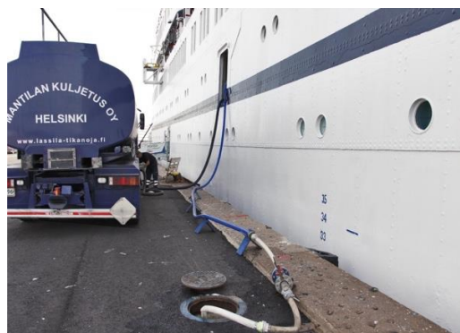
Sewage collection in port of Helsinki (Finland)