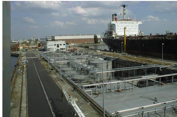
Fixed PRF in port of Antwerp (Belgium)