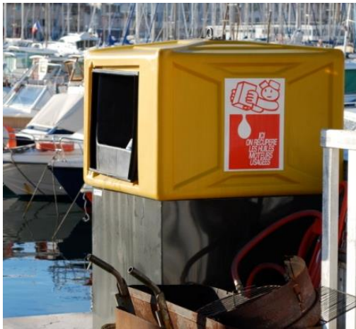
Receptacle for oil in Marseille marina (France)

224. In marinas it is not always necessary to provide large and differentiated reception facilities. By far the largest volume of ship-generated waste to be delivered to a PRF in a marina will be garbage, mainly of a domestic type. As in these ports the main type of ship-generated waste delivered will be garbage and household waste, general receptacles designed for the collection of the most common fractions of household waste will be sufficient. Plastic, paper and cardboard wrapping materials, steel, tin and aluminum food and drink cans, glass and plastic bottles, etc. will all need to be accepted by a marina's PRF.