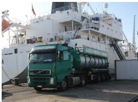
Tank truck collecting oily waste

96. Some examples of vehicles and skips being used as reception facilities: