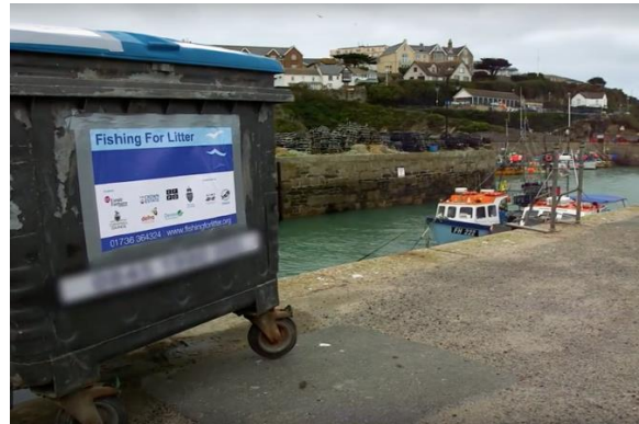
Reception container for passively fished waste

138. It can be noted that in order to avoid that the costs for the provision of the PRF (incl. the treatment of the passively fished waste) are to be fully borne by the fishermen, leading to a disincentive for fishermen to participate in such schemes, several governments apply alternative financing systems or funding, including national and/or international funding. Therefore, in general it are also the national coordinating bodies responsible for the Fishing For Litter schemes that provide the bags free of charge to the fishermen, and cover all costs for collection and treatment of the passively fished waste.