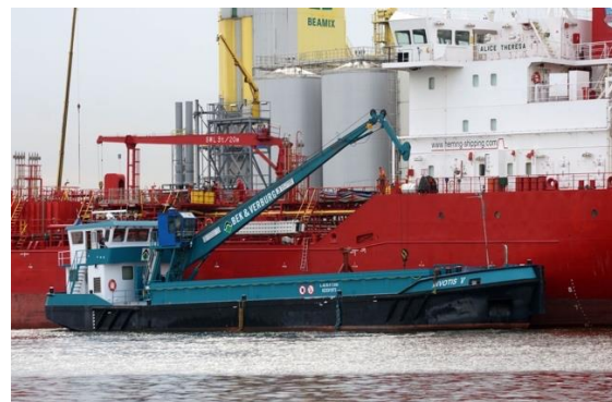
Collecting barge in port of Rotterdam (NL)