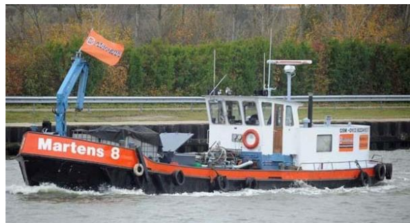
Barge for the collection of garbage