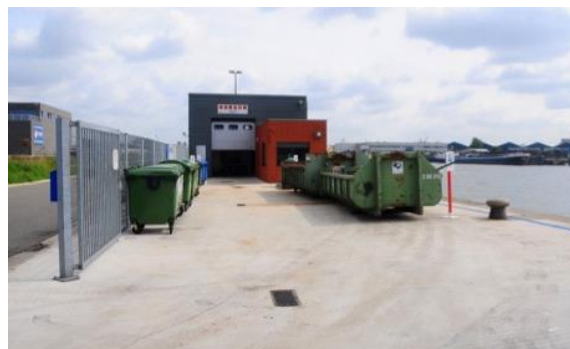
Receptacles for collecting ship-generated waste at a designated and covered area