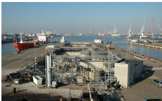
Fixed reception and treatment facility