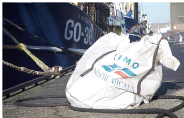
Big bag used for the on-board collection of passively fished waste in NL