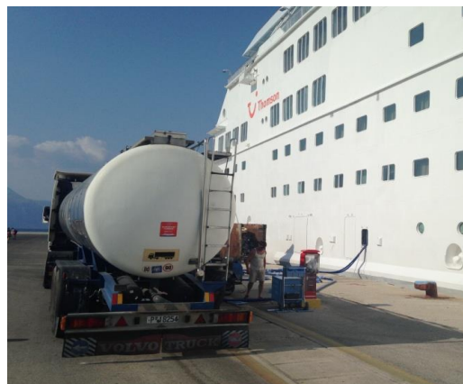
Tank truck collecting liquid waste from a cruise ship

221. In passenger ports, where the same vessels often call on a frequent and regular basis, specific facilities can be provided in order to facilitate the swift collection of liquid wastes, such as sewage, using standardized pipe connections.