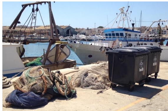
Receptacles for garbage in Sicily (Italy)