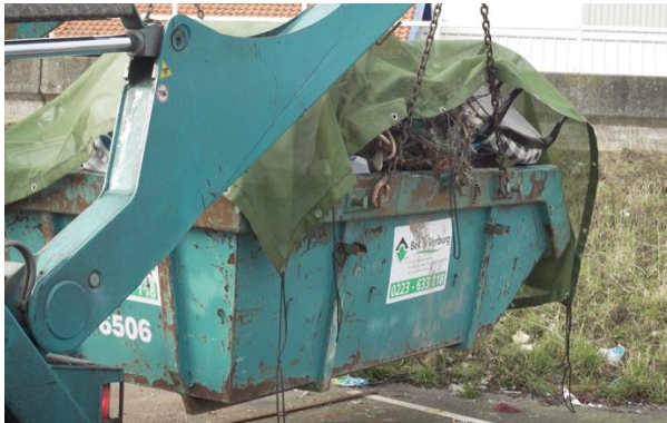
Collection of passively fished waste in port

137. Reception facilities are being provided in fishing ports where the fishermen can deliver their passively fished waste. As the passively fished waste is in general quite similar to ship-generated garbage, also the PRF for this type of waste is similar.