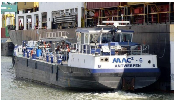
Barge collecting liquid oily waste

92. Some examples of floating reception facilities: