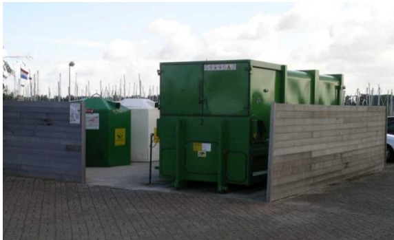
Receptacles for garbage in Nieuwpoort marina (Belgium)

225. Depending on the size of the port (e.g. facilitating large motor yachts) and the number and type of the ships calling, it might be useful to equip the facility with a pumping station for the collection of bilge water (oily water mixture, mainly consisting of water) and/or waste from chemical toilets.