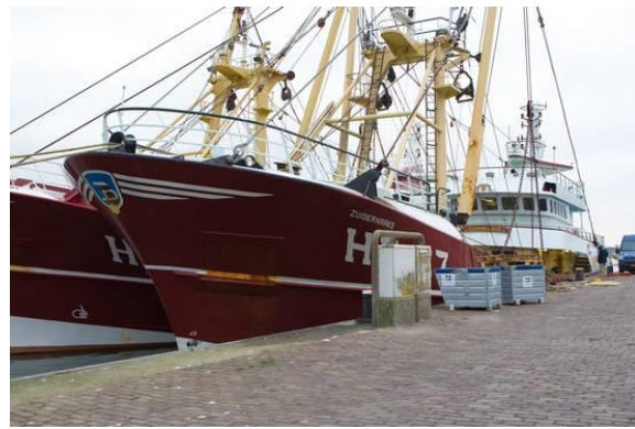
Receptacles for garbage in a Dutch port