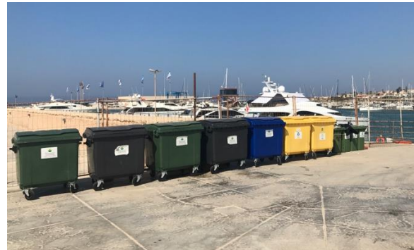
Receptacles for garbage in Marina di Ragusa (Italy)