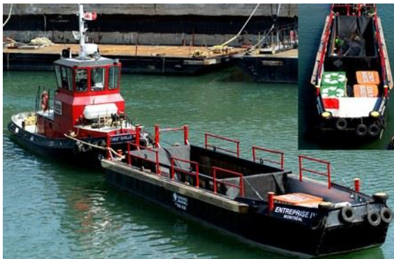
Collecting barge in port of Montréal (Canada)

218. If receptacles are placed at a designated site for the collection of ship-generated wastes and cargo residues, they can be placed in a compound or environmental shelter, which is used to physically and visually shield the containers, to discourage use by non-port users, and to prevent the ship-generated wastes from blowing away.