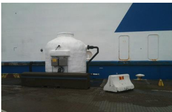
Sewage collection in Trelleborg port (Sweden)

221. In passenger ports, where the same vessels often call on a frequent and regular basis, specific facilities can be provided in order to facilitate the swift collection of liquid wastes, such as sewage, using standardized pipe connections.