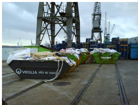
Receptacles for garbage from ships