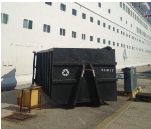
Container for garbage from a cruise ship

220. In passenger/cruise ports in general the same type of PRF can be applied as in merchant seaports, although seasonal traffic and increased tourism can have a substantial impact on the volumes of ship-generated waste delivered.