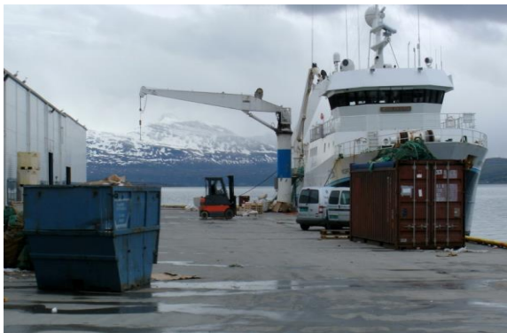
Receptacles for garbage in Tromsø (Norway)

223. Due to the limited types of ship-generated wastes that are being delivered by fishing vessels, in general fishing ports can focus on the collection of MARPOL Annex I (bilge water and waste oil) and MARPOL Annex V (garbage, including fishing gear). As a consequence, the collection of waste from fishing vessels can be organized relatively easily using tanker trucks (for the bilge water) and containers and skips (for the garbage and fishing gear).