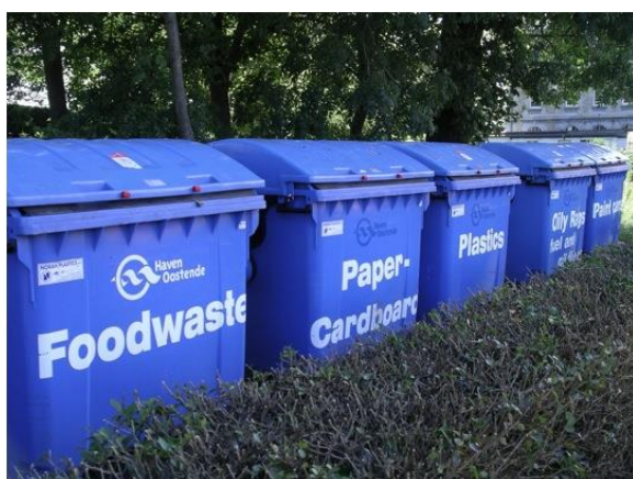
Containers for garbage, strategically located at an entrance lock in the port