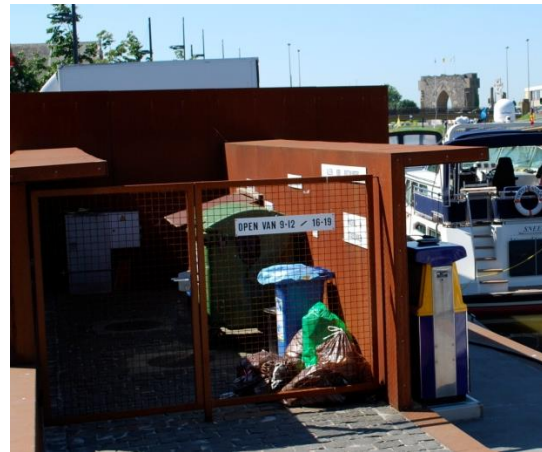
Combined reception facility for bilge water and garbage in a marina in Belgium

225. Depending on the size of the port (e.g. facilitating large motor yachts) and the number and type of the ships calling, it might be useful to equip the facility with a pumping station for the collection of bilge water (oily water mixture, mainly consisting of water) and/or waste from chemical toilets.