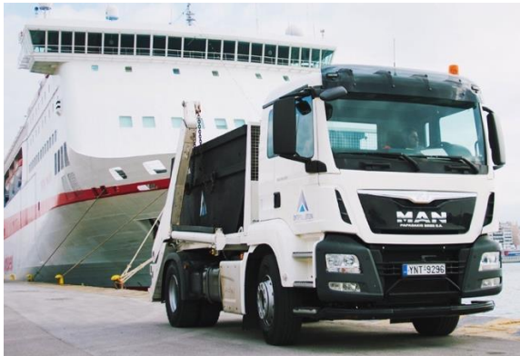
Mobile collection in port of Piraeus (Greece)

219. In order to provide maximum flexibility for the ship to deliver wastes while avoiding undue delay, in major ports the availability of reception facilities on a 24/7 basis might be considered.