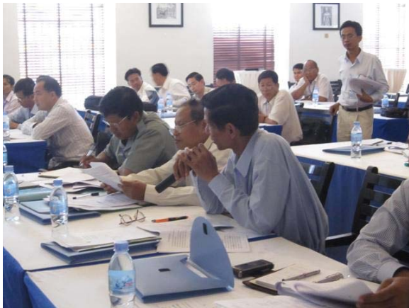
Activities of concerning participants provided comment and revise on the gap of draft technical guideline and national action plan on mercury management