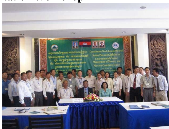
Delegates took a group photo with participants during workshop on the management of mercury and waste containing mercury, 30 June 2009