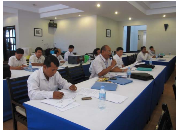
Activities of concerning participants provided comment and revise on the gap of draft technical guideline and national action plan on mercury management