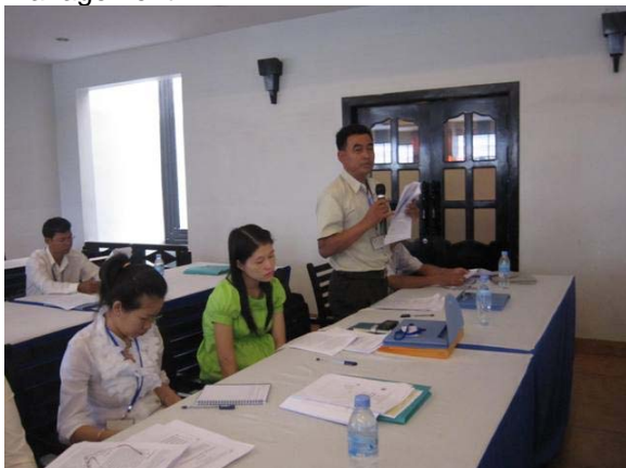
Activities of concerning participants provided comment and revise on the gap of draft technical guideline and national action plan on mercury management