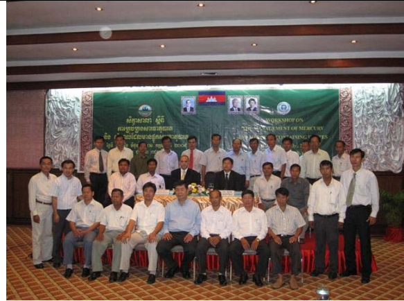
Delegates took a group photo with participants during workshop on the management of mercury and waste containing mercury, 30 June 2009