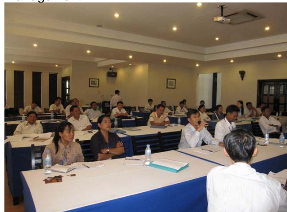
Activities of concerning participants provided comment and revise on the gap of draft technical guideline and national action plan on mercury management