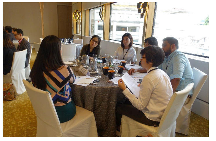
The young authors participating in the visioning workshop

for each chapter. Lead authors were also advised to suggest and recommend new (contributing) authors for gaps that may exist in the current list. An animation and comic competition have also been agreed upon as a special outreach activity to promote the product and to identify visual authors from the finalists of the competition. The group agreed to use "#Our eARTh, Our Story" as the theme of the Animation and Comic Competition. The author team also reviewed and agreed on the work plan and timetable for the development of the youth-oriented product, and the role and responsibility of each lead author in the drafting process, including an internal review for coherence and consistency.