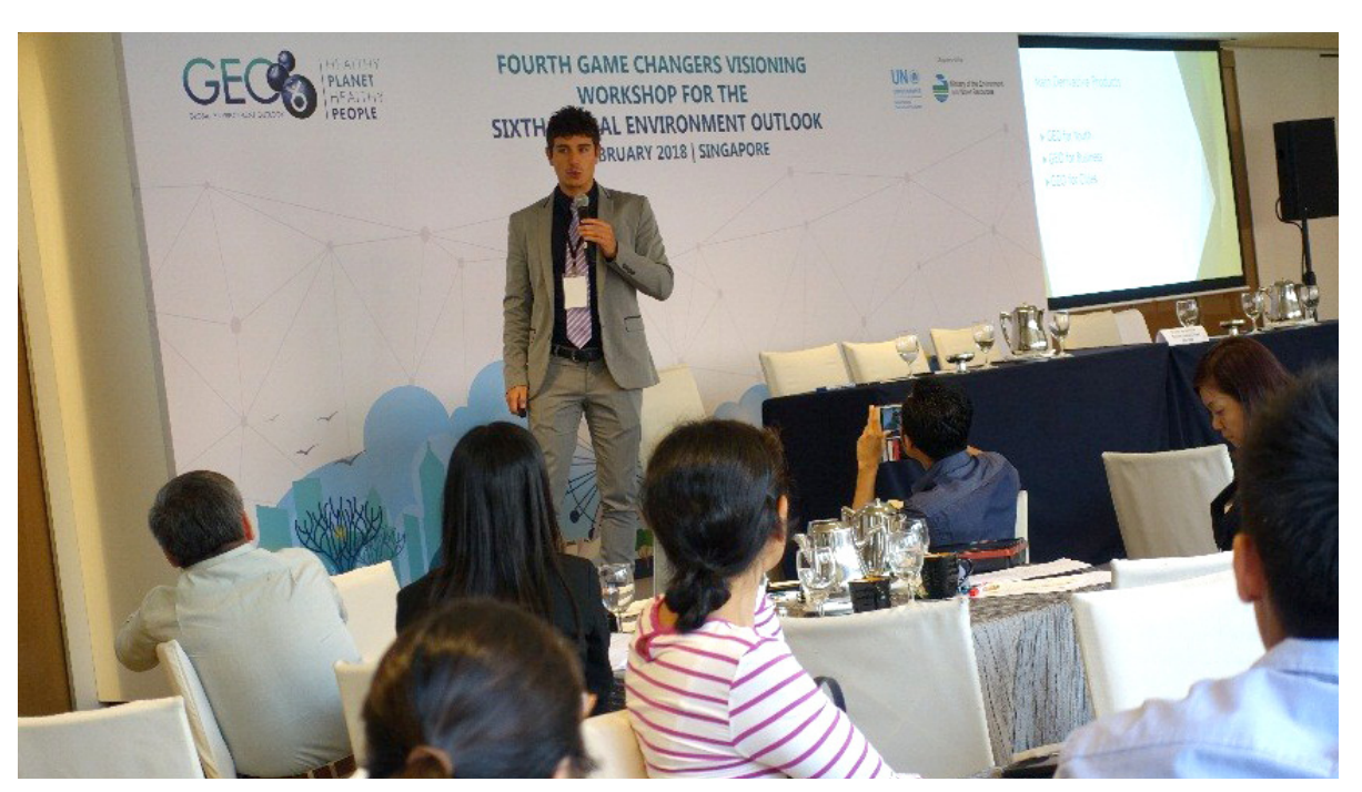
Presentation on the Global Environment Outlook for Cities

• Conducting a side event on the Global Environment Outlook for cities: The Global Environment Outlook for Cities is one of the main derivate products of the Global Environment Outlook specifically targeting the needs and the potential of cities in achieving the Sustainable Development Goals (SDGs). The fundamental objective of the Global Environment Outlook for Cities is to: (a) promote a better understanding of the interaction between urban development and the environment; (b) providing reliable and up-to-date information to the region's local governments, scientists, policy-makers and key stakeholders; and (c) help them improve urban-environmental knowledge base planning and management. The Global Environment Outlook for Cities assessments provide information on the state of the environment, the main factors for change, and the policies affecting the environment, their effectiveness as well as emerging themes. For this new edition, it is envisaged to develop a more dynamic and interactive product compared to the previous editions. The main idea is to build on existing networks and attract more key players, especially from developing countries to create sustainable pathways within the Sustainable Development Goals (SDGs) framework.