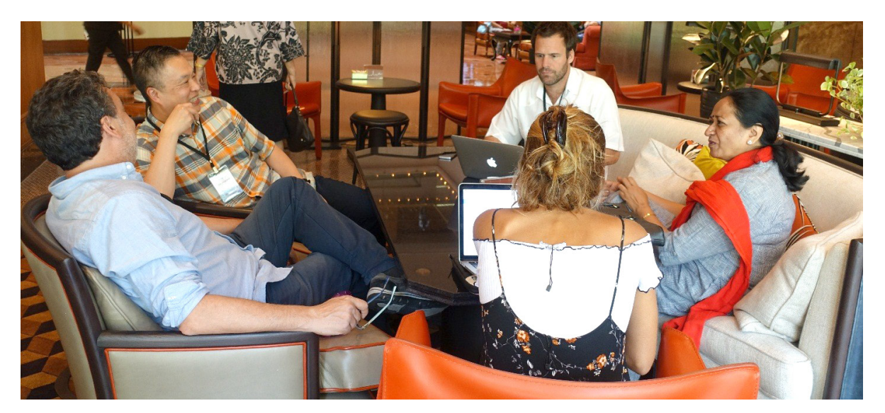
Drafting session of the Drivers Chapter