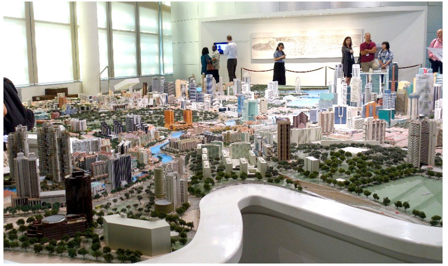
Participants during a tour of the Singapore Clty Gallery

The technical review of the full sixth edition of the Global Environment Outlook will begin on 16 April 2018, which means all chapters must be delivered to the Secretariat in second-order draft form by 11 April 2018. The review comments will need to be addressed between 15 May and 15 June 2018 by the authors. Efforts are being made with the Review Editors to improve the efficiency and accuracy of the process of addressing review comments. A Science Editor will also be engaged to review the chapters from 15 April to 15 June to tighten up the narrative, propose improvements to the quality of the science and eliminate duplication in the document. The intergovernmental review is intended to begin on 15 June 2018, until 15 August 2018. The review comments from this