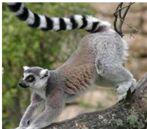
Ring-Tailed Lemur of Madagascar