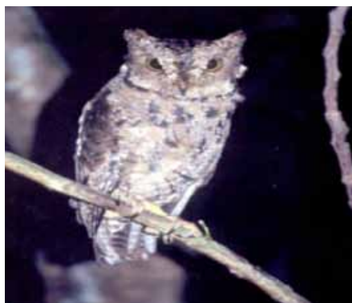
Seychelles Scops Owl ( Syer )