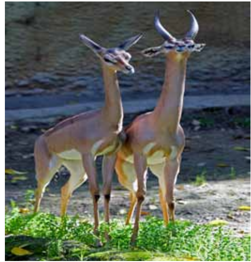
Gerenuk ( Litocranius walleri )

11. In Egypt, some 7 per cent of the country's bird population consists of migratory species which appear on a seasonal basis. The coastal areas of Egypt are situated along extremely important migratory routes for birds and there are very important wintering areas for waterbirds along the coast. The lakes along the Mediterranean shores of Egypt and the country's Bitter Lakes represent some of the most important areas for migrating and wintering waterbirds in the Black Sea and Eastern Mediterranean region (BirdLife International, 2005). Significant concentrations of the world populations of a number of species are also found in these wetlands. Expanding urban, industrial, agricultural and tourism development is now creating hazards to birds in areas where previously they encountered no threats. These new threats include development activities and their related infrastructure; the destruction or degradation of habitats; contamination by pollutants; and the construction of electricity power lines that obstruct avian flyways, causing fatal collisions.