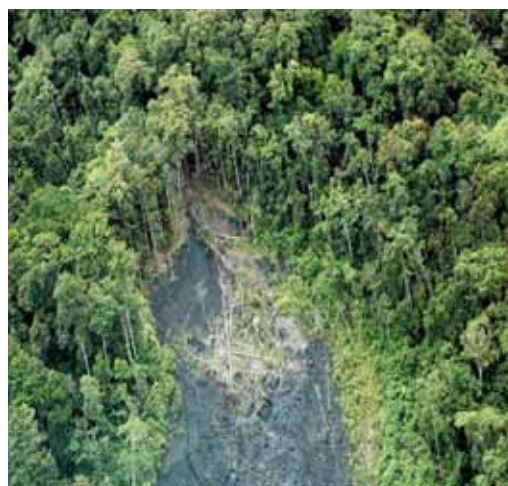
Mau Forest, Kenya

(Source: UNEP Annual Report 2009 and Kenya Wildlife Service Annual Report 2008).