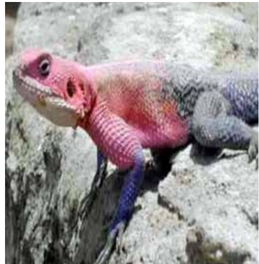
Red-headed Rock Agama ( Lizard )

12 The Horn of Africa also has the continent's highest number of endemic reptiles, alongside a number of endemic and threatened antelopes, such as the gerenuk ( Litocranius walleri ), a species of long-necked antelope found in the dry bushy scrub in the Horn of Africa (Djibouti, Ethiopia, and Somalia), as well as some parts of East Africa, such as Kenya and northeastern Tanzania. Gerenuks are declining in number due to over-hunting, drought, and habitat loss in the case of Somalia.