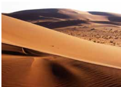
Namib Desert, Namibia