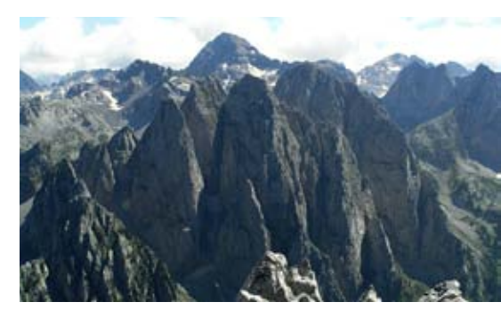
Maja Jezercë in the distance in the Prokletije