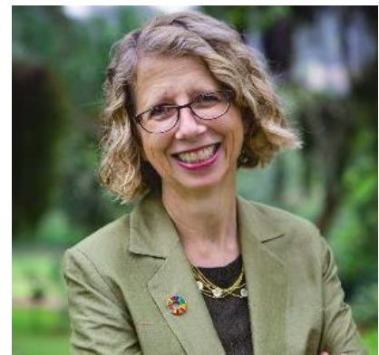
Ms. Inger Andersen, Under Secretary-General of the UN and UNEP Executive Director