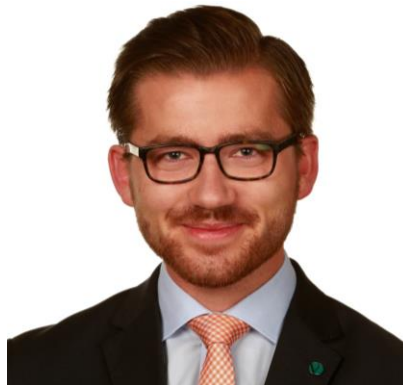
Mr. Sveinung Rotevatn, UNEA President and Norwegian Minister of Climate and Environment