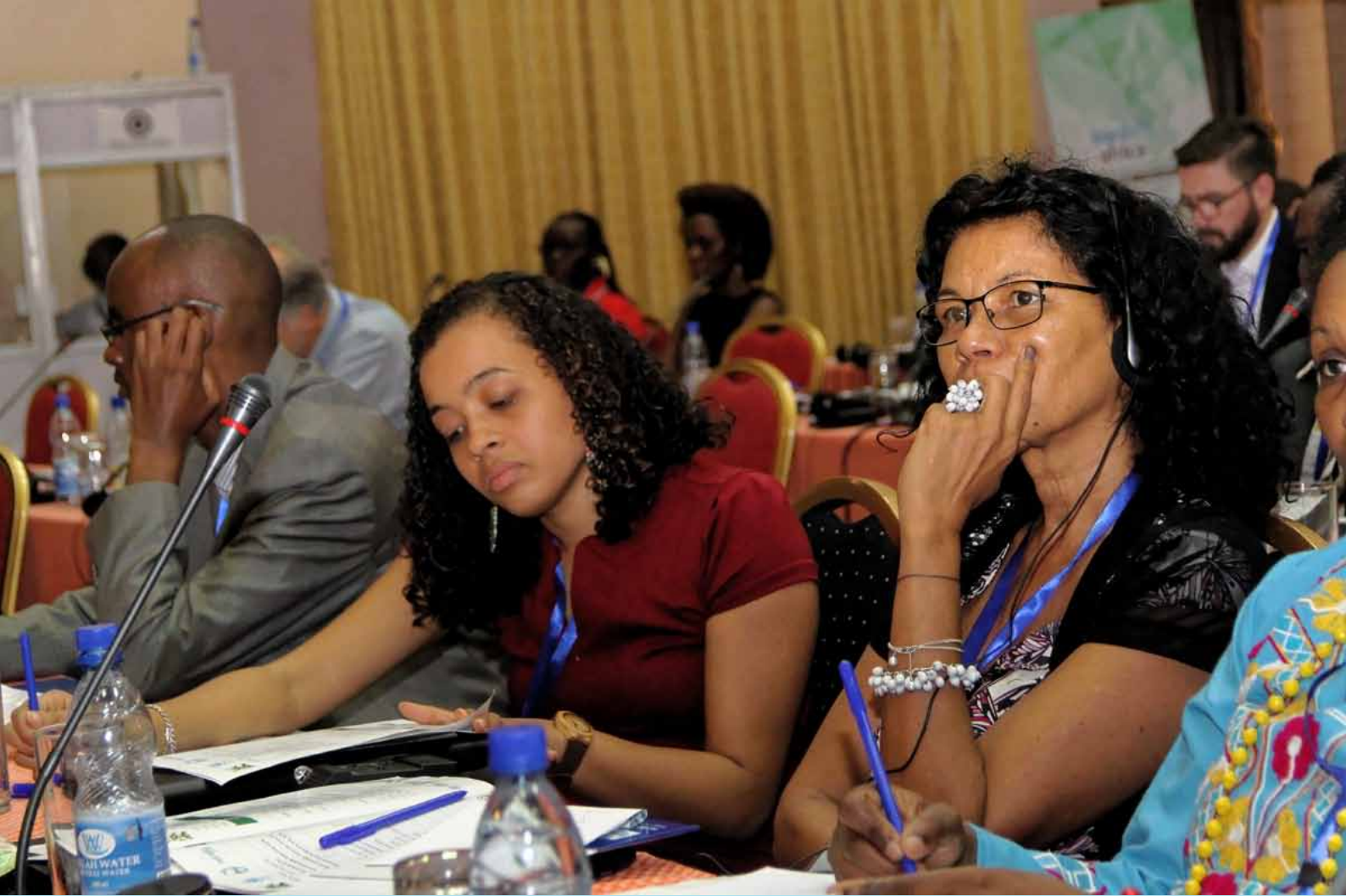
Participants from Mauritius during the ARSCP meeting

and Economic Growth; Responsible Consumption and Production; Industry Innovation and Infrastructure and Sustainable cities and communities.