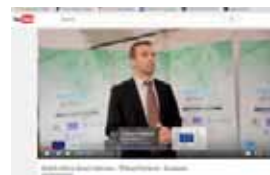
Thibaut Portevin, European Commission