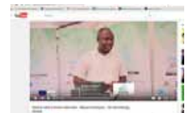
Industrial Symbiosis Ghana