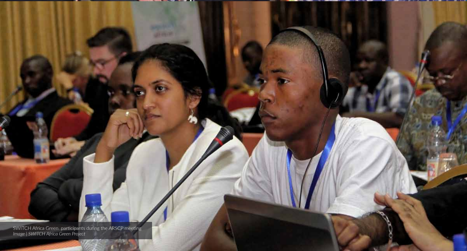
SWITCH Africa Green participants during the ARSCP meeting