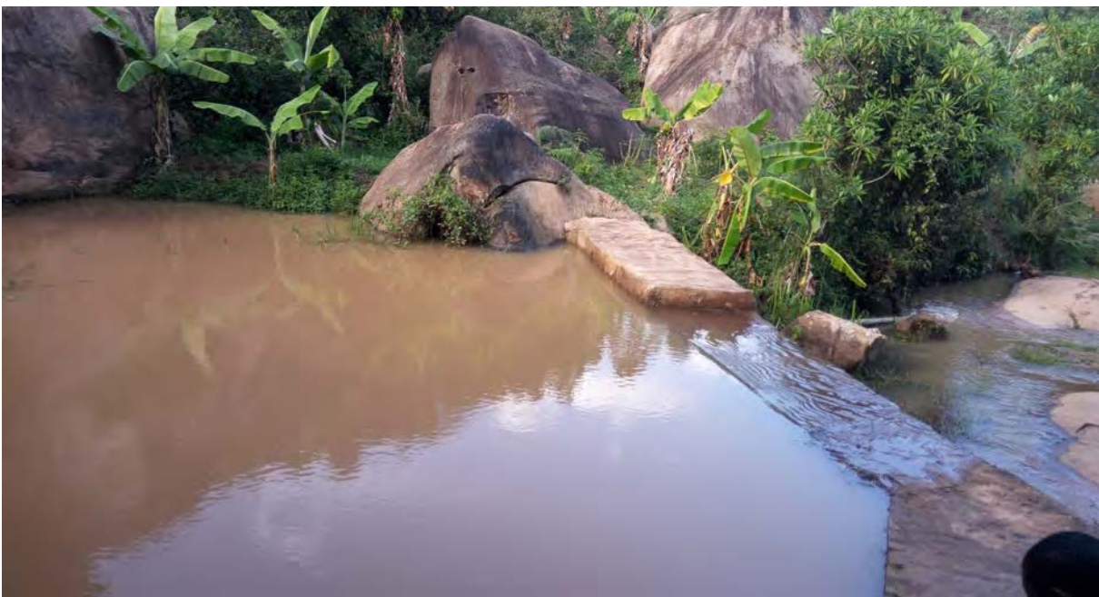
The Kya Aka sand dam in Kenya