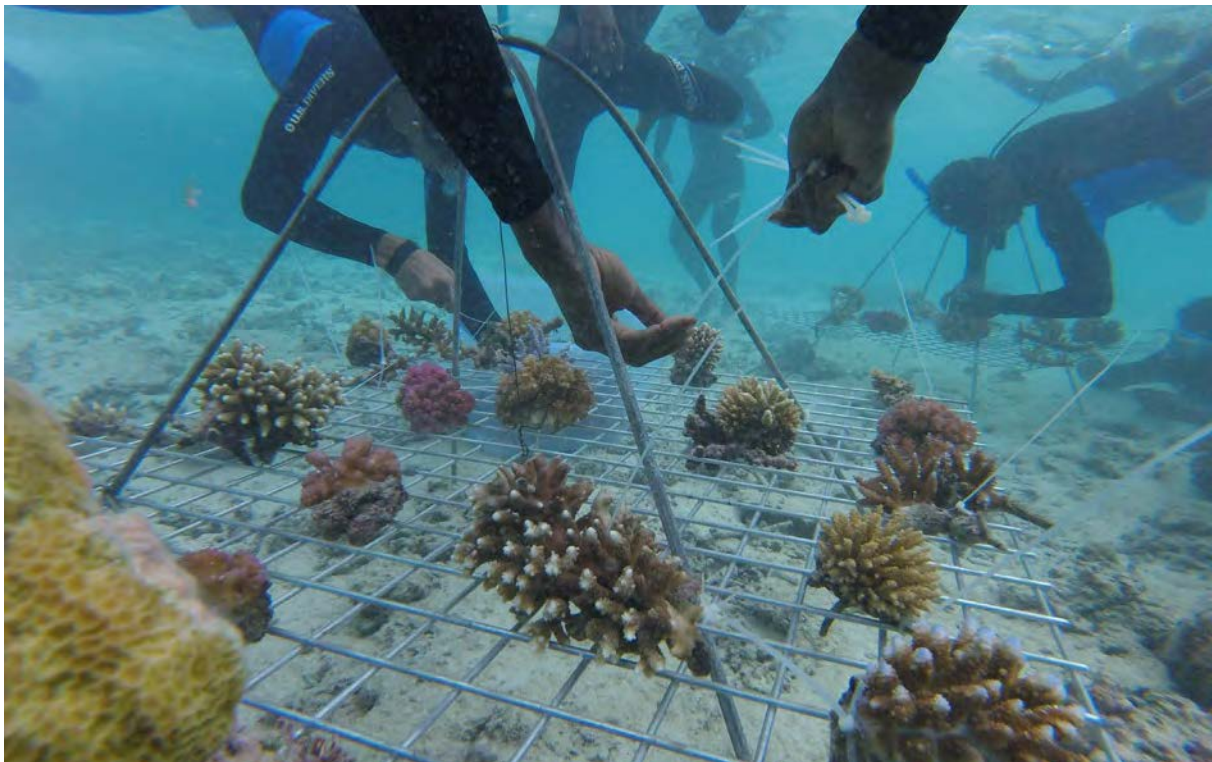
Coral gardening