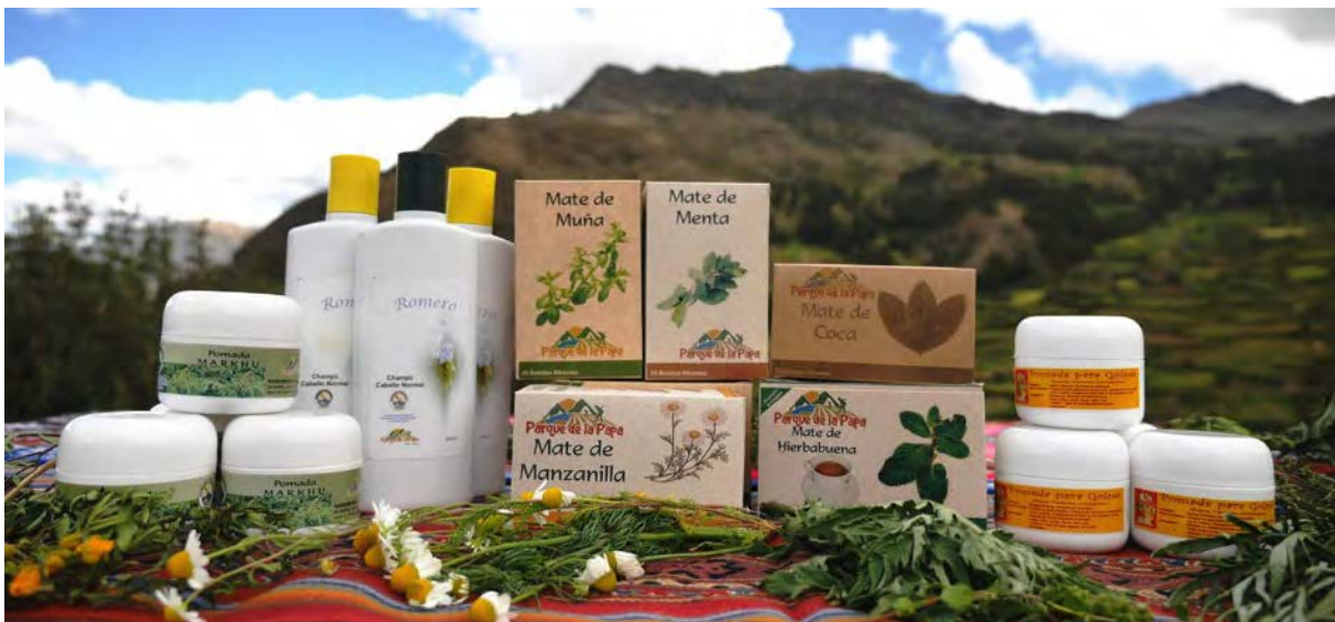
Landscape-based products and services for livelihoods diversification in the Potato Park, Peru.

The Potato Park microenterprises are largely made up of women, who are generally poorer and more vulnerable than men. Ten per cent of the revenue from microenterprises is invested in a community fund and distributed equitably to communities based on their contribution to sustainable management. The fund also provides a safety net for the poorest people (eg widows and orphans). An inter-community agreement for benefit sharing guides the distribution of funds based on customary laws. Sustainable management of the Potato Park landscape also helps to ensure water provision for downstream populations, including the city of Cusco.