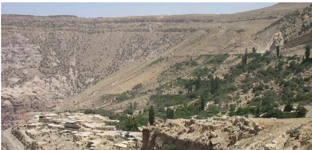
The village of Dana in the Dana Biosphere Reserve, Jordan.

Participatory network mapping has been applied in many different ways in dryland contexts to visualise and explore actor linkages (eg Mayers 2005, Schiffer and Hauck 2010, Stein et al. 2014). The simplest tools have often proved to be the most effective – but their effectiveness depends on the attitude of the facilitator and his or her ability to build a rapport among the group. For example, in a social network analysis in the Blue Nile, Ethiopia, relationships between different stakeholders (different government authorities, donors, NGOs, enterprises etc) were mapped visually to generate narratives about the interplay among actors and discuss their implications for ecosystem management (Stein et al. 2014). EbA project steering committees should bring together different stakeholders, particularly local communities and local government, to co-define project goals (see Box 8).