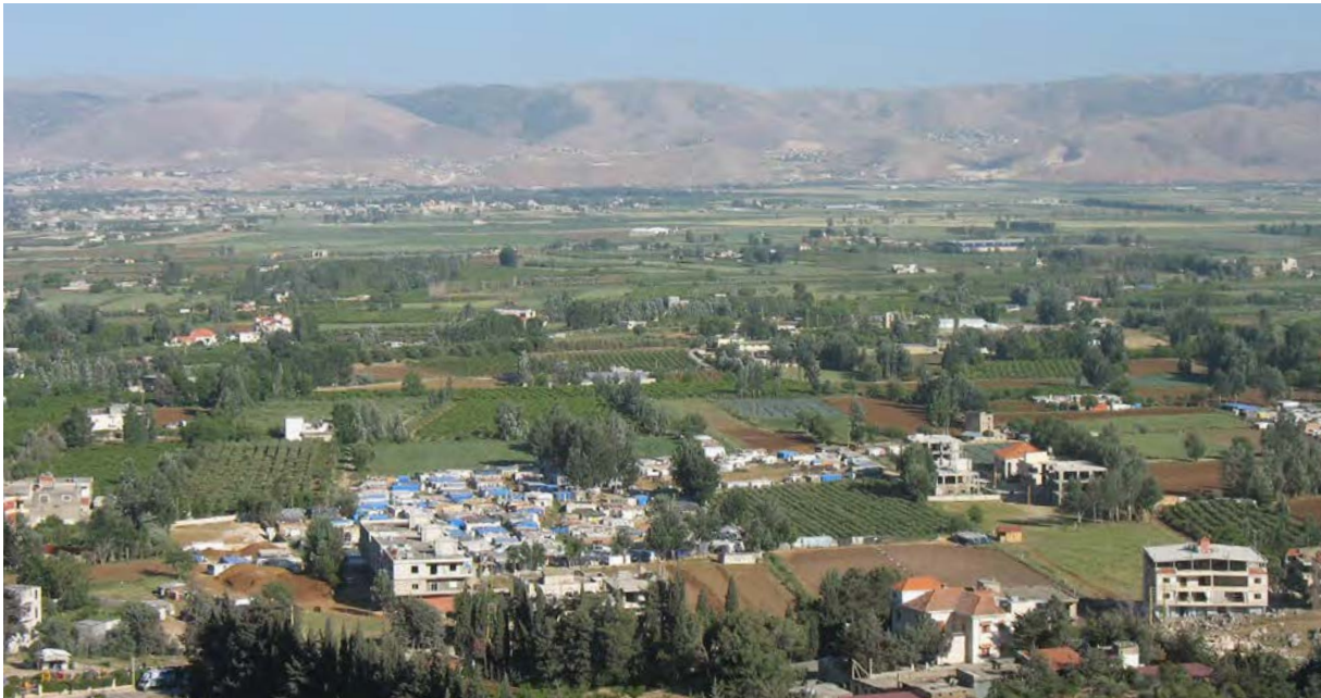
Bekaa Valley, Lebanon