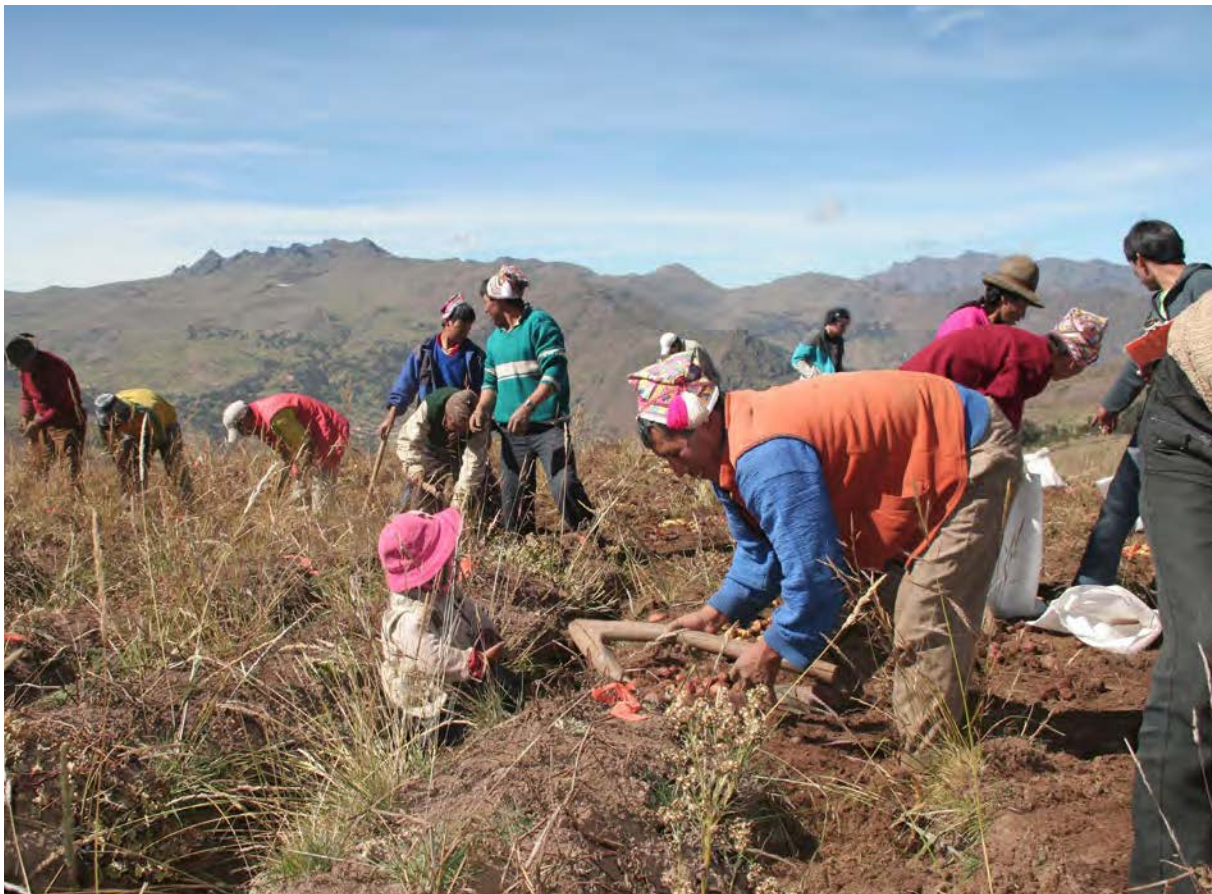
The Potato Park, Peru where adaptive management and potato diversification has increased productivity.

The park has strengthened traditional biodiverse agroecological farming practices across the landscape. It has revitalised the holistic Andean worldview, customary laws and cultural and spiritual values which promote conservation and equity values. It has created strong local ownership and community pride in their park – an evolving gene bank for local, national and global adaptation. These impacts will ensure long-term sustainability but have taken time to build – 5–10 years of sustained and flexible support for highly participatory action research processes.