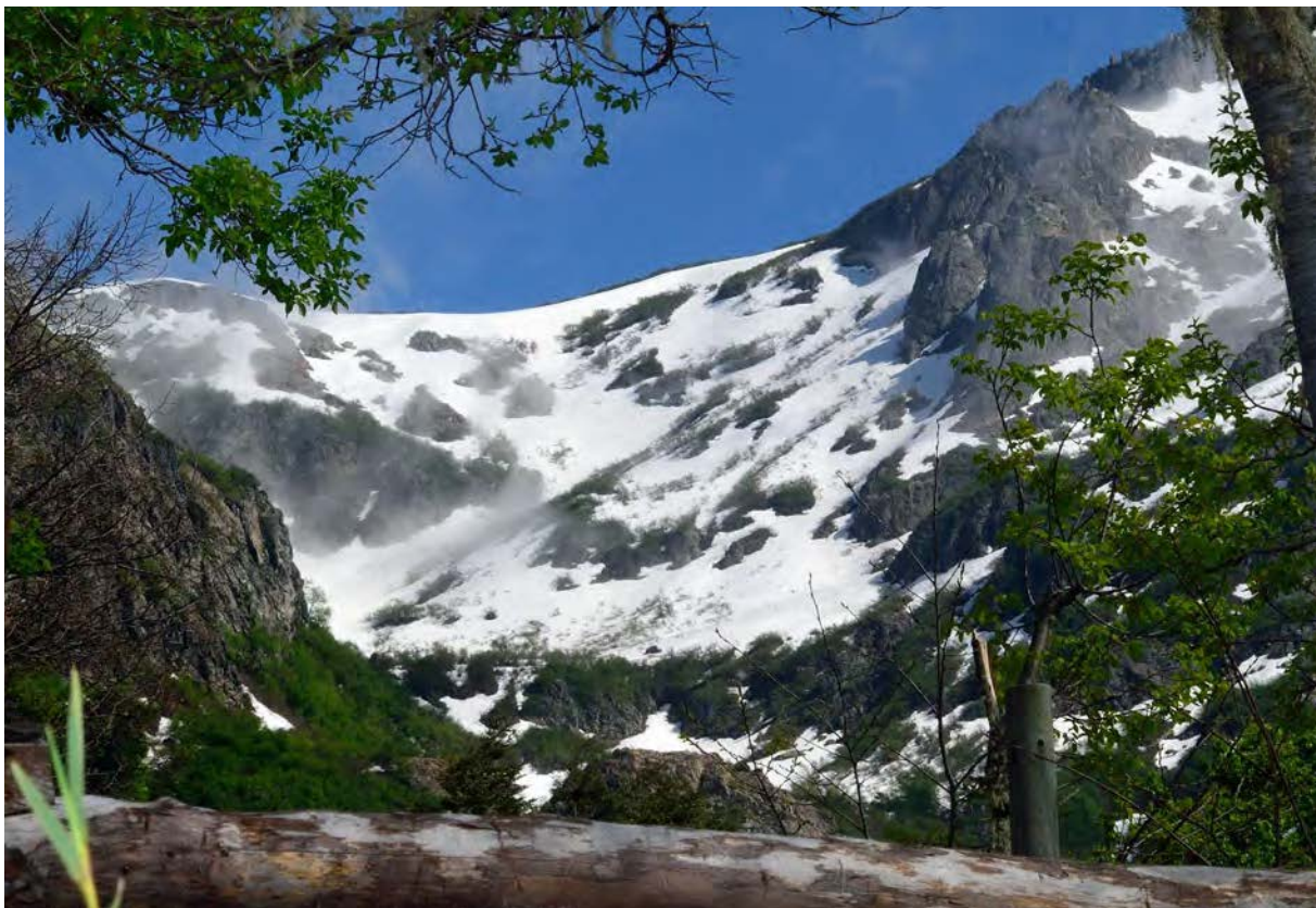
Biosphere Reserve Corredor Biológico Nevados de Chillán-Laguna del Laja – Chile (EPIC's project site).

The goal of the EPIC project was to promote the conservation of ecosystem services within the national policies and programmes for disaster risk reduction and climate change. As part of the first components, the project explored the role of good forest ecosystem management in reducing the risk of avalanches and landslides. It generated evidence of the role of forest ecosystems in DRR and climate change adaptation through a study on the quantification and improvement of the protective capacity of forests against snow avalanches. The study involved dendrochronological sampling (tree-ring dating), the reconstruction of spatio-temporal patterns of past events, reconstruction of avalanche run-out zones based on dendrochronological data and available records, and avalanche simulation with rapid mass movements (RAMMS) computer modelling (flow height). The project also explored local perceptions on forest ecosystem services, climate change and local risks from natural hazards. The results were used to position ecosystem-based disaster risk reduction (eco-DRR) at national level through multi-stakeholder dialogues. EPIC was implemented by IUCN, in collaboration with the Ministry of Environment (and its Regional Secretariat in Biobío) and the Swiss Institute for Snow and Avalanche Research (SLF), with support from the Regional Government of Biobío. 13