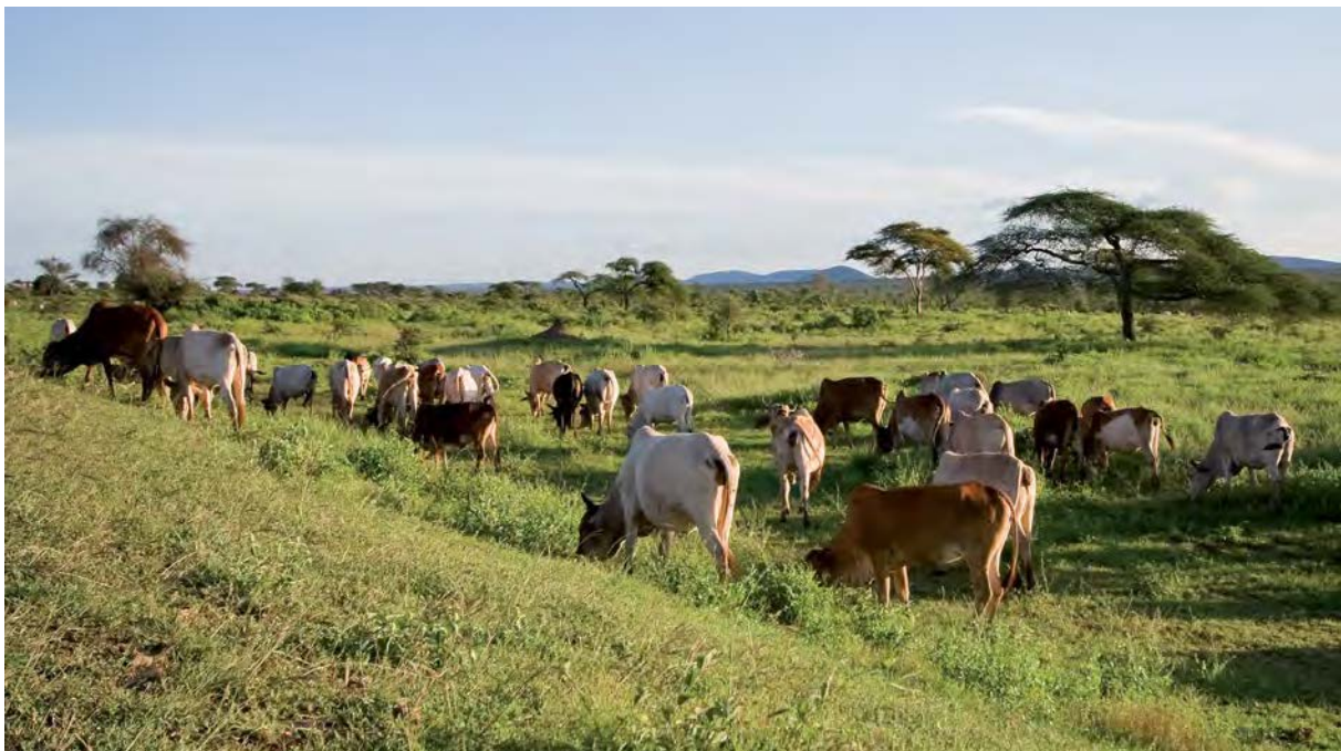
Wet season grazing in southern Ethiopia.

In drylands, annual rainfall is generally low, highly variable in time and space, and there are high evapotranspiration rates due to sunshine and wind. This means that unless stored underground, water evaporates quickly. Climatic variability is often extreme, involving droughts, floods, heatwaves and sudden downpours. Yet the comparative advantages of these environments and the role of pastoralism as a major livelihood and driver of EbA in the drylands have often been overlooked. In terms of gross domestic product (GDP) and other development indicators, drylands include both the richest and poorest parts of the planet, and also some of the most intractable and violent areas of conflict.