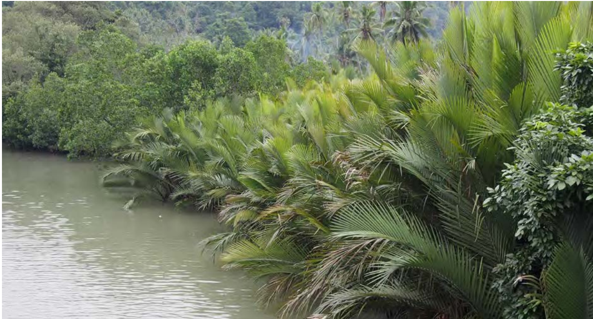
Mangrove ecosystem in Mindanao, the Philippines.

Mangroves can be damaged by sea-level rise, increased levels of salinity and temperature, land erosion, and more intense storms and flooding. If mangroves cannot keep up with sea-level rise, they can leak some of their stored compounds which will emit more greenhouse gases to the atmosphere (Wong et al. 2014). Restoring and conserving mangrove forests can be done in a range of ways such as reducing non-climate pressures (eg pollution) and encouraging higher temperature and salinity tolerant plant species (UNEP 2016).