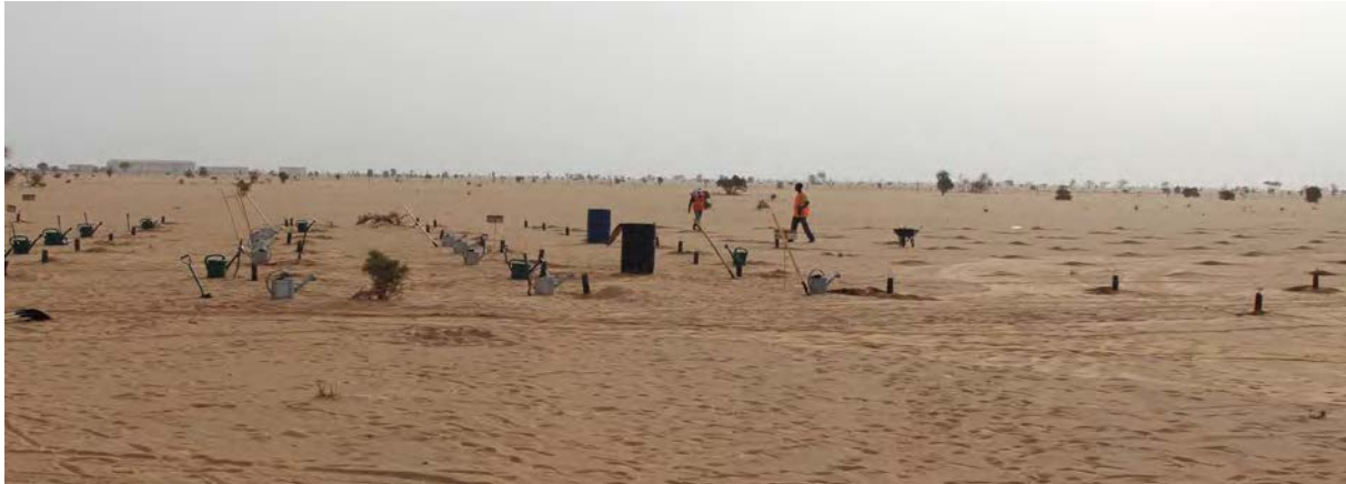
Combating sand encroachment in Mauritania.

In recent years, dryland crop scientists and practitioners have explored in situ conservation techniques which make use of the natural gene banks in the ecosystem (inside soils, plants and animals). This is a practical way to implement ecosystem restoration with resource users, using tried and tested plant and animal varieties that local people know how to raise, process and market (Nabhan 2007). In desert areas, naturally occurring oases can be cultivated using manure from livestock to enrich the soils and support a wide array of sensitive species. Once date palm trees are established, their shade improves living conditions for other plants and animals and they can also provide useful building materials, fuel and other services for human settlements (see Box 6).