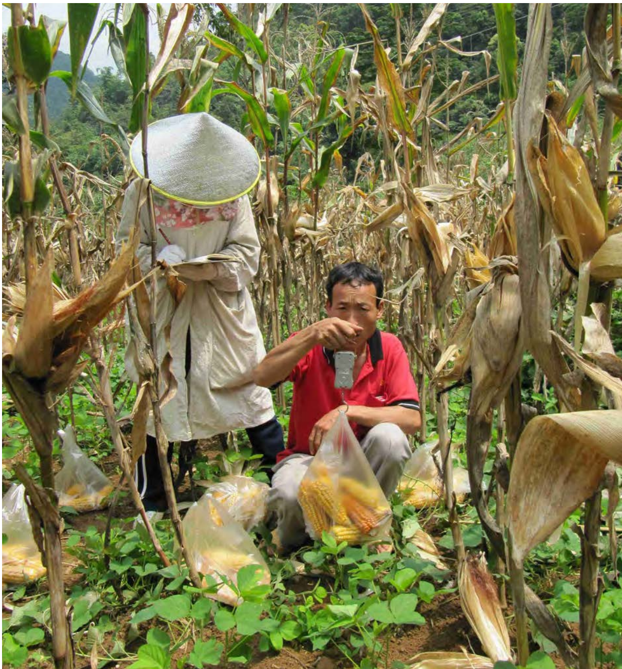
Participatory plant breeding in Southwest China.

Local varieties are often highly resilient. For example, maize landraces survived the big spring drought in Southwest China in 2010, while hybrid maize did not. PPB also supports diversification to reduce risk by raising farmers' and breeders' awareness of the importance of conserving genetic diversity and improving the yield and quality of local varieties. PPB is more cost-effective than conventional breeding and faster (Ceccarelli 2009). The time varies depending on the crop (eg 2–4 years for maize).