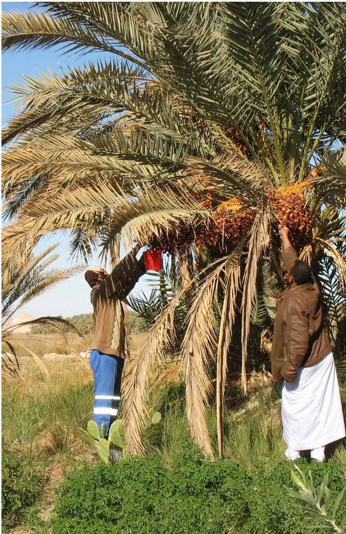
Hand-picking dates from a date palm in the Siwa Oasis, Egypt.