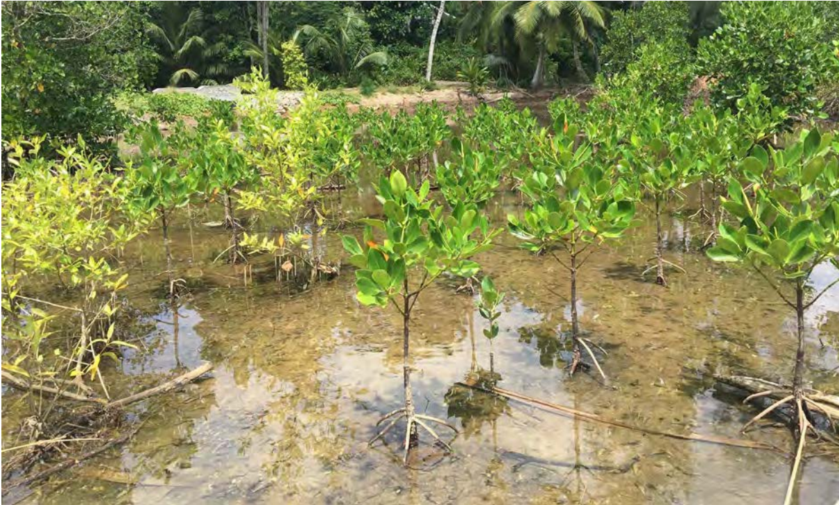
Mangrove restoration in Seychelles.