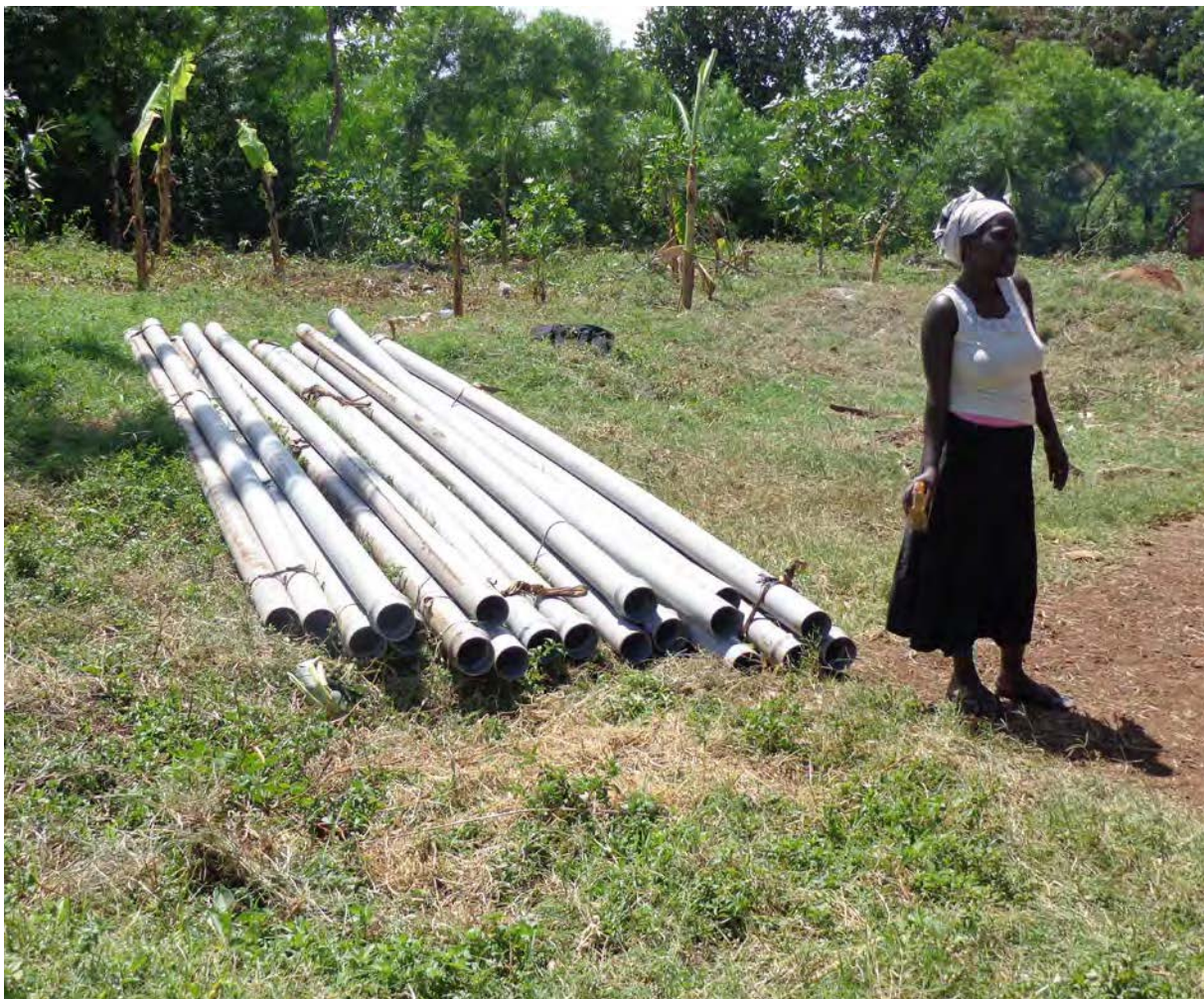
Sanzara Gravity Flow Scheme.

These were analysed based on population growth, and changes in future supply of ecosystem services due to climate change. This was modelled using the future distribution of species considered key for such services. Socio-economic characteristics were also examined as these can influence the vulnerability of a population and its ability to adapt to future changes, including percentage of poverty, dependence on ecosystems, medical service coverage and level of education.