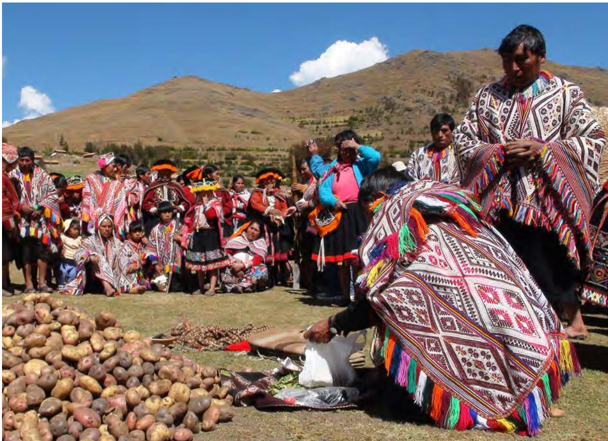
Mountain communities celebrating National Potato Day in Peru.

Engaging with mountain communities in rural areas can be challenging for cultural and historical reasons. Mountain peoples often belong to indigenous or traditional cultures with different languages, dialects, worldviews and values, and tend to be economically and politically marginalised. Hence it may be necessary to work with local NGOs and CBOs trusted by the community, spend time building trust and mutual understanding, and follow local etiquettes. Community priorities and worldviews should be discussed, as well as key project concepts like EbA and ‘ecosystem services’. Equivalent local concepts should be sought where possible and used to frame the EbA process. For example, the Andean worldview is represented by the ayllu concept, which consists of three realms: the wild, the domesticated and the spiritual, which have to be in balance to achieve well-being – ecosystem services can be explained in relation to these three realms.