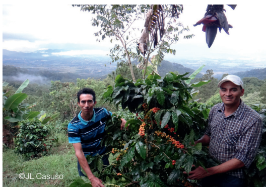
Working at CONACADO, Dominican Republic

Fair Trade is a very new concept in the Philippines. Awareness is still very low. However, local government have been carrying out some of the Fair Trade principles. In particular, each province, city and municipality in the Philippines annually celebrate a festival to help local craftsmen and producers to directly sell their goods to consumers. Often, this is also where they meet foreign traders who will eventually export their products. In the Bicol Region (south of Manila), they have an activity dubbed as "Meeting people behind the products" which combines tourism with local production creating links between producers and consumers. This initiative enables consumers, including tourists, to gain understanding on the social and environmental costs of their consumption. This likewise exerts pressure on producers and traders to provide safe and healthy working conditions for the workers.