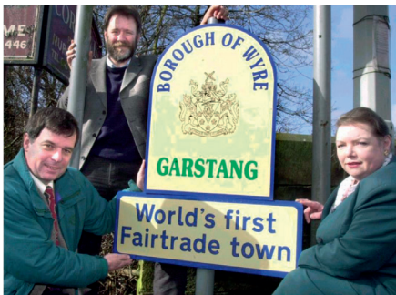
Garstang in Lancashire, UK, world's first Fair Trade Town, November 2001.

The municipality of Traun (23.000 inhabitants) was the winner of the second category. Traun is indeed very active in awareness-raising around the topic of Fair Trade. In particular, it won the award, because it bought Fair Trade Polo T-Shirts to dress three out of four of its staff members. The Jury welcomed this very significant engagement, given the size and possibilities of the municipality.