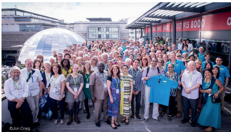
9th International Fair Trade Towns Conference, 2015