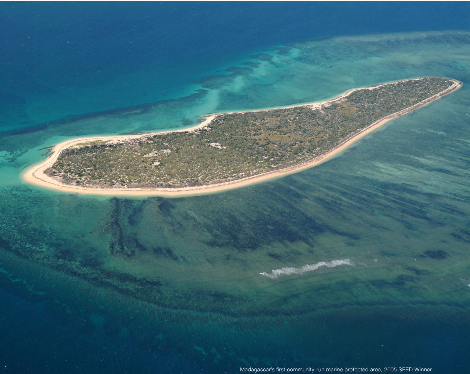
Madagascar's first community-run marine protected area, 2005 SEED Winner