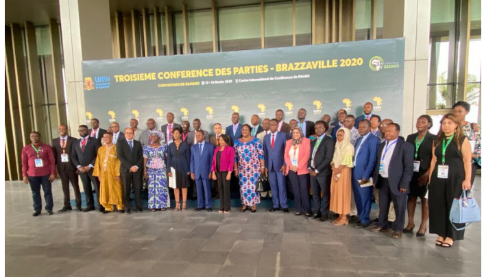
Delegates during the Bamako Convention COP3 in Rep. Congo.

The decisions adopted recommended the provision of information and guidance to member States to promote the ratification of or accession to, and the incorporation into national laws the mechanisms for the implementation of the Convention in order to consolidate actionable efforts to enhance the total ban of the import of hazardous chemicals and wastes into Africa among others. Regional tools and guidelines for the sound management of chemicals and waste in Africa are also being developed in selected member States of the African Union, focusing on decreasing the uncontrolled waste disposal and related negative impacts on human health.