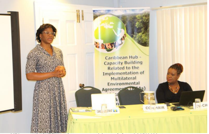
MEAs capacity building and awareness raising workshop.

A similar approach is also being applied in the Pacific on the promotion of synergies and institutional cooperation between biodiversity convention and the relevant daughter agreements of the Convention on Migratory Species on common issues of concern such as Ocean Acidification, Marine Litter and Sargassum.