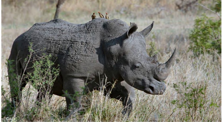
Black rhinoceros walking in a field-one of the endangered species

Biodiversity loss is one of the world's most pressing issues facing humanity. Through this programme, we are supporting ACP countries by strengthening their COPs negotiation skills, developing relevant guidelines, national frameworks, legislations and mechanisms for the effective implementation of the biodiversity cluster of MEAs, which include treaties such as the Convention on Biological Diversity (CBD), Convention on the International Trade in Endangered Species of Wild Fauna and Flora (CITES), and Convention on Migratory Species (CMS), the post-2020 biodiversity framework, as well as supporting governments in creating enabling policy environment and develop transparent procedures to control the illegal trade in wildlife products. The activities are focusing on supporting the effective integration of environmental concerns addressed in the various MEAs into national and regional policies and laws including stakeholders awareness raising.