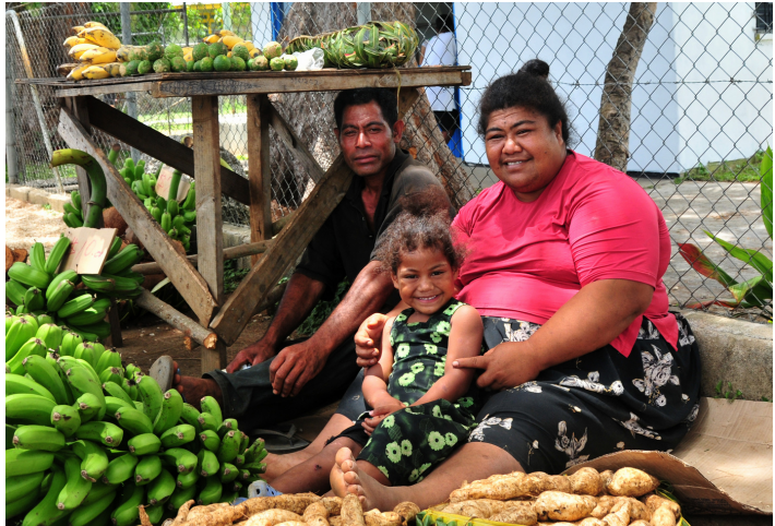
A farming family showcase its produces in Tonga, the Pacific

These interventions build on FAO's previous achievements in the ACP regions where it supported a cross-sectoral approach to the implementation of the CBD by introducing two technical guideline documents for East Africa and the Pacific Islands regions that collect context-specific knowledge and experience on ecosystem-based agriculture while providing policy entry points for mainstreaming at the national and regional levels.