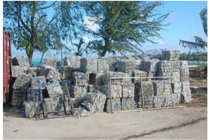
Plastic recycling site, Tarawa, Kiribati.

In the Pacific, the previous waste recycling plant ( i.e. Samoa Recycling and Waste Management Association ) which comprise of local businesses and community groups, in collaboration with the UN Environment Programme, Pacific office and the Pacific Hub is being revived due to its past success in effectively reducing the influx of waste into the marine environment.