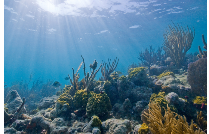
Underwater view of coral reef in the Pacific.

Moreover, the creation of national environmental management strategies in Small Island Developing States (SIDS) like Tuvalu, Vanuatu, with support provided in the review processes in Tonga, Solomon Islands, the Republic of Marshall Islands, among other Pacific Island States are among the achievements of the programme in the Pacific region. The documents brought an integrated approach for the implementation of various MEAs (NBSAPs, National Action Plans for climate change or National Adaptation Programme of Action) and have been particularly successful in tackling environmental challenges in the Pacific Island States. These achievements are being elevated to the next level by the development and deployment of national guidelines to implement NBSAPs as per the Nagoya Protocol and for the implementation of the post 2020 agenda.