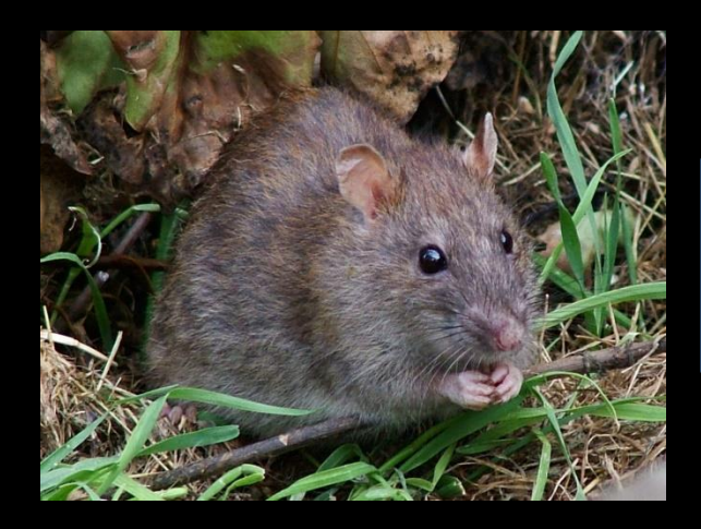
Invasives species (Rats, mice, invasive bushes)