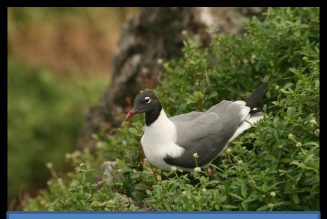
Laughing Gull : 2 500 breeding pairs (20% Caribbean population, southern colony)