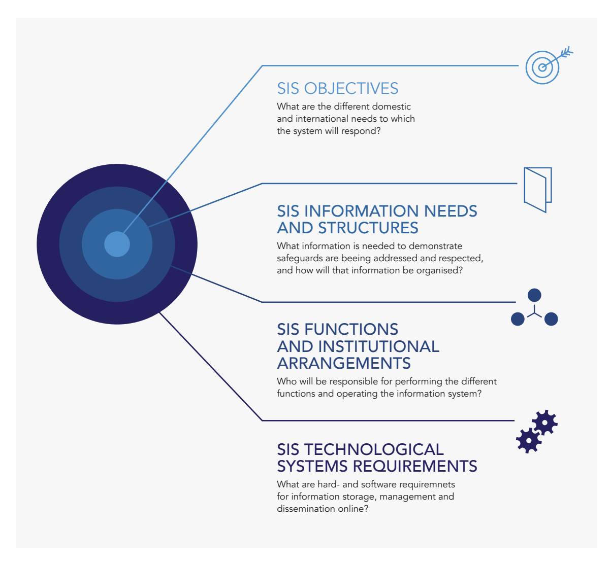
Figure 1: Key design considerations for REDD+ safeguards information systems

SIS design choices and processes are likely to incorporate iterative improvements over time – with a view to expanding or refining system objectives, structure, functions, institutional arrangements and technological platforms over time – in line with the progress of REDD+ implementation. In addition, there rarely is a clear differentiation between SIS design and SIS operation stages. Countries can choose to combine the design considerations with complementary elements needed for putting the system into operation.