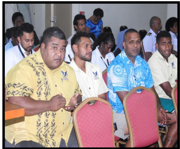
Figure 12: Members of the RAC Association; Ba Provincial