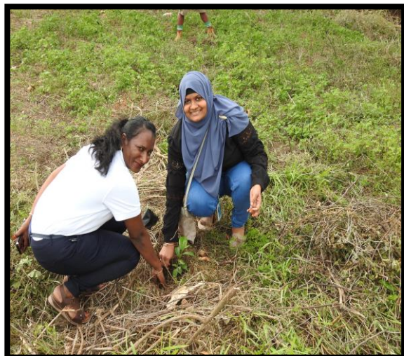
Figure 24: Representatives from the Fumigation Sector