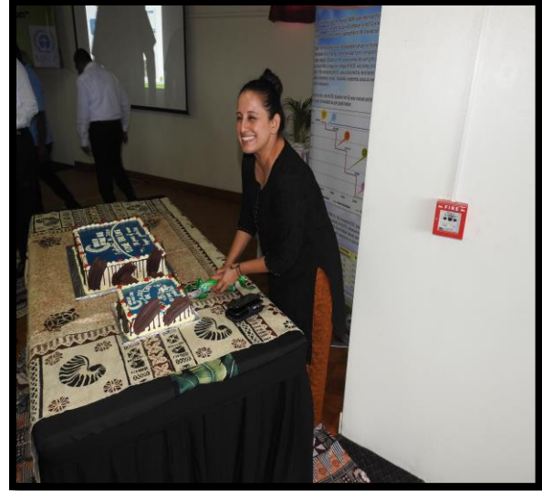
Figure 10: Director Environment cutting the Vegetarian cake