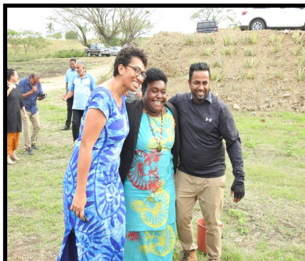
Figure 22: (L-R) SEO-ODS, Director Forestry West & TO-ODS