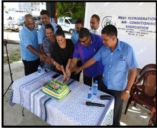
Figure 13: Hon. Minister giving few words before Practical Session Figure 14: Cutting of the Ozone Day Cake from West RAC Association