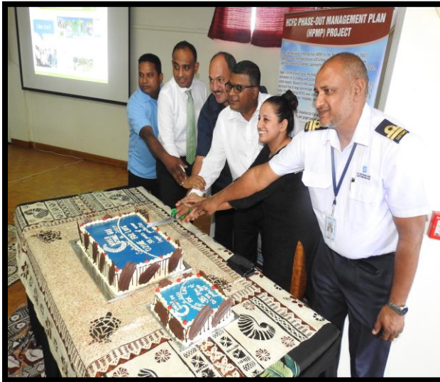
Figure 9: Cutting of the Ozone Day Cake