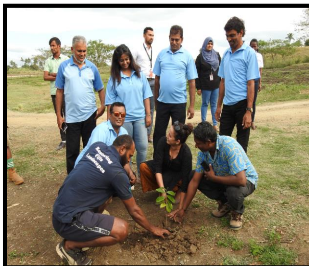
Figure 21: Director Environ. planting a fruit tree with RAC members