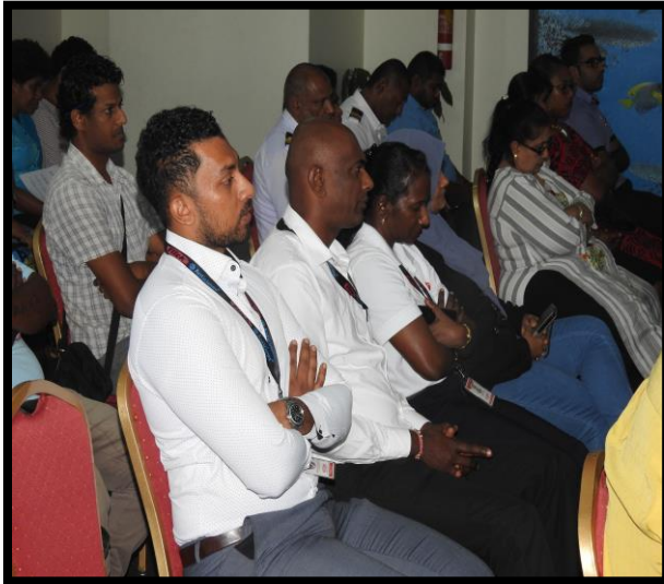
Figure 7: Representatives from the Fumigation Sector