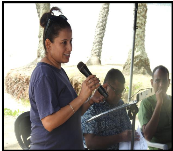
Figure 25: Director Environment with welcoming remarks