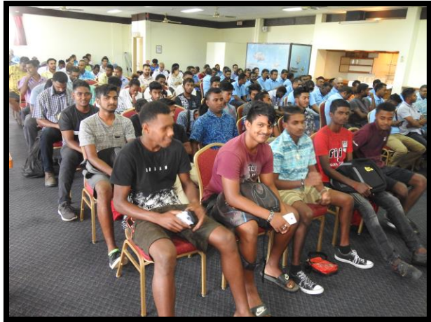
Figure 6: Students of Nadi Technical College of Fiji