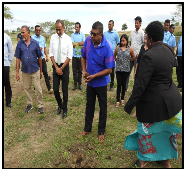
Figure 19: (L-R) Owner of Nursery Farm, PS & Minister