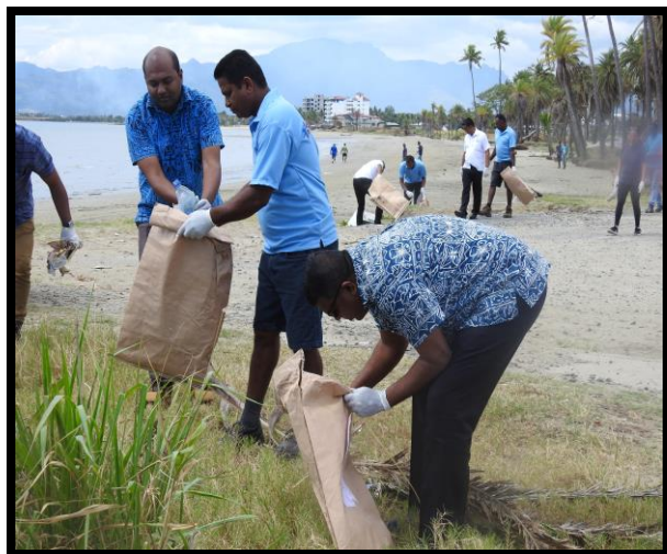
Figure 27: Minister picking of rubbish along the Wailoaloa beach