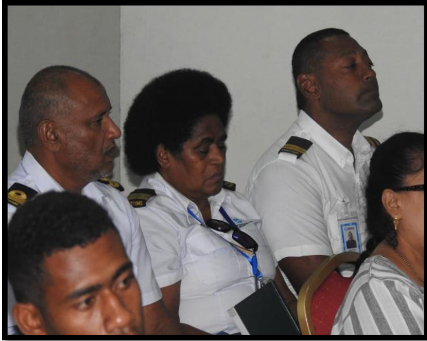
Figure 11: Chief Customs Officer (FRCS) - Nadi & his team