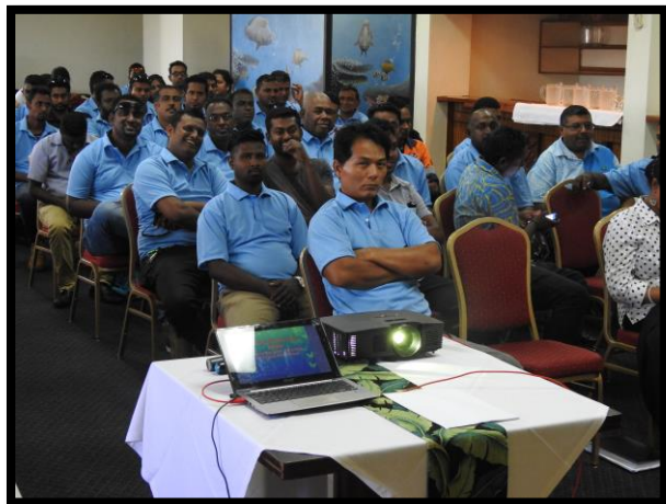
Figure 5: Members of the West RAC Association