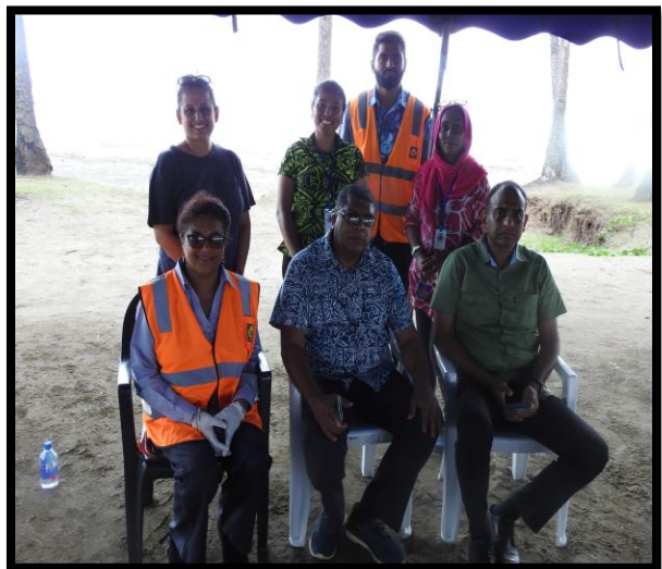
Figure 29: Management with the Nadi Town Council staffs