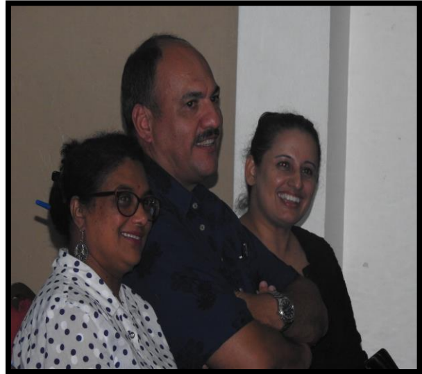
Figure 8: Director Environment with CEO & Senior Health Inspector-NTC