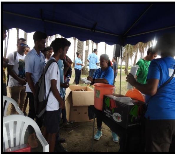
Figure 30: Students of TCF receiving their lunch packs