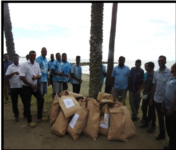
Figure 28: RAC members with their litter collection