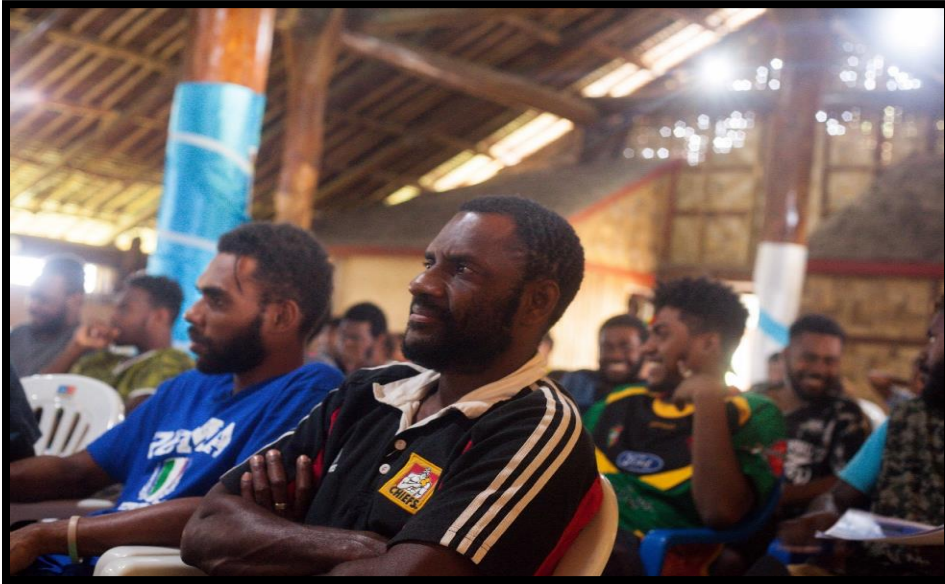
Fig 1.1 Participants during the quizzes session.

Below are some pictures taken during the event: