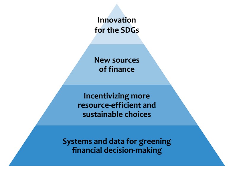
Figure 1: A Framework for Understanding Green Digital Finance

Second, an analytical framework was developed to conceptualize the relationship between digital applications and green finance. These applications can be understood through a four-layered framework (Figure 1). The first, bottom layer in Figure 1 includes digital finance applications that 'green' financial decision-making, notably by making large amounts of data available at high speed and low cost for better ESG integration and pricing of environmental risks and opportunities, as well as by improving measuring and validating the 'greenness' of investments. Moving up the pyramid, digital finance promotes inclusion and innovation, incentivizing more resource-efficient consumption and production action, unlocking new sources of finance through direct citizen engagement, and matching investors and green financing opportunities. At the top of the pyramid, digital finance unlocks innovation and new business models in the real economy that promote entrepreneurship and make investments commercially viable in green sectors, particularly for venture capital and impact investing. Overall, digital finance promotes more inclusive economic growth, based on easier engagement of consumer-citizens, as well as greener growth, based on its ability to scale green innovation.