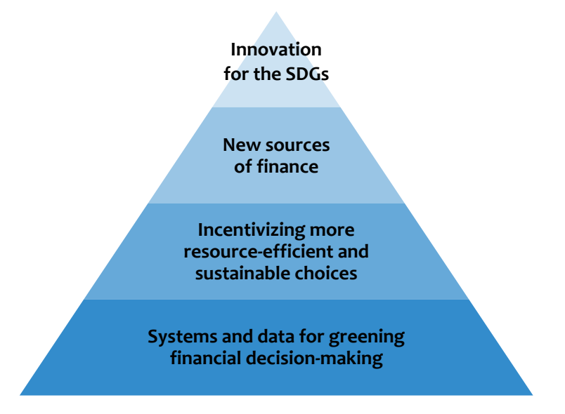
Figure ES1: A Framework for Understanding Green Digital Finance

To unpack and better understand these possibilities, the study employed the analytical framework shown in Figure ES1. Firstly, the framework serves to illustrate that digital finance 'greens' financial decision-making through its unprecedented power to make more data available more cheaply, quickly and accurately. This enables better pricing of environmental risks and opportunities, while also reducing transaction costs (specifically search costs for information). Secondly, the framework highlights that digital finance promotes inclusion and innovation; this advances more resource-efficient consumption and production patterns, unlocks new sources of finance, and enables new business models in environmentally friendly sectors by promoting entrepreneurship and making investments in these sectors commercially viable. It, therefore, promotes more inclusive economic growth, based on easier engagement of consumer-citizens, as well as greener growth, based on its ability to scale green innovation. These benefits enable the financial sector to more closely interact with the real economy and better align financial flows with a low-carbon and resource-efficient pathway.