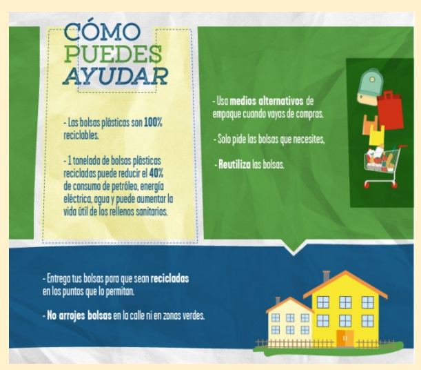
Figure 1 and 2. Materials of the campaign "Reembólsale al Planeta".