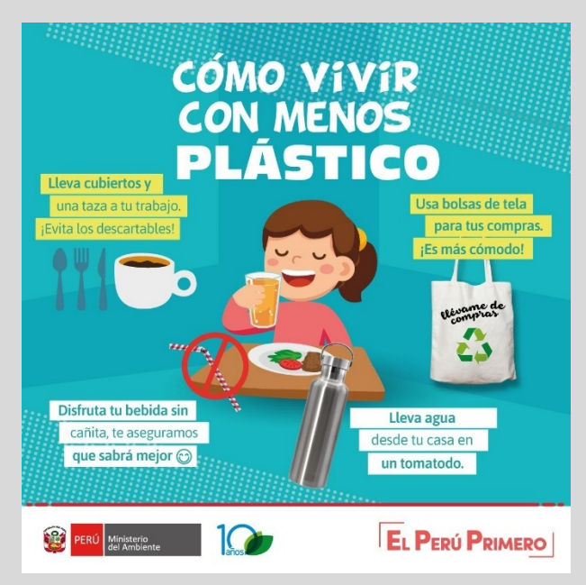
Figure 3 Menos Plástico, Más Vida

This law does not seek to ban all plastic, but only prohibits those plastic products that are unnecessary, cannot be recycled, or pose a risk to public health and/or the environment. In this