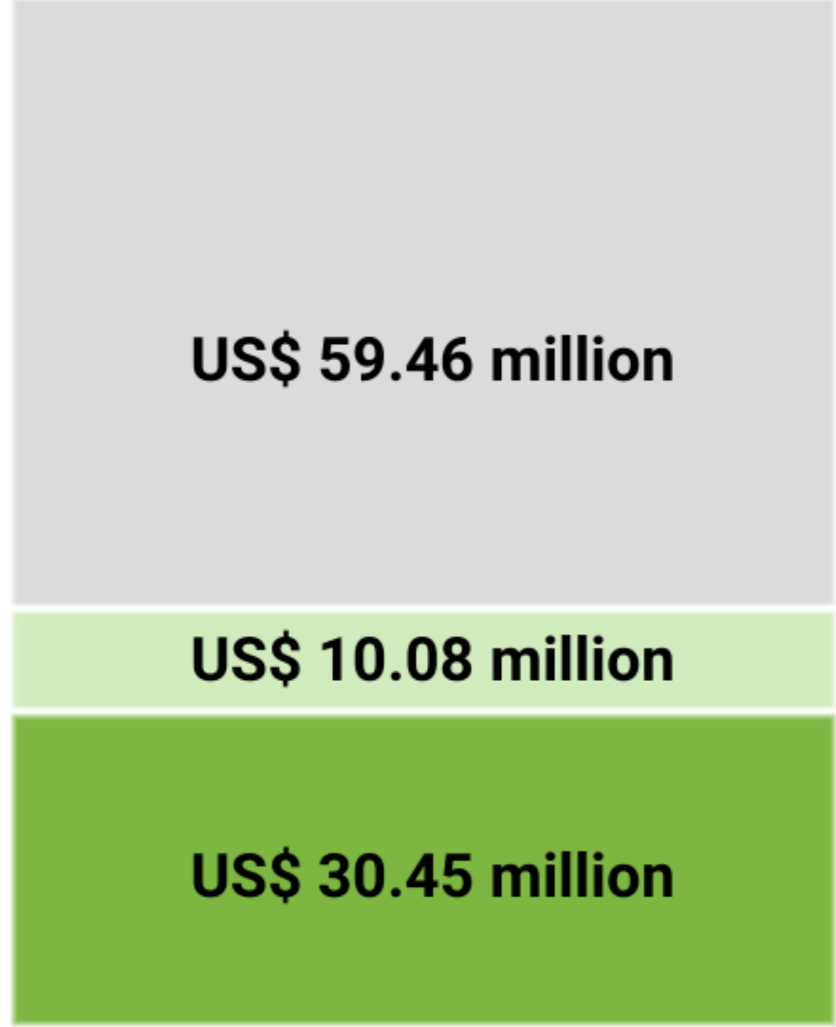
■ "fair share" contributions ■ Other contributions ■ Unfunded