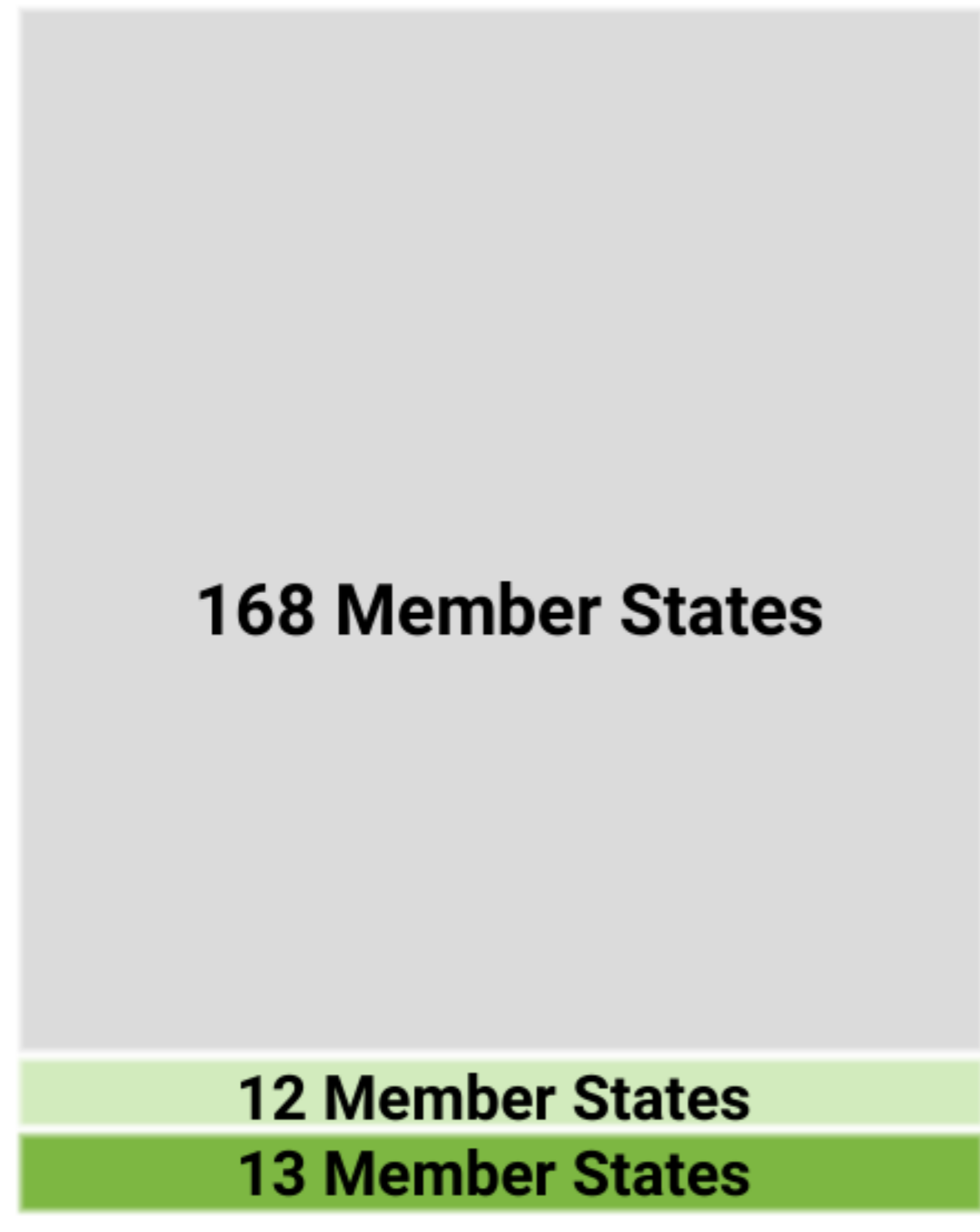
■ "fair share" contributors ■ Other contributors ■ Non-contributors