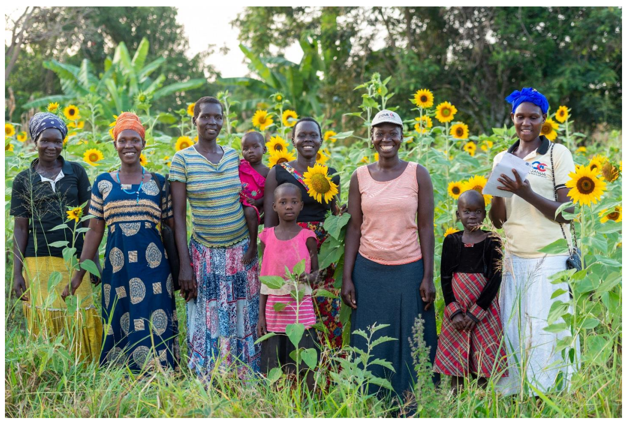
SWITCH Africa Green beneficiaries at their farm in Lira, Uganda