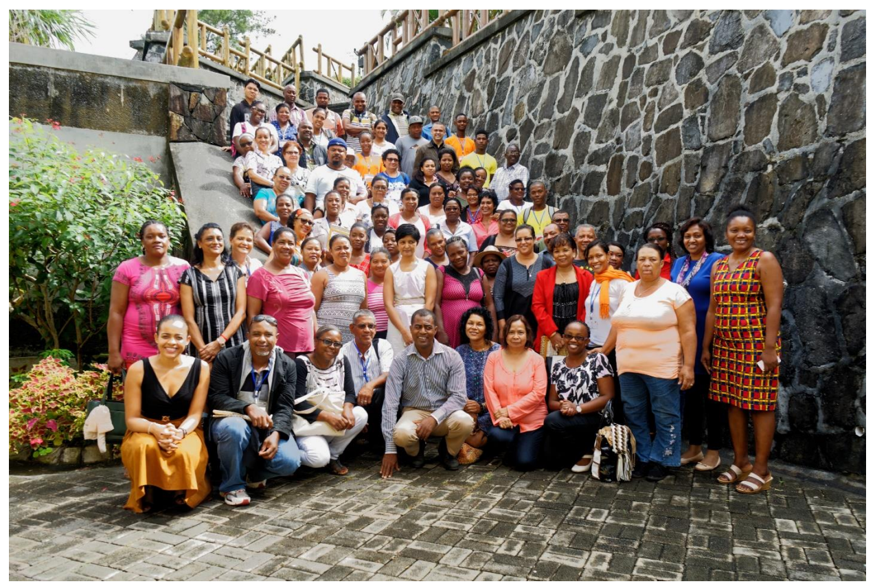
SWITCH Africa Green stakeholders at a previous workshop in Rodriguez, Mauritius