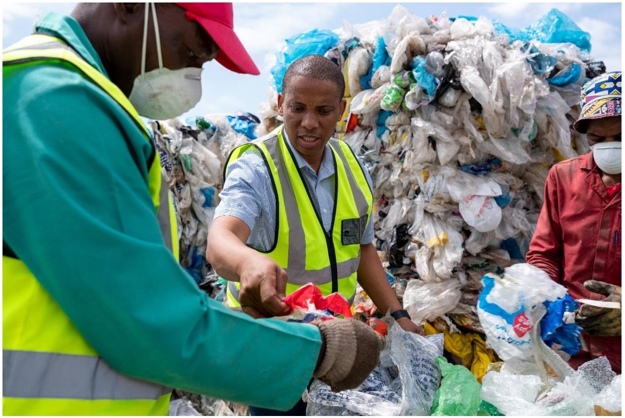
A beneficiary of (the grantee) the Switch Africa Green programme from South Africa at work