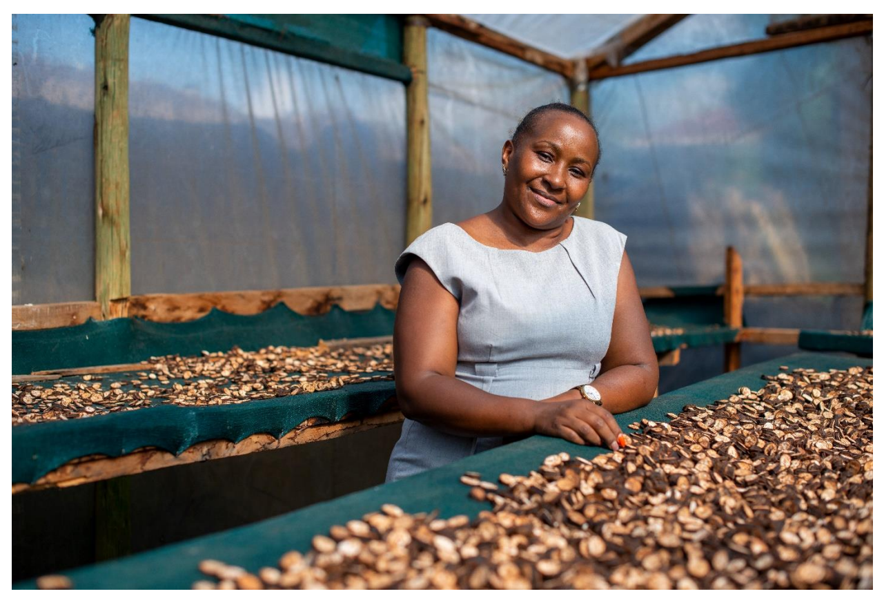
A beneficiary of the Switch Africa Green programme in Kenya shows off her raw materials used for value addition

Inclusive Green Horticultural processing sector in Kenya implemented by SUSTALDE Fundacion