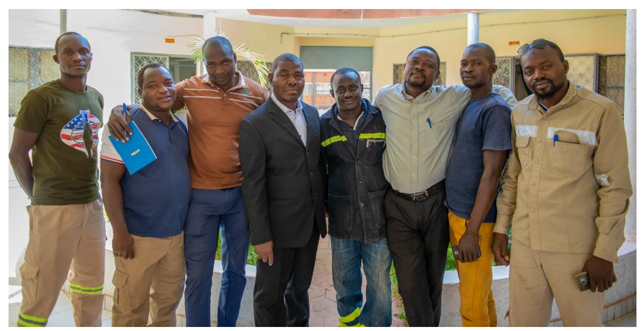
SWITCH Africa Green beneficiaries from Bobo-Dioulasso in Burkina Faso.