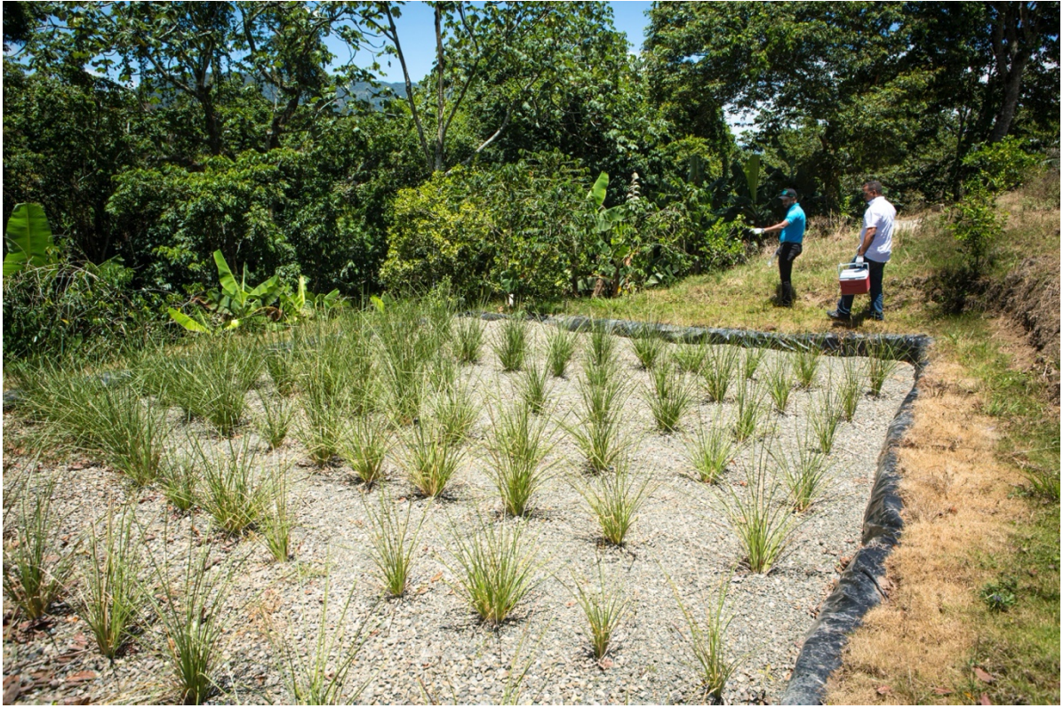
Figure 1: Constructed wetland in the Dominican Republic.