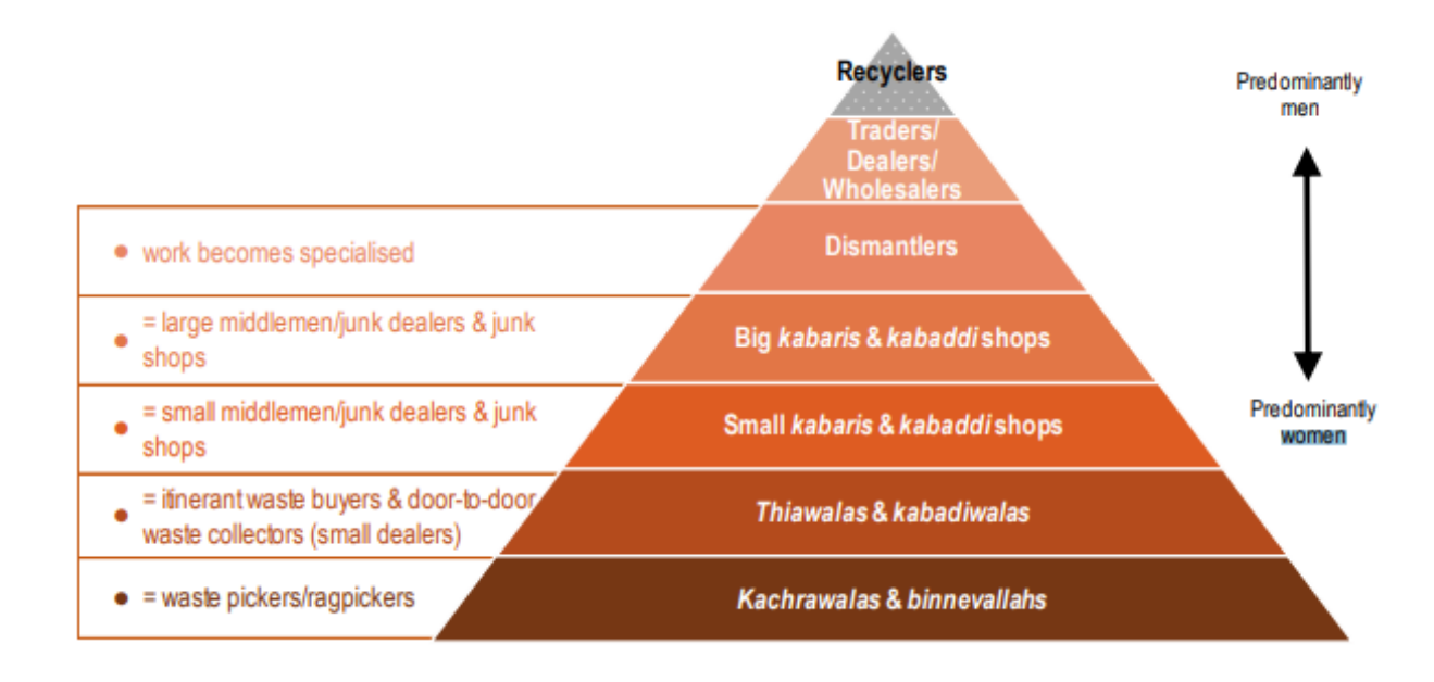
Figure 3. Informal e-waste sector hierarchy in India