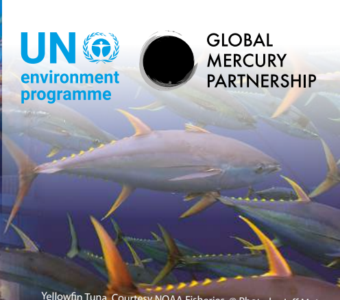
Yellowfin Tuna