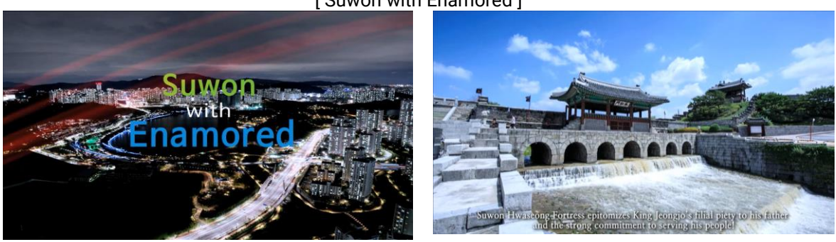
[Suwon with Enamored]

http://tv.suwon.go.kr/index_link.do?ocode=20190806171406236