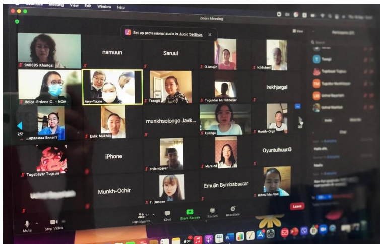
The high school students and the organizers