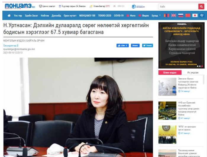
The ministry's greetings on Montsame

The minister's greetings were also published on Montsame which is the official state owned news agency of Mongolia. Please find the link here .