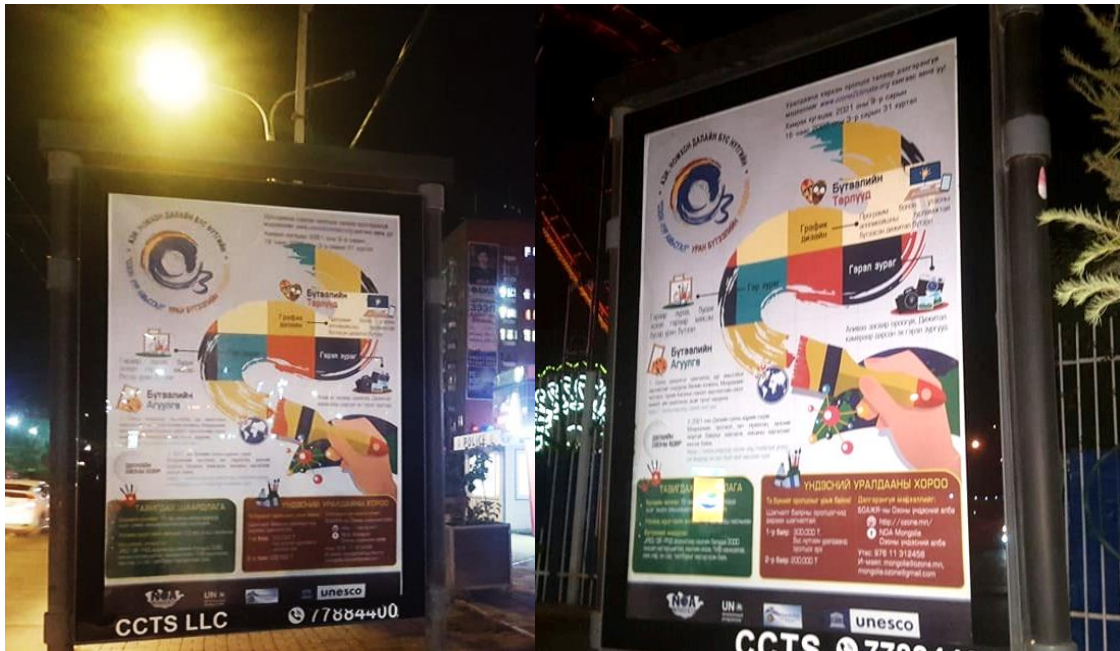
Information poster placed on advertising boards

Moreover, the contest was launched at the ‘Clean Water Resources and Nature Conservation Center’ to reach out to youths through their activities, which started by the Virtual awareness workshop for high school students in collaboration with 18th secondary school .