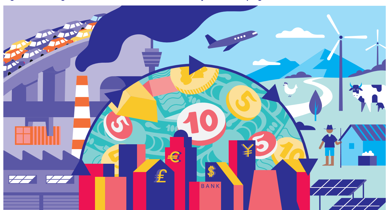
Figure 3: Shifting focus of assets towards sustainability and developing countries

and integrate climate and environmental risks in the financial system. [79]