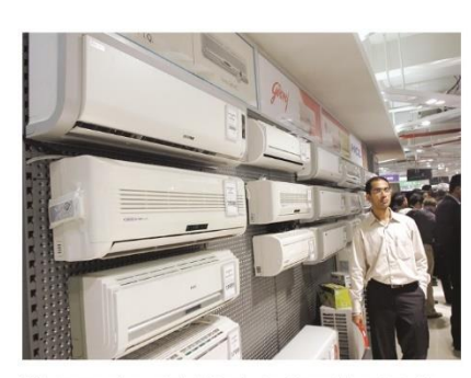
With heat waves sweeping across India, India's cooling demand is expected to grow five to eight

In March 2019, the environment ministry launched the ICAP to address cooling requirements by prioritising energy-efficient and climate-friendly cooling technologies. The plan sought to reduce cooling demand across sectors by 20-25% by 2037-38, reducing refrigerant demand by 25-30%, through strategies such as the adoption of non-refrigerant cooling technologies.