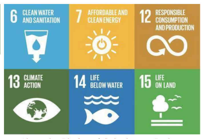
About the Platform | Submit your Project

Yale Forum on Religion and Ecology as we partner with UNEP's Faith for Earth Initiative, Parliament of the World's Religions, and United Religions Initiative launch interactive to an database tracking religious activity within the scope of environmentallyfocused Sustainable Development Goals.