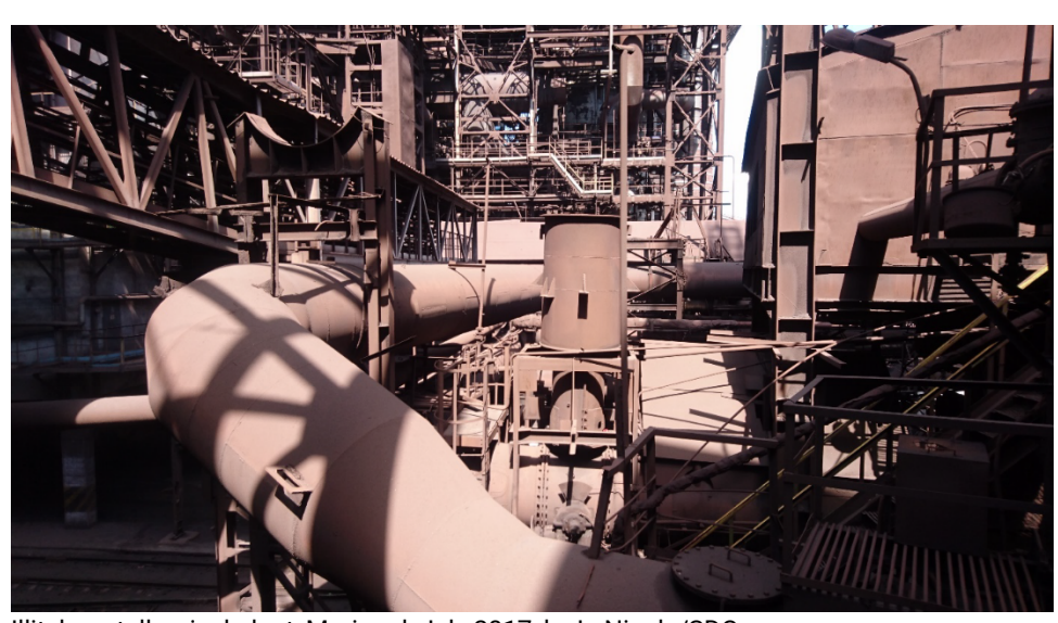
Illitch metallurgical plant, Mariupol, July 2017

The aim of the mission took its shape during the first weeks of the context assessment. It has been mainly oriented towards collection of evidences, mapping out environmental potential hazards and challenges, assessing the likelihood of selected risks and providing some recommendations that the humanitarian community could introduce to be better prepared for an environmental emergency within the conflict affected area.