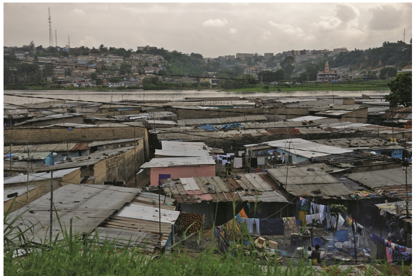
Rapid urbanization of Abidjan has been one of the most significant consequences of the conflict.