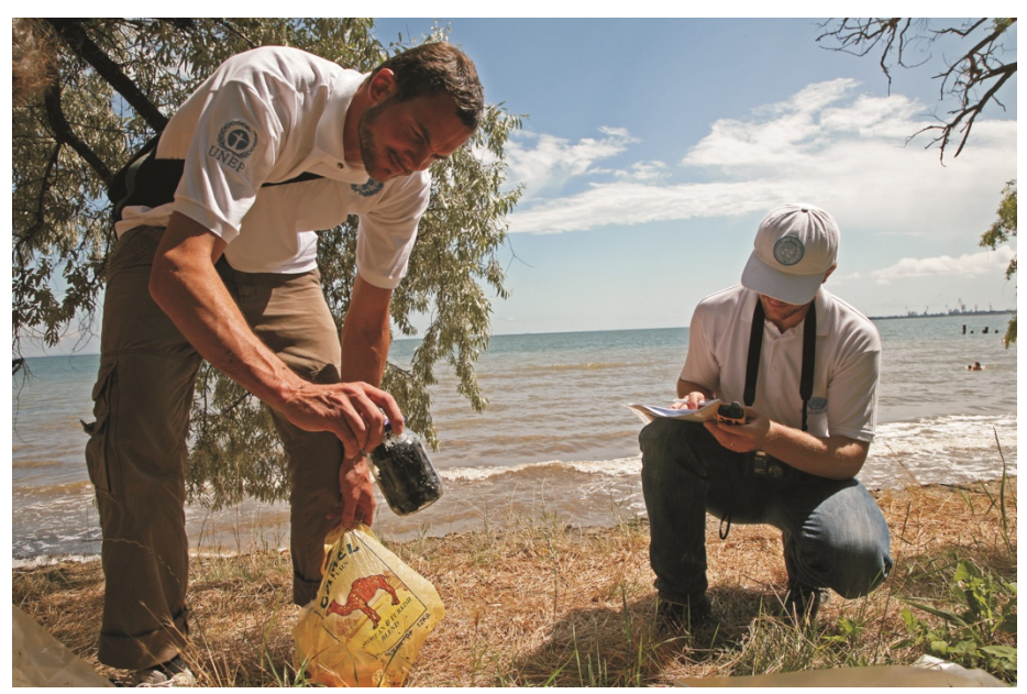
UNEP experts collecting samples from contaminated materials found on the shoreline, 2007, UNEP.