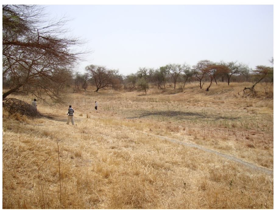
Abandoned Parikworn Pond at Nyigir Payam, Parikworo Boma due to siltation and design problems in Fashoda County, Upper Nile State, UNEP.