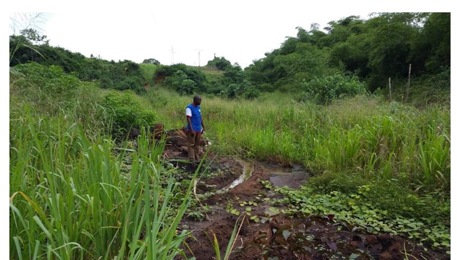
Waste from the Probo Koala are reported to have been dumped from two tanker trucks down the side of the vegetated embankment on the side of the main road linking Abobo and Alépé.