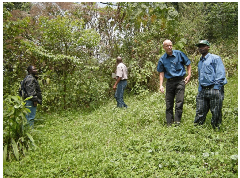
UNEP expert with Ministry of Natural Resources and Forestry Management Support Project officials inspecting rehabilitation of the Gishwati Forest with indigenous species.