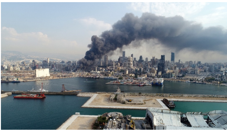
Beirut Port fire, 10 September 2020, by OCHA/Farid Assaf.