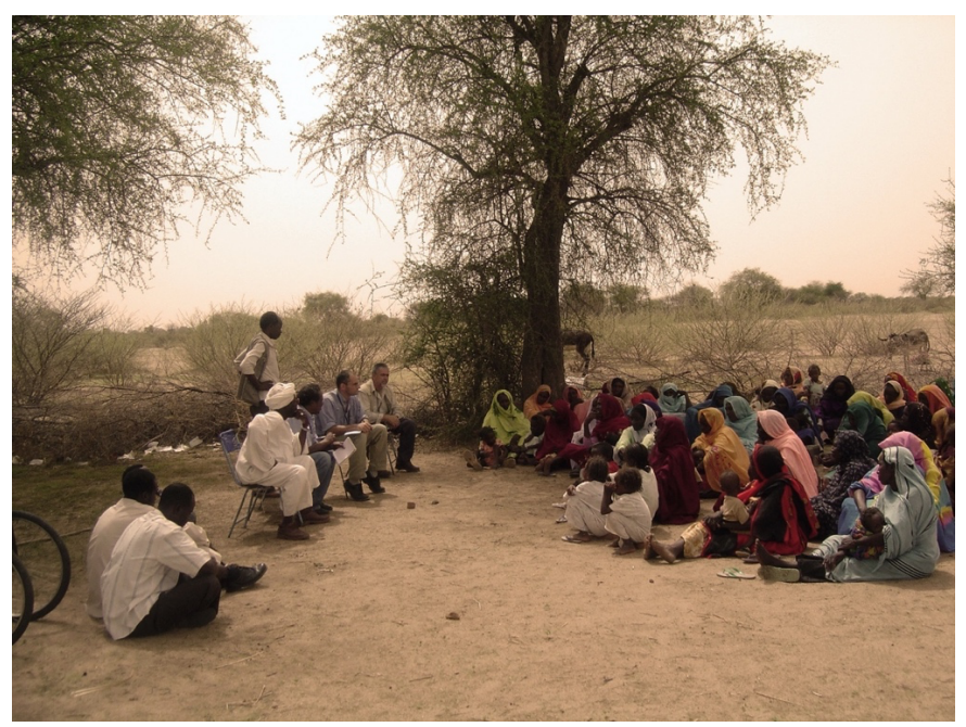
Consultation with local stakeholders formed a large and continuous part of UN Environment's assessment work, as here in the small village of Mireir, Southern Darfur, 2005, UNEP.