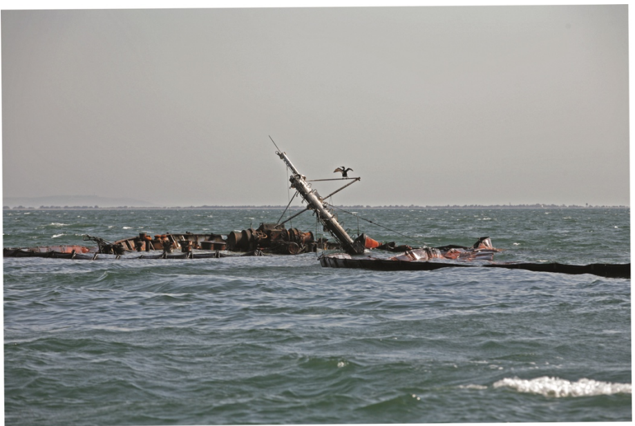
Volgoneft-139 and the broken boom, from which oil still leaks, 2007.