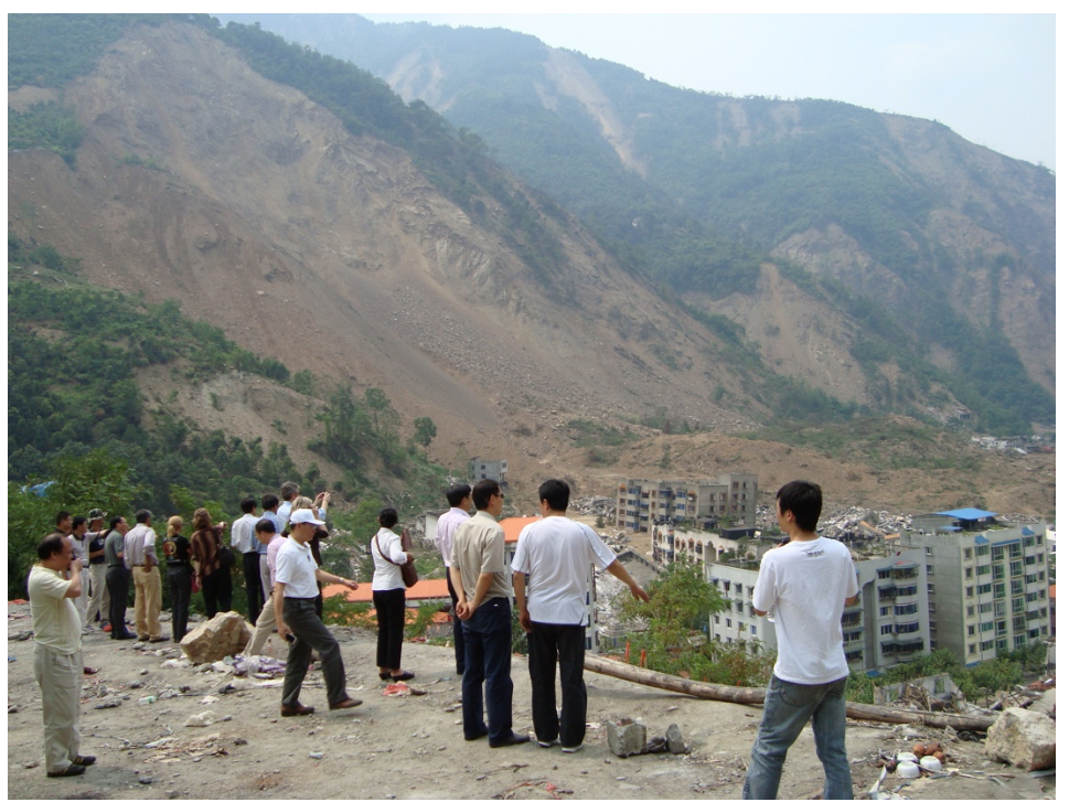
The UN mission to the earthquake-affected region revealed that entire villages had been buried and several cities had become uninhabitable, 2008.