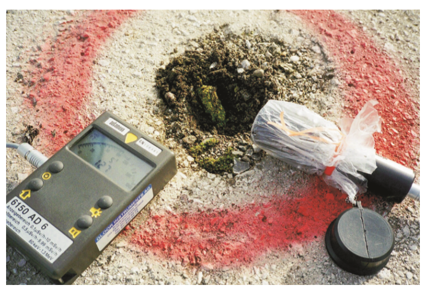
Beta radiation is measured from a penetrator fragment found in the concrete at Hadzici, 2002, UNEP.