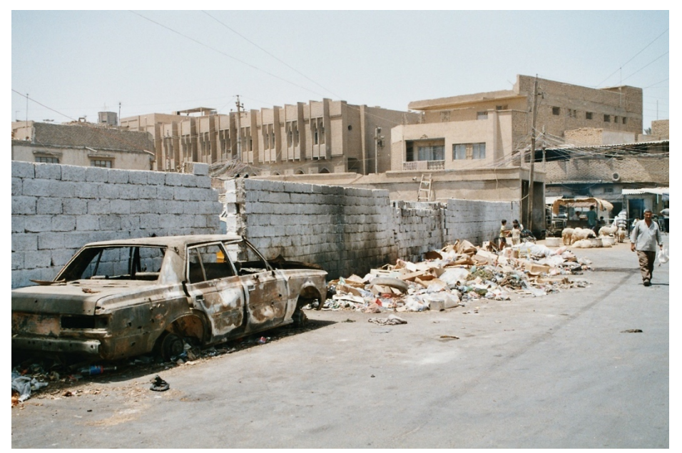
Garbage dump in a street of Baghdad, 2003.