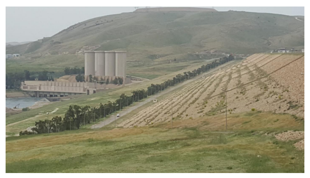
The Mosul dam on 11 April 2016