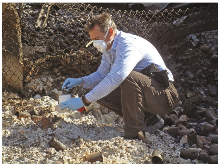
UNEP expert in the Gaza Strip during the UN Early Recovery Assessment mission in January 2009.