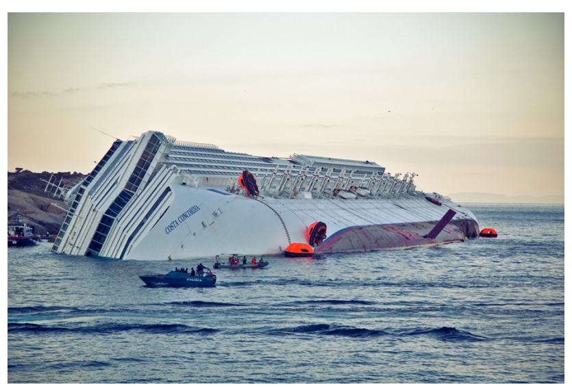
Costa Concordia ship accident, 2012.

Emergency Response Management report available through the Italian Civil Protection.