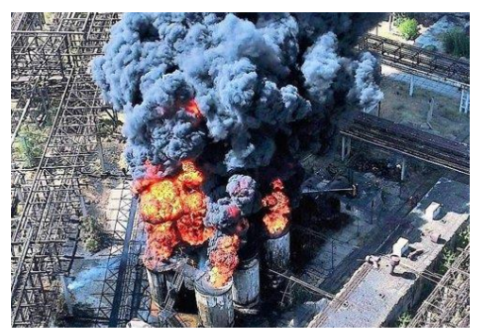
UNEP/OCHA Publication on eecentre.org.

Mission report is available on the EECentre.