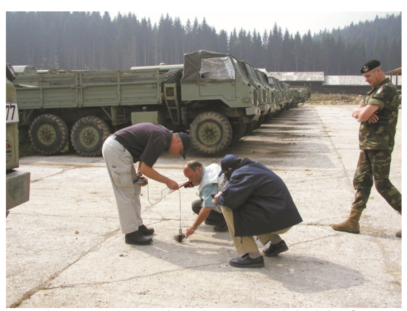
Beta radiation measurements during the pre-mission helped identify contamination spots, 2002, UNEP.