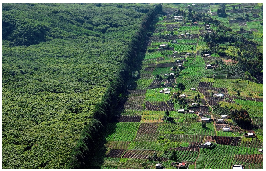
Lacking a buffer or transitional zone, the Volcanoes National Park lies in striking contrast with the densely populated surrounding farmland.