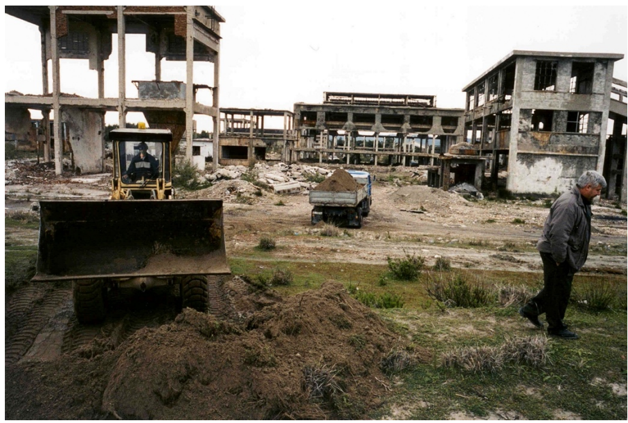
Illegal removal of contaminated sand for use in home construction, UNEP.

Based on the assessment, the government of Albania was found to be making significant strides toward developing its environmental protection capacities. Environmental legislation and programs had improved in recent years. Environmental responsibilities within the Government, however, were widely dispersed and often overlapping. As a result, policies at the time were not coordinated, implementation was found to be slow, and enforcement weak. The monitoring of environmental and health conditions was also inadequate. UNEP concluded that the creation of a strong, adequately financed Ministry of the Environment would help clarify environmental responsibilities, strengthen policy and enforcement efforts, and increase environmental awareness in Albania.