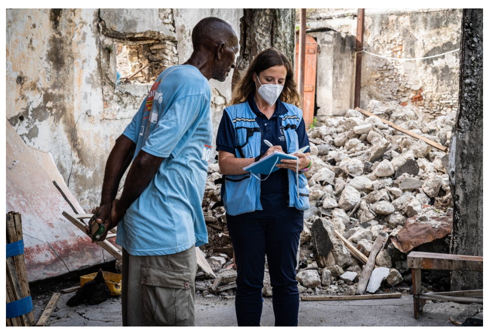
Haiti earthquake response 2021