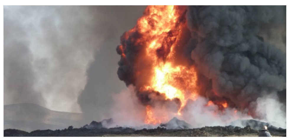
Burning oil wells at Al-Qayyarah