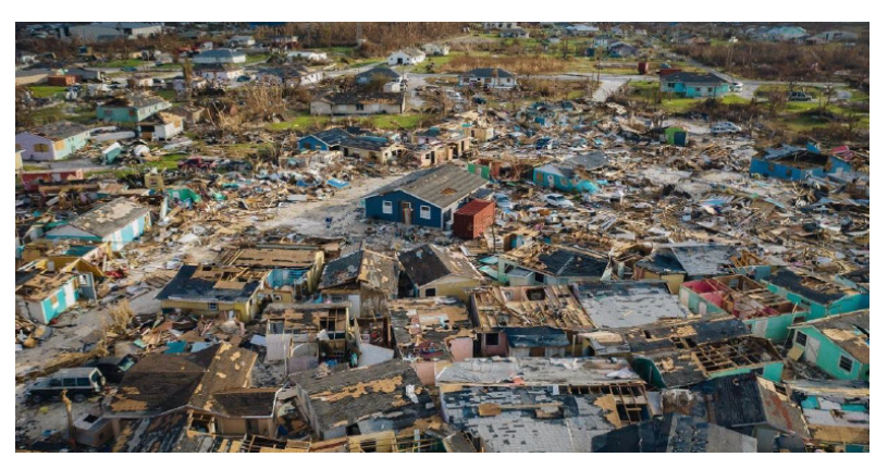
Drone view of Marsch Harbour, Abaco Islands, The Bahamas after Hurricane Dorian, by Samaritan's Purse.