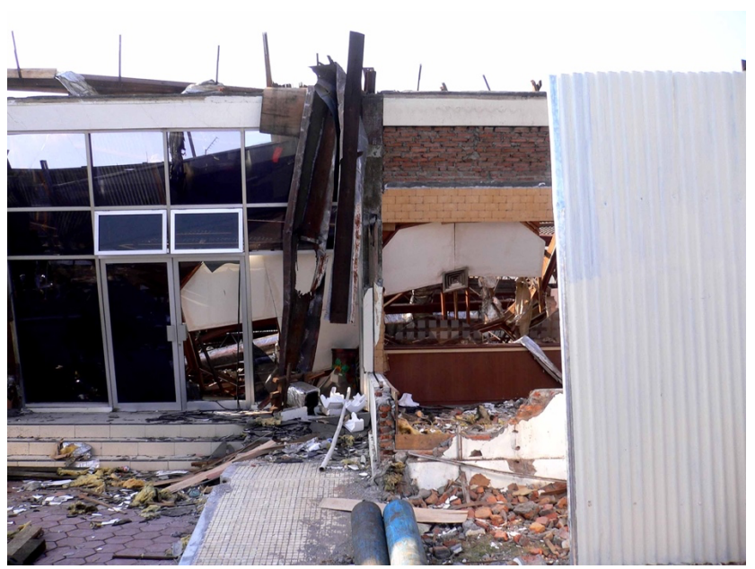
Airport, Earthquake Yogyakarta.