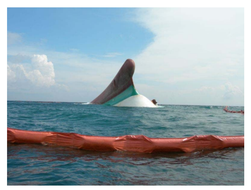
UNEP/OCHA Report, 2008

Mission report available on the EECentre.