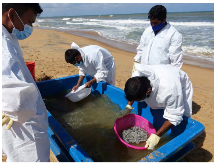
Flotation in seawater. Sarakkuwa beach, Gampaha district, UNEP.