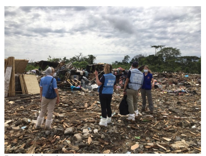
Experts deployed on-site to conduct environmental assessments after ammunition explosions, by UNDAC team member.