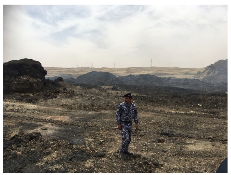
Environmental devastation by ISIS in Qayarrah, 2017, UNEP.