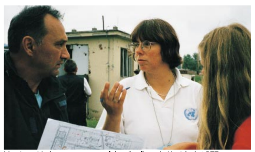
Meeting with the management of the oil refinery in Novi Sad