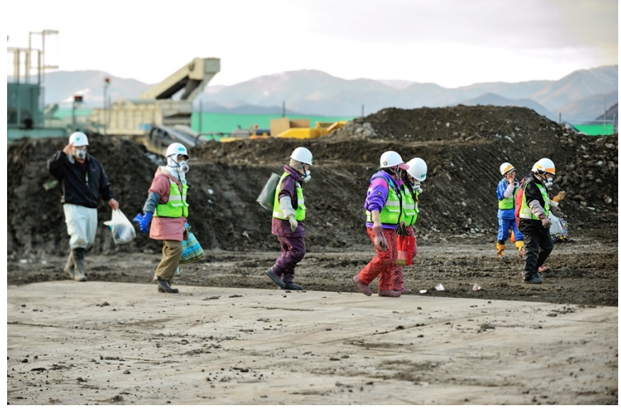
UNEP hopes to use data from the mission to develop an international protocol for estimating the volume of debris in post-disaster settings, UNEP.