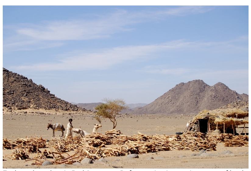
Fuelwood vendors in Red Sea state. Deforestation is a major cause of land degradation in desert environments, 2005, UNEP.

UNEP developed a Sudan country programme and established permanent project offices in Khartoum and Juba. The latter was subsequently relocated to Nairobi, Kenya for security reasons. UN Environment also developed a range of assessment products to assist with the funding and political support required to implement its recommendations.