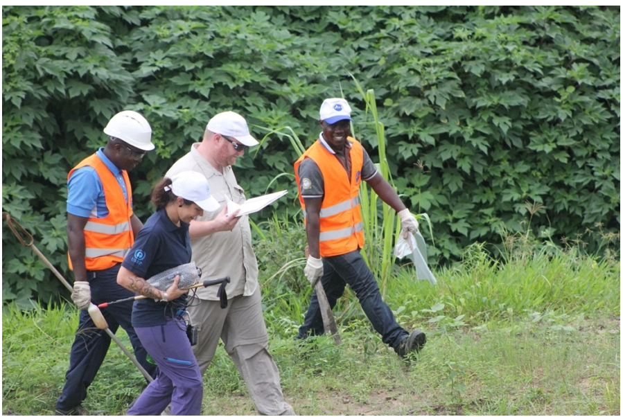
UN Environment expert team undertook sampling of soil, water, air, sediment, mollusks, fruit and vegetables at 18 sites considered to have been affected by the dumping of toxic wastes, as well as at three control sites.