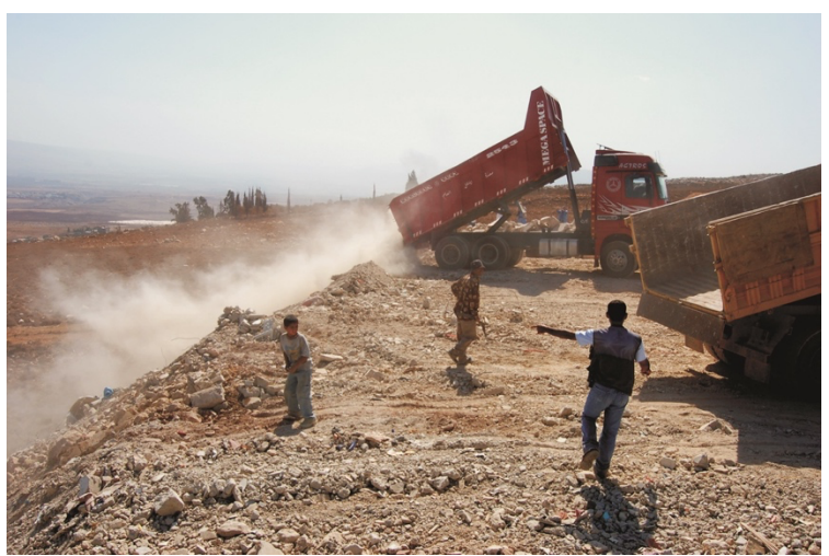
The Khiam dump site illustrates the high levels of dust generation at most rubble disposal sites, 2006, UNEP.

Mission report available on the EECentre.