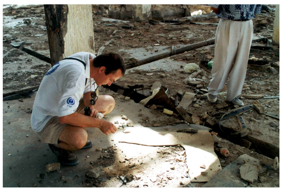
UNEP site inspection at Vlorë complex, Albania, 2002.