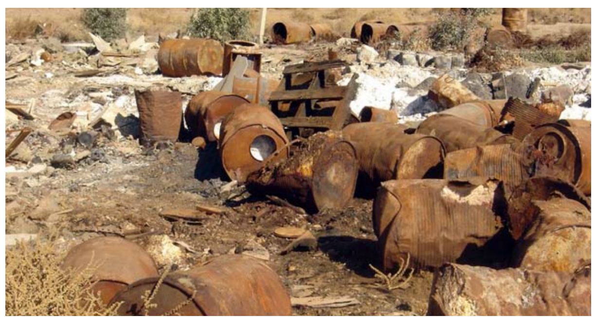
The Al Qadissiya site is unsecured, contains quantities of highly toxic chemicals and has been demolished in an uncontrolled manner, resulting in severe human and environmental hazards, 2003, UNEP.