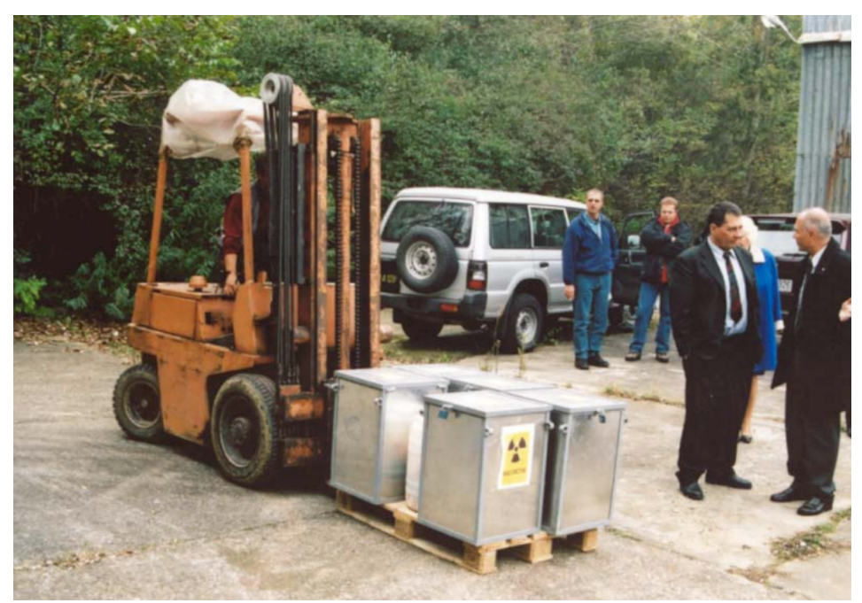
Vinca storage. Five barrels containing radioactive waste from sites targeted by depleted uranium in Serbia and Montenegro are being stored at Vinca, 2002.

In responding to a post-conflict situation, the time factor is crucial. A faster start to the programme, enabled by more immediate availability of financial resources, would have seen even greater environmental benefits.