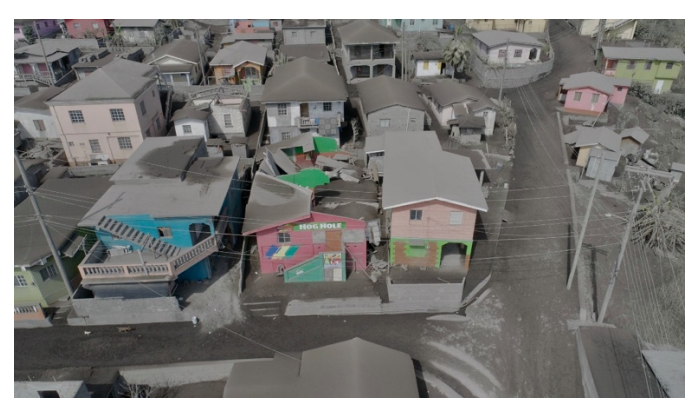
The landscape of St. Vincent and the Grenadines is shrouded in the ash blanket from the eruptions of the La Soufrière volcano, by Stv Online, April 2021.