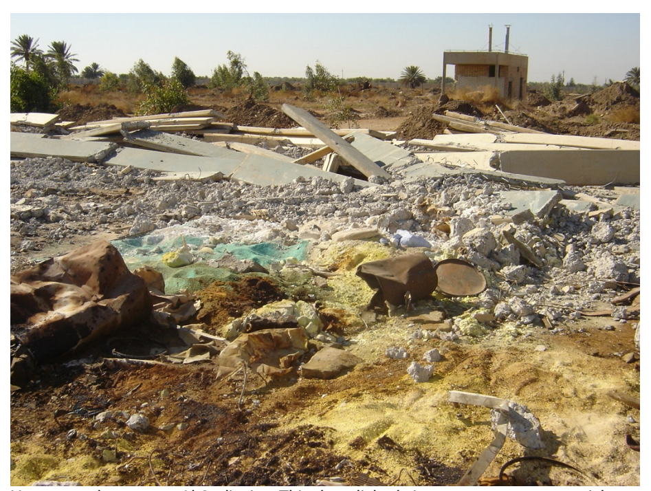
Heavy metals waste at Al Qadissiya. This demolished site represents a severe risk to human health, due to the cyanide contained in hazardous waste, 2003, UNEP.