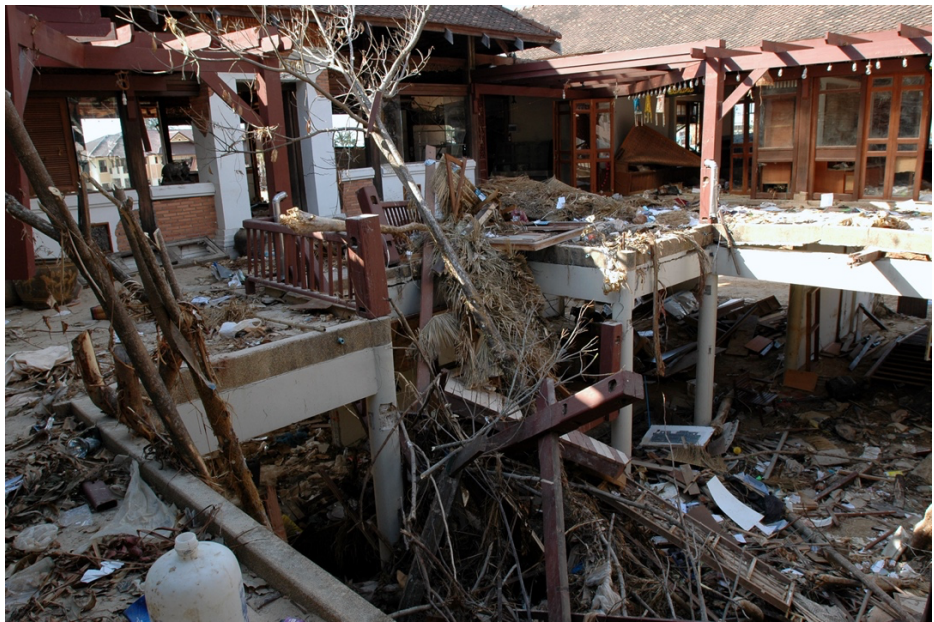
ILO, ©ILO/Marcel Crozet, 2004, Thailand.