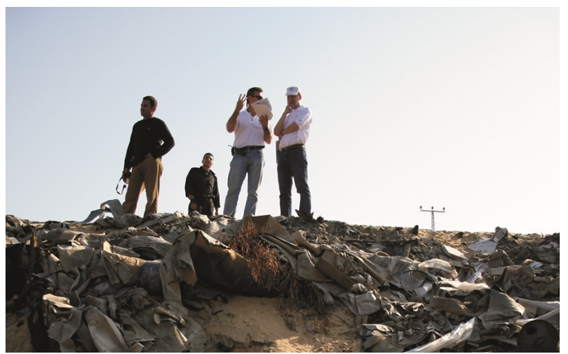
UNEP conducted an environmental assessment of the disengaged settlements: Several locations with localized contamination were identified, 2008, UNEP.

This report, which was later submitted to then-UN Secretary-General Ban Ki-Moon, was the latest post-conflict environmental assessment undertaken by UNEP at the time. This report outlined a range of economically costed options for managing the current situation and leading the Gaza Strip onto a sustainable path, in a hope that the facts and economic analysis presented could assist and guide the relevant national and local authorities and the international community to design forward-looking recovery strategies and transformative investment decisions.