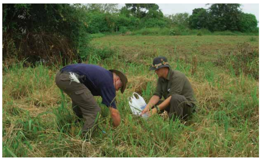
An Environmental Baseline Study was conducted in Mombasa, Kenya on the potential site of the UNSOA logistics base, UNEP.