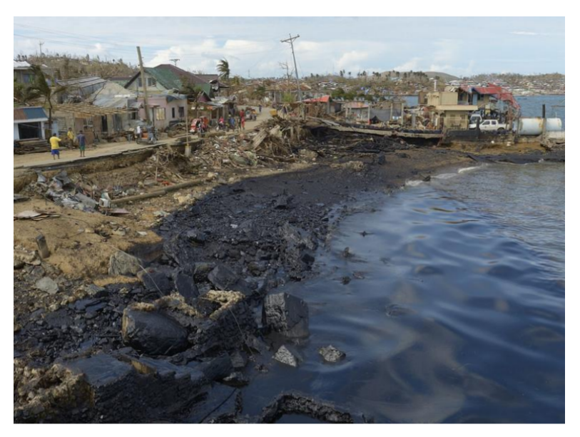
Oil spill in Estancia town, Iloilo province, Philippines, picture taken on 21 November 2013 by Corporal Ariane Montambeault