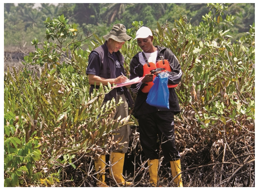
A multidisciplinary team of international and Nigerian experts conducted fieldwork for the UN Environment assessment over a 14-month period, UNEP.