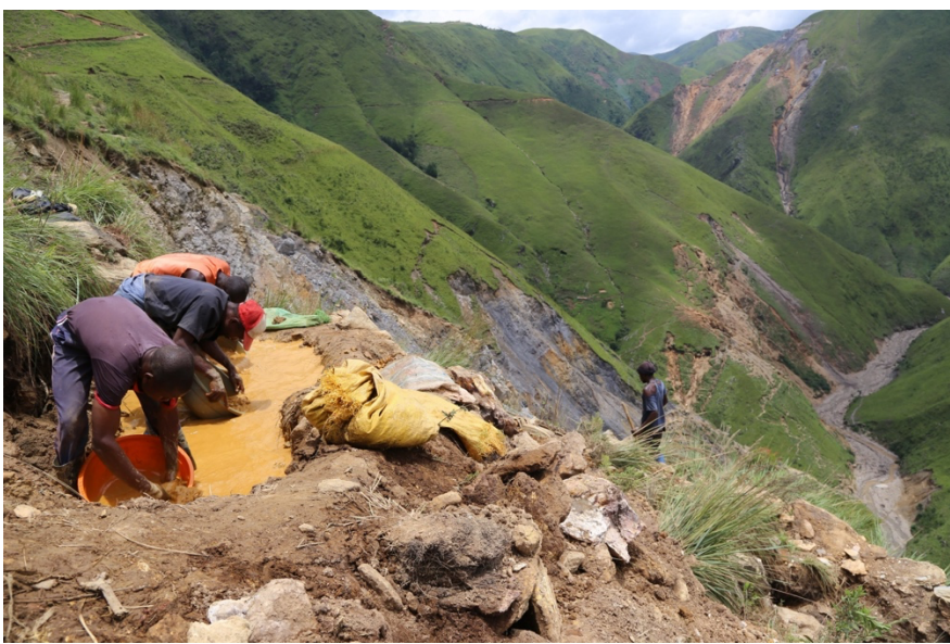
Artisanal mining is impacting landscapes in the eastern Democratic Republic of the Congo, UNEP.

In 2015, UNEP also prepared a background report on the role of environmental crime and illegal natural resources exploitation in fuelling the conflict cycle in eastern DRC, and developed appropriate recommendations to address this predicament, in consultation with the United Nations Organization Stabilization Mission in the Democratic Republic of the Congo (MONUSCO) and other entities. The study's findings were highlighted by the Special Representative of the of the Secretary General to the DR Congo at the Security Council.