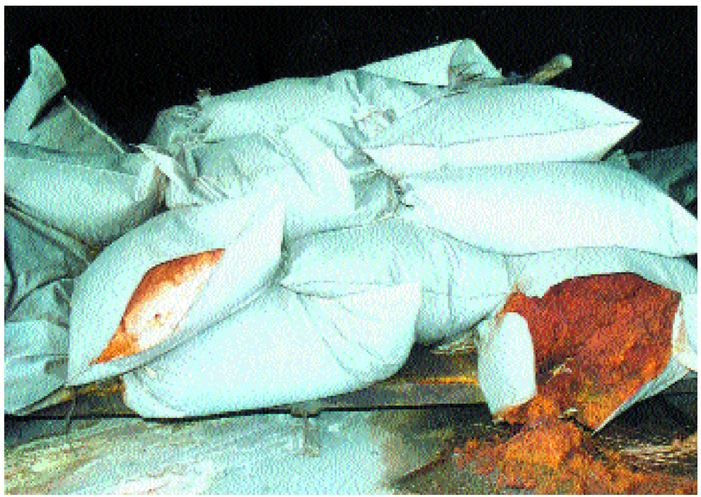
Improperly stored hexavalent chromium compounds at HEK Jugochrom, FYR Macedonia, 2000, UNEP.