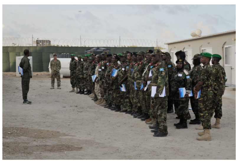
AMISOM, @Tobin Jones

recreational purposes, the beach should be accessed by foot only as this would not harm nest sites to the same extent.