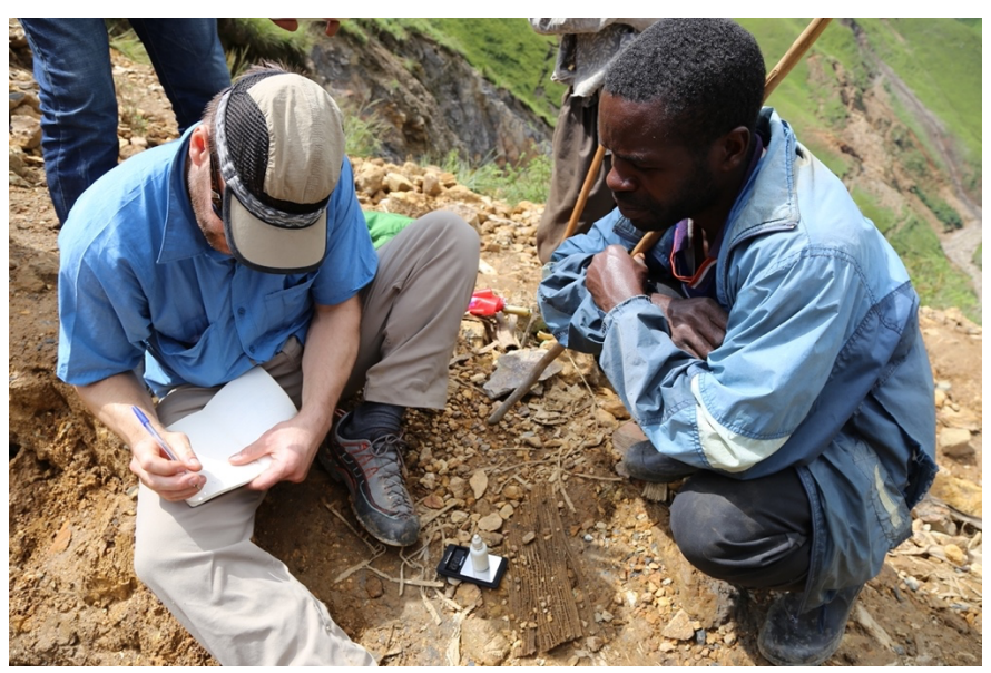
Mercury inventory using an electronic balance to measure ratio of mercury loss to gold produced, UNEP.