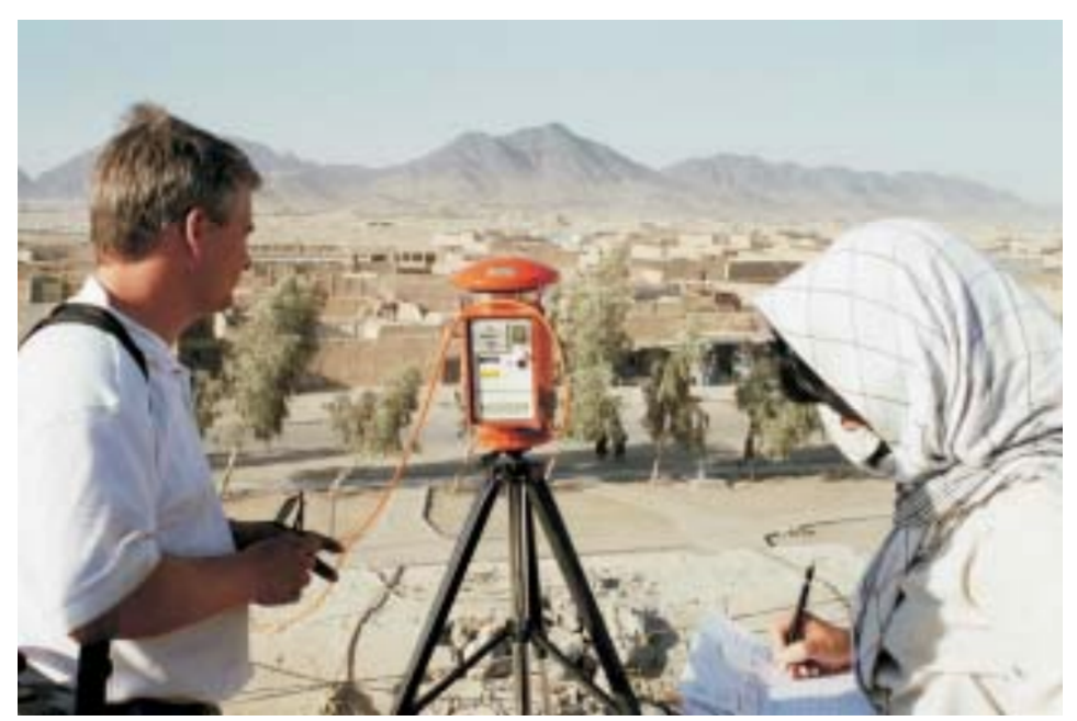
Air sampling along Kandahar's main street, 2002