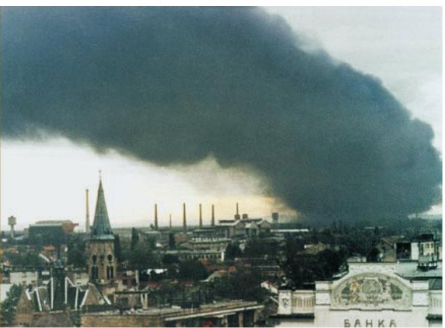
Smoke cloud over Pancevo, April 1999

UNEP recommended that all sites where DU was used be visited and samples taken for analyses of contamination by uranium of well water used for drinking. It was recommended that wells within the attacked areas and in the direction of the groundwater transport be monitored. The local situation determined how far from the attacked area the wells may be contaminated by DU. As the DU contamination is likely to increase with time, the monitoring may have to be repeated. UNEP also suggested that analysis looking for pH, Eh, and total alkalinity, as well as major elements such as calcium, iron, and alkalinity be used to cast light on whether the uranium was in reduced form or oxidized (and mobile), and on the uranium transport capacity of the waters.