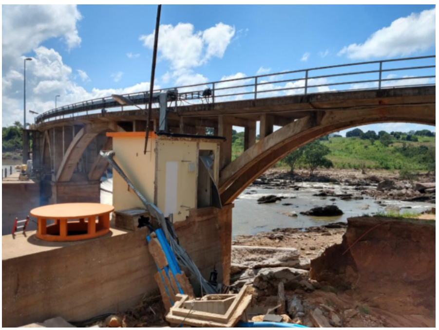
Mavuzi Dam, Manica Province, 9 April 2019 by UNEP/OCHA Joint Environment Unit.