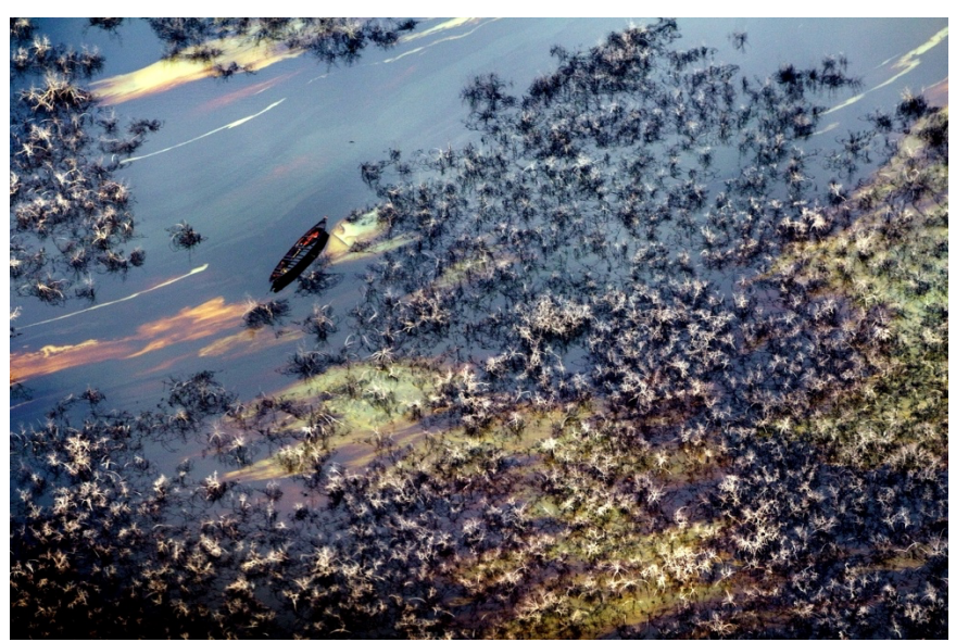
Visible hydrocarbon pollution on surface water in Ogoniland, UNEP.

In summary, the greatest success of this UNEP initiative was to successfully undertake an extremely complex and extensive environmental assessment under very challenging and hostile conditions. Despite this, the final report received broad praise from both the local and international audience. But, arguably, the greatest success of the UNEP team was to win the trust and support of the majority of the Ogoni community – in an environment where such commodities have become rare in the extreme.