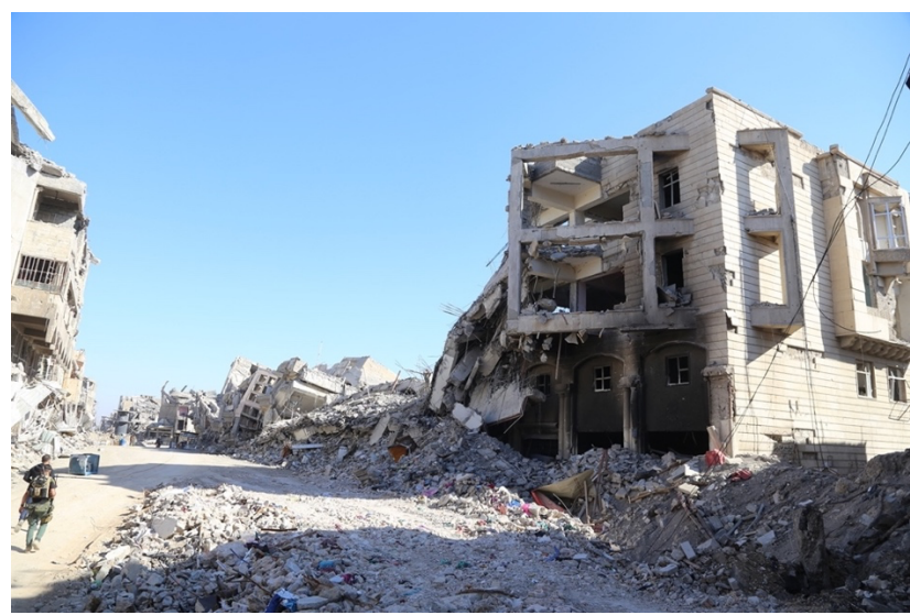
Example of easily accessible rubble on the streets, and 'unreleased' rubble from damaged buildings requiring complex demolition, 2017, UNEP.

equivalent to 10,000 to 15,000 tonnes, the Ministry of Health and Environment requested urgent assistance from UNEP to identify the cause of their demise. Comprehensive laboratory analysis of fish, sediment, water, and fish feed for both microbiological and chemical parameters was rapidly organized by UN Environment in collaboration with the University of Geneva. Consultations on the test results with leading fish pathologists established the root cause of the mass fish kill event to be a lethally infectious viral disease known as the koi herpesvirus disease. Based on the findings, UNEP advised the government on the need to better control the number of fish farms and fish movement as well as improving laboratory diagnostic capacity to prevent similar outbreaks in the future.