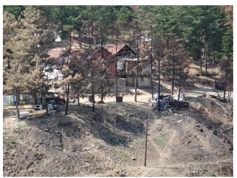
Fire-affected informal settlement of Roma, at the outskirts of Bitola, @Jelena Beronja, UNEP, 2007.