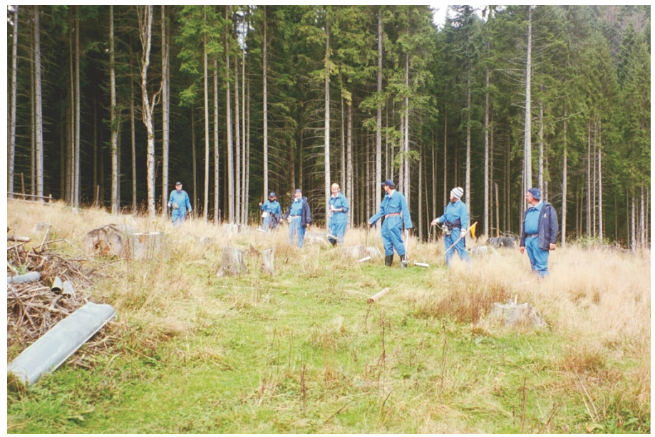
Line surveys with field instruments were undertaken at all sites during the mission, 2002, UNEP.