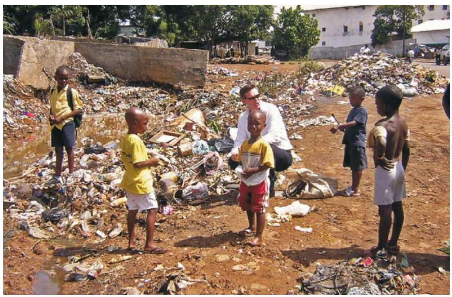
UNEP staff on a solid waste management assessment mission, 2007, UNEP.

UNEP's legacy was recognized in October 2013 with an invitation by the EPA to participate in the forum "Building Partnerships for a sustainable environment for now and tomorrows Liberia". The invitation was issued with the statement "it will be an honour to have you here, you helped to plant some of the (human) seeds that are now germinating. You have been a part of history making the Liberian environment".