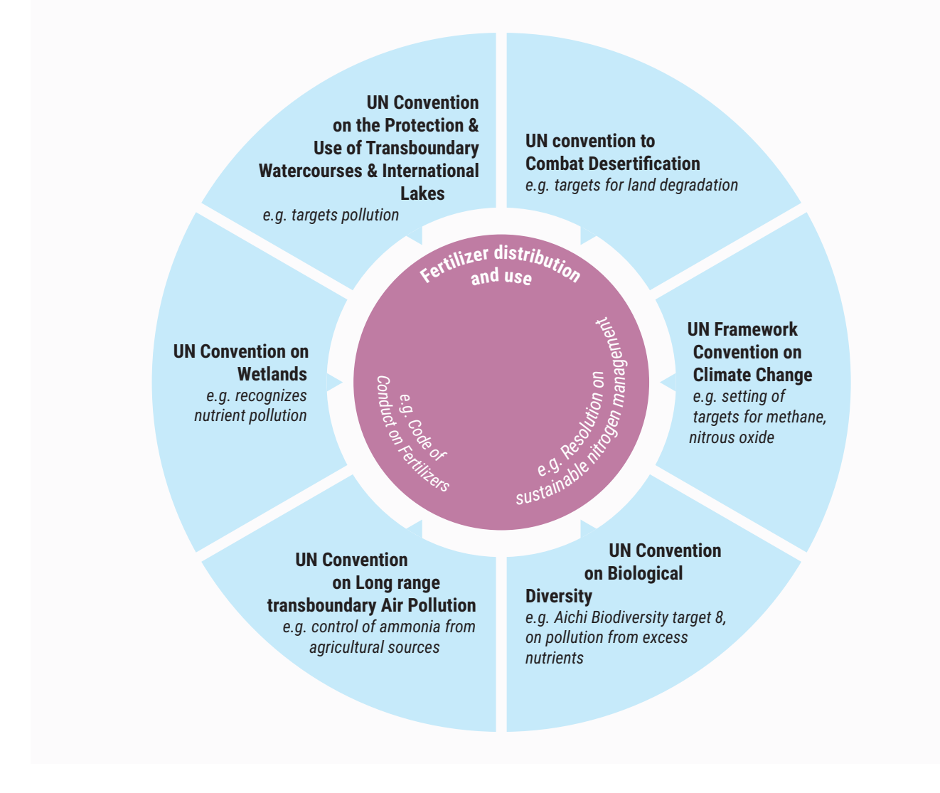
Figure 8.2-1 International Conventions with potential to influence fertilizer distribution and use

The Codex Alimentarius standards and guidelines on food quality consider fertilizers as potential food and water contaminants.