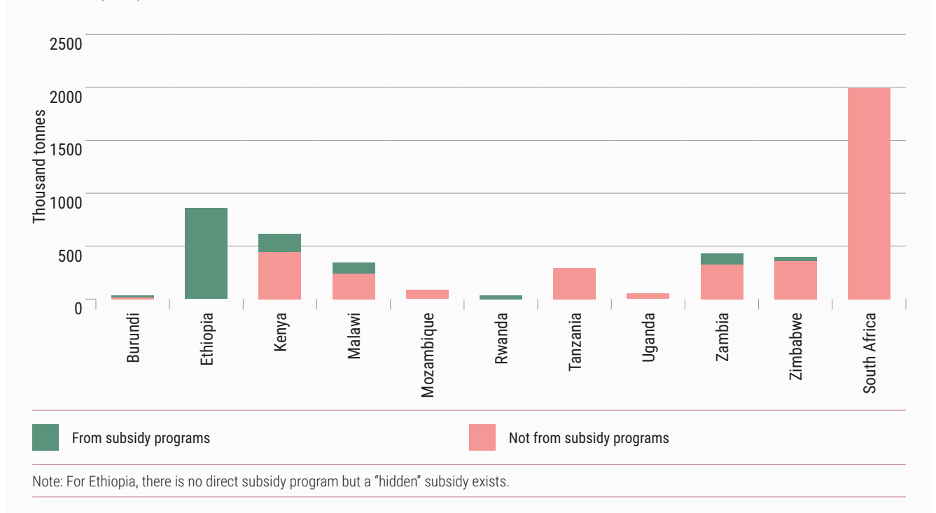
Figure 8.5-2 Amounts of fertilizer used in selected countries in Africa supplied through subsidy programmes and not from subsidized programs (thousands of tonnes). AFAP and IFDC (2017); UNECA and AfDB (2018).

Excessive and imbalanced use of nutrients contributes to soil degradation and water pollution (Gulati and Banerjee 2015). Subsidies, which have frequently been associated with imbalanced use of nutrients and fertilizer market distortions, can also be a burden on governments' budgets (Huang, Gulati and Gregory 2017). They may reduce funds that might have been available for other development priorities (UNEP 2020).