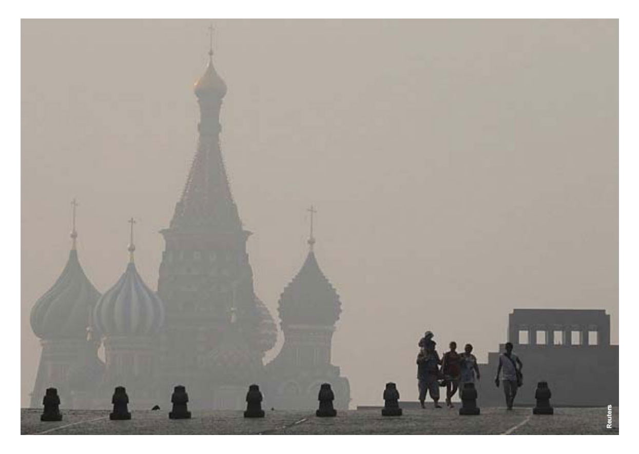
Figure 3: The forest fires near Moscow cover the Red Square in smoke and ash

The recent drought and associated fires destroyed 20 per cent of Russia's wheat crop, which represents a 1.6 per cent decline in the global wheat supply