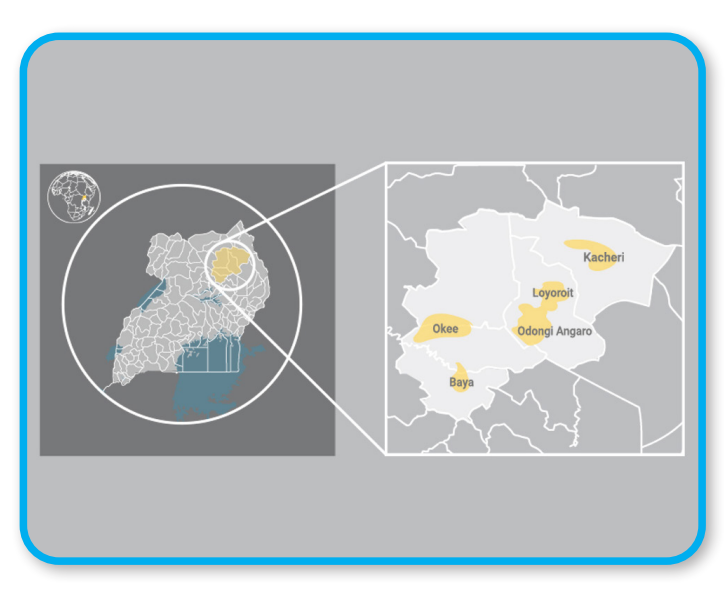
Fig.1:Map of the Project Sites