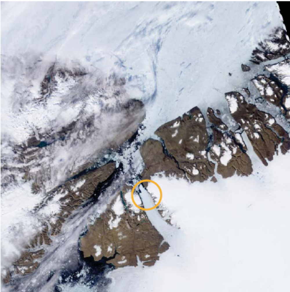
Figure 1: The calving of a giant iceberg illustrated by satellite imagery from 28 July (left) and 5 August 2010 (bottom). The iceberg is expected to drift into the Nares Strait either blocking it or breaking up into smaller pieces (NASA 2010).