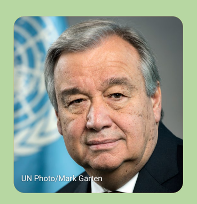
António Guterres, UN Secretary-General

"When UNEP was founded in 1972 the planet was already showing signs of buckling under the weight of humanity. UNEP offered the world a new way forward based on a vision for a better, healthier earth built on the pillars of international cooperation.