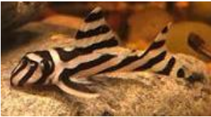
Actinopteri (Fishes): 1