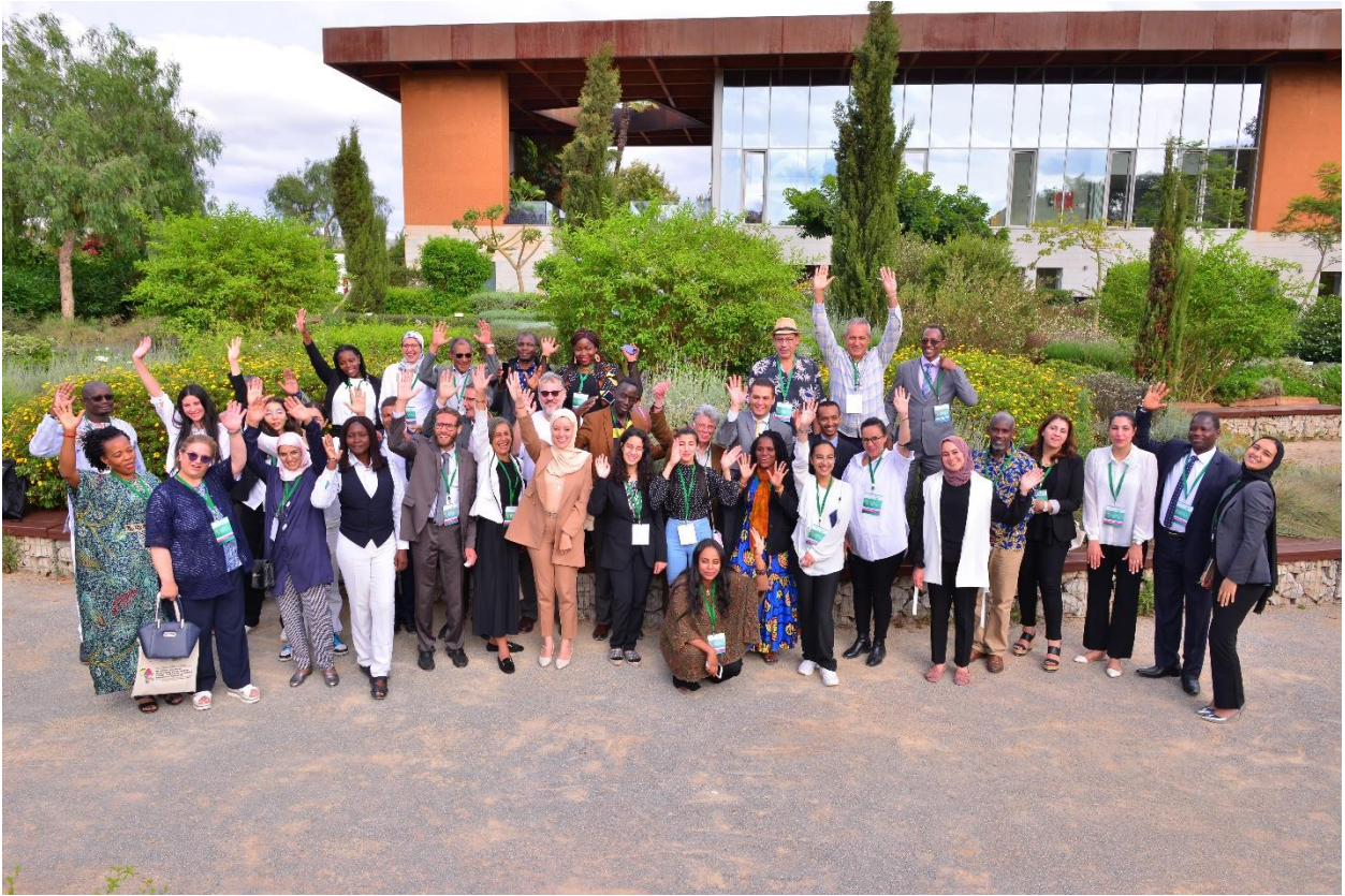
“Reviewing UNEA 5 & looking forward to UNEA 6” Workshop, Hassan II International Center for Environmental Training, Morocco, February 2022