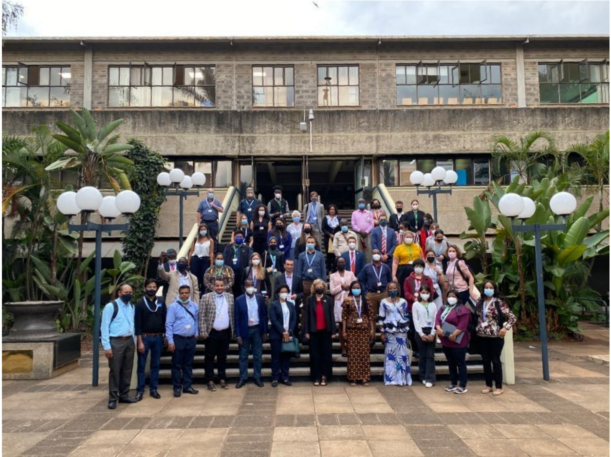
Group Picture of Major Groups and Stakeholders with UNEP ED, Kenya, February 2022