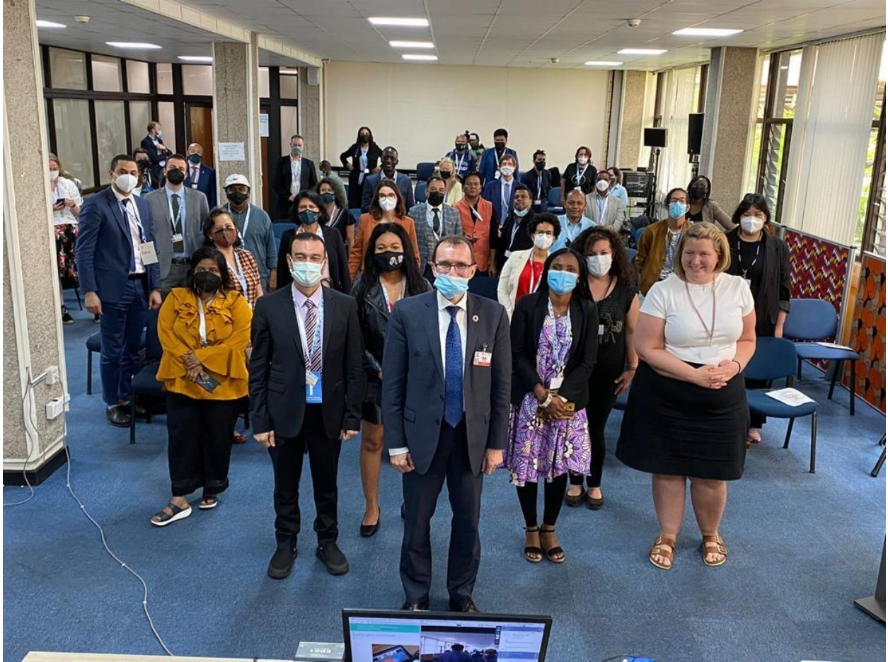
Dialogue of UNEA 5 President with Major Groups and Stakeholders, Kenya, February 2022