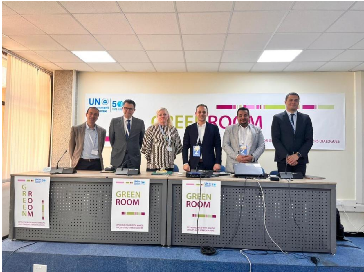
UNEA 5.2 “Road to COP27” Side Event organized by Youth Love Egypt, Member of the African Major Groups and Stakeholders, in partnership with the Egyptian COP27 Presidency, Stockholm +50 and Members/Observers of the MGFC, Kenya, February 2022