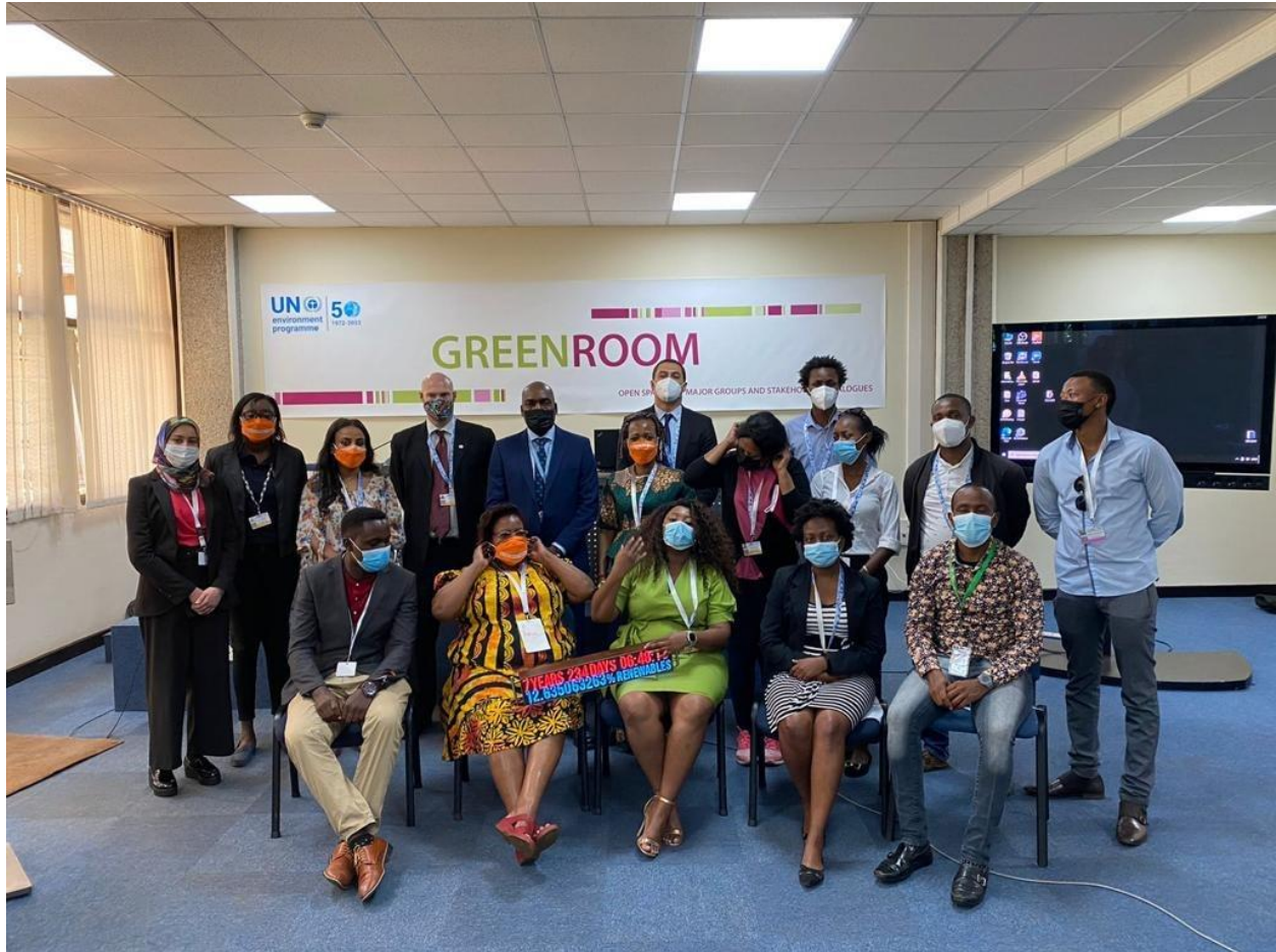
Meeting between African Major Groups and Stakeholders and the AMCEN Secretariat, Kenya, February 2022