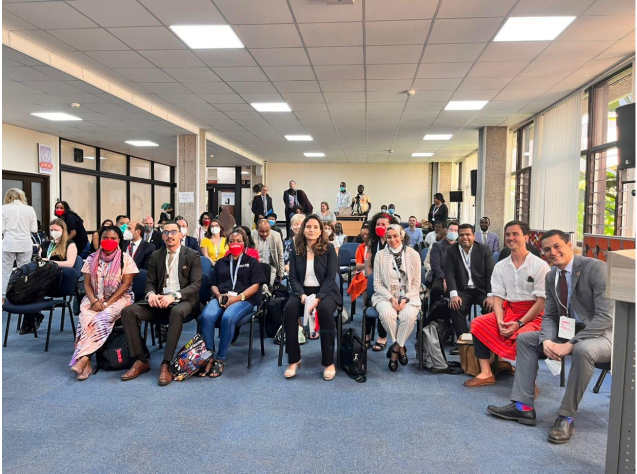
Dialogue of UNEA 6 President with Major Groups and Stakeholders, Kenya, March 2022