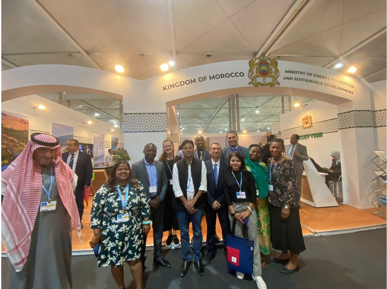
Meeting of the Major Groups and Stakeholders during COP27 in Egypt, Moroccan Pavilion, November 2022