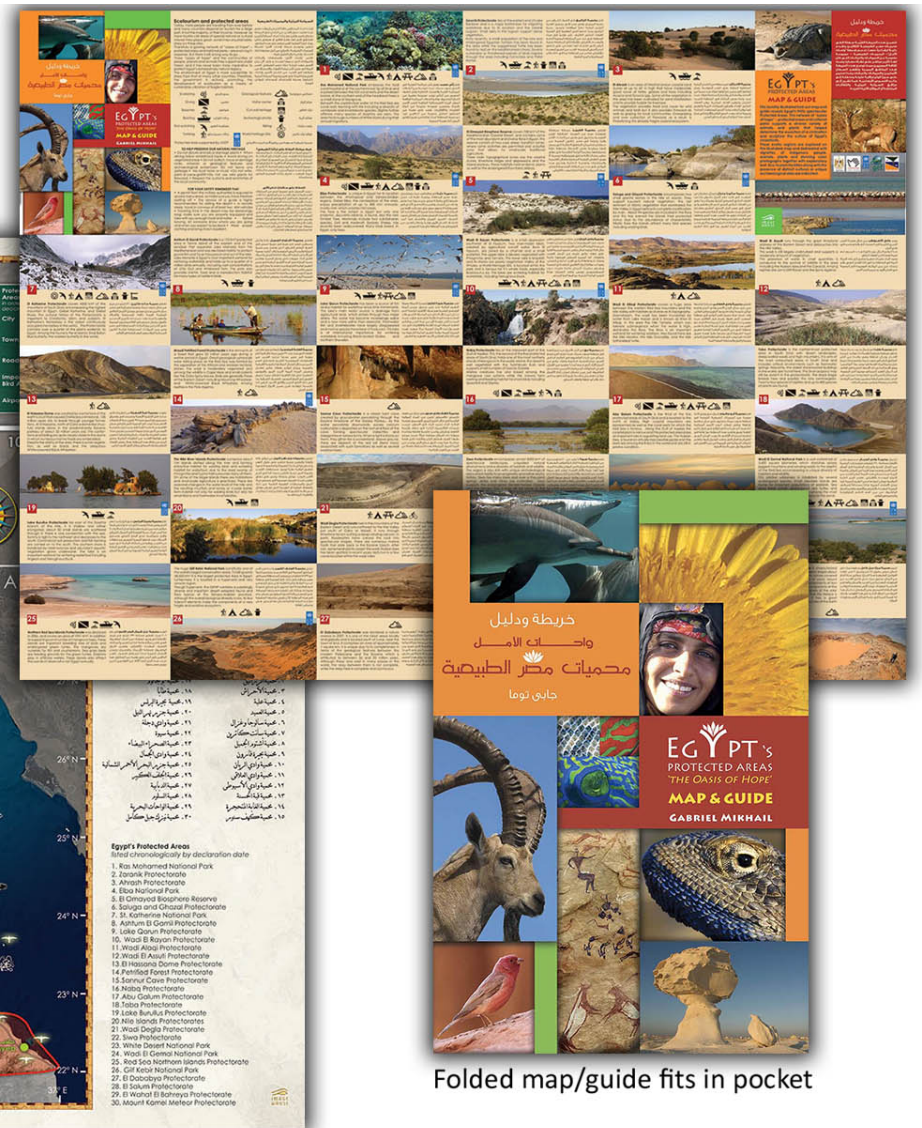
Folded map/guide fits in pocket