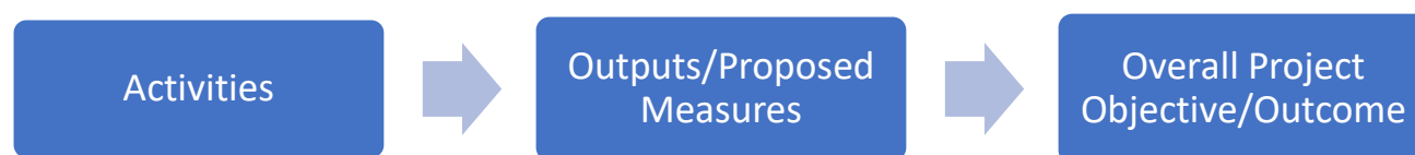
Figure 1: Example of a simplified results chain illustrating the links between activities, outputs/proposed measures and overall project objective/outcome of a given project

A Theory of Change can be represented either diagrammatically or as a narrative. This is also known as a results chain. A narrative of the Theory of Change allows for detailed discussion of stakeholder roles, needs and choices and chronological description of change dynamics. A visual representation of the Theory of Change can serve as a summary and make communicating the project's logic easier. Theory of Change diagrams can be simple or complex, depending on how much information is available and the scale of the project being designed.