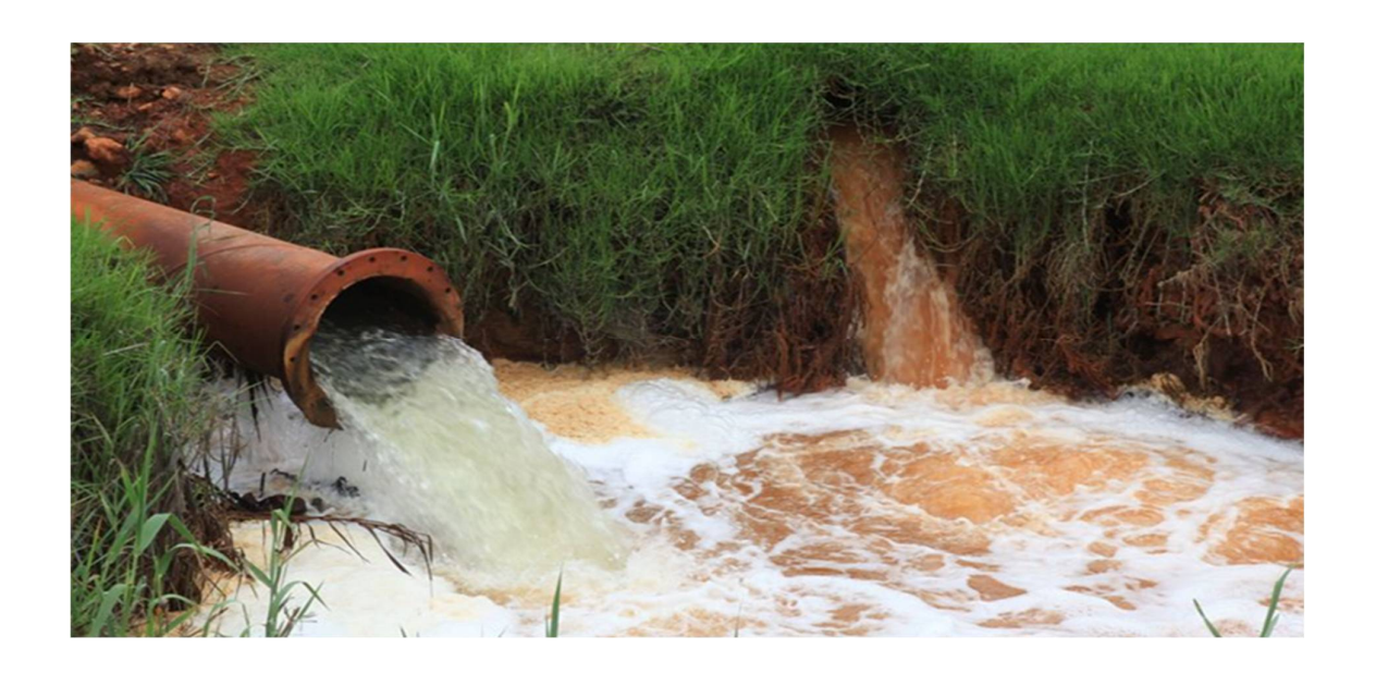
Evaluation Office of the United Nations Environment Programme Distributed: April 2023