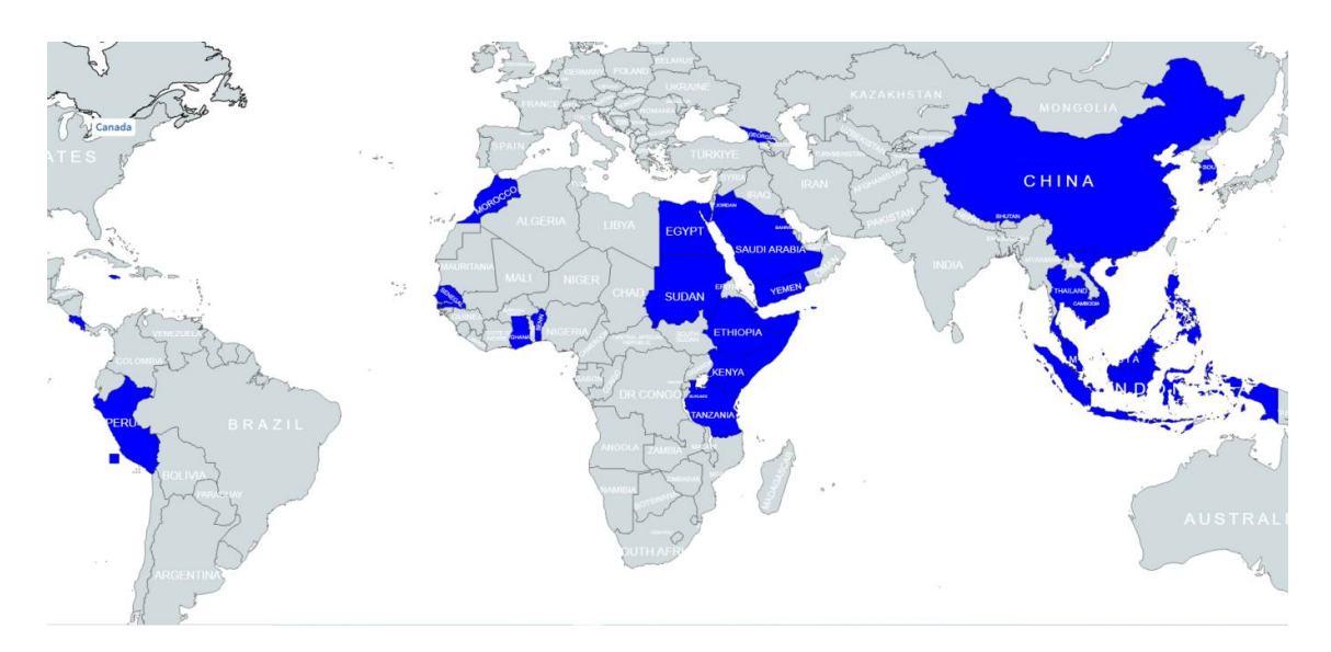
Figure 1: Map of countries which participated in the GW<sup>2</sup>I Project