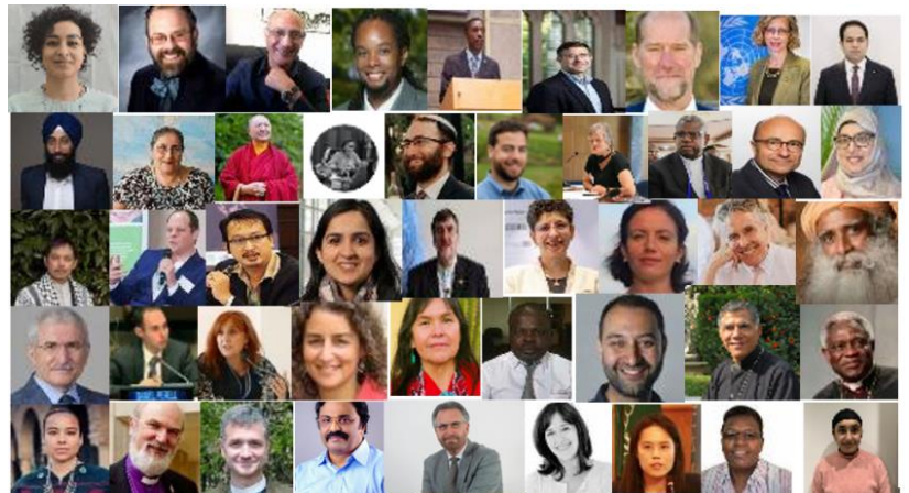
Figure 1: Panellists at the Faith for Earth Dialogue

The Faith for Earth Dialogue “Changing the Future” was hosted 680 participants during the period 21 February to 4 March, including 24 thematic sessions that addressed 24 critical themes and priorities concerning faith actors. Issues ranged from a discussion about the ethical crises that underpins the triple planetary crisis to the practical implementation of the Faith for Earth Coalition. Efforts culminated in a web-