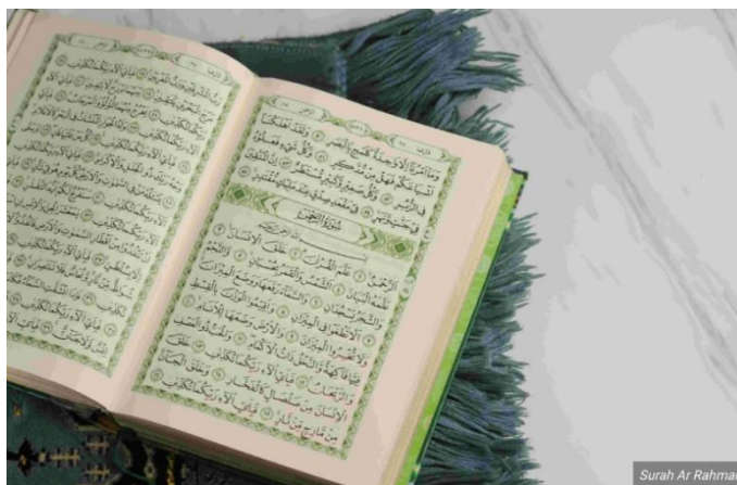
Figure 5: Al-Mizan: A Covenant for the Earth

Faith for Earth and representatives of the Islamic World Educational, Scientific and Cultural Organization; the Islamic Foundation