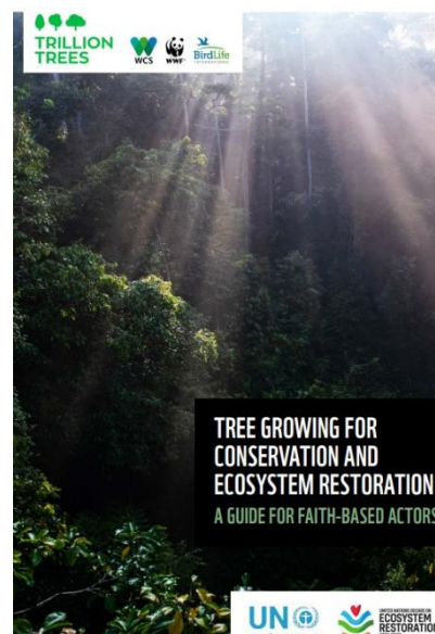
Figure 7: This guide is designed for use by faith groups around the world based on the lessons and experiences unique to this constituency.

The Centre for Earth Ethics convened a Consultation Series on the role of values, culture and spirituality towards healthy ecosystems, particularly traditional, religious, and indigenous knowledge for transformational social behavioural change, reiterated in the Faith Strategy for Ecosystem Restoration .