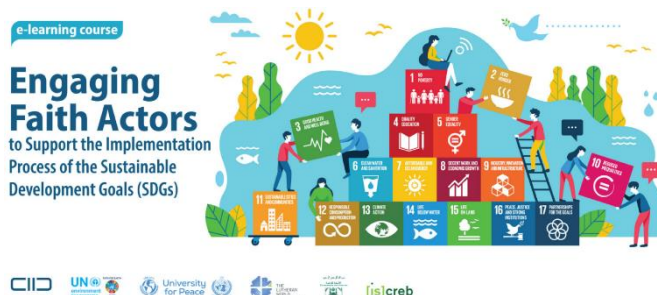
Figure 10: Engaging Faith Actors to Support the Implementation Process of the Sustainable Development Goals

The International Dialogue Centre (KAICIID) together with Faith for Earth, University of Peace (UPEACE), Lutheran World Federation (LWF), National Muslim Council of Liberia (NMCL), and Institut Superior de Ciències Religioses de Barcelona (ISCREB) unveiled a new e-learning course ' Engaging Faith Actors to Support the Implementation Process of the