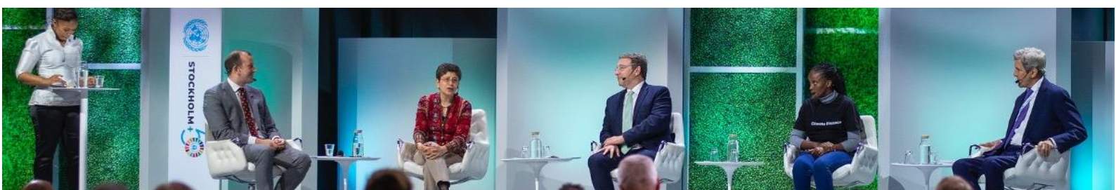
Figure 2: Leadership Dialogue, Stockholm+50 (2022)

The Role of Faith, Values and Ethics in Strengthening Action for Nature and Environmental Governance , United Nations Environment Programme (2021)