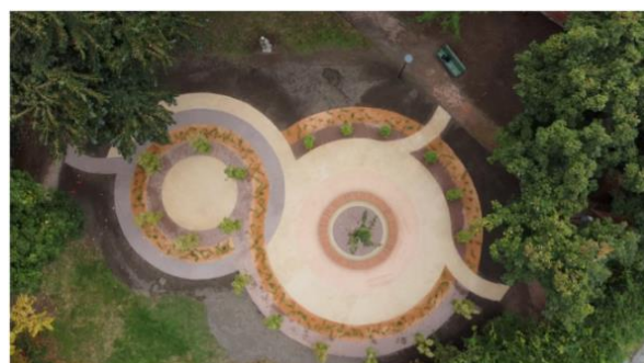
Figure 8: The Living Chapel (Milan, Italy)

The Living Chapel, conceived by musical composer Julian Revie, is a garden that induces spiritual reflection on the intimate need for harmonious connection between humanity and nature and a program of action, supported and shared by the Vatican’s Dicastery for Promoting Integral