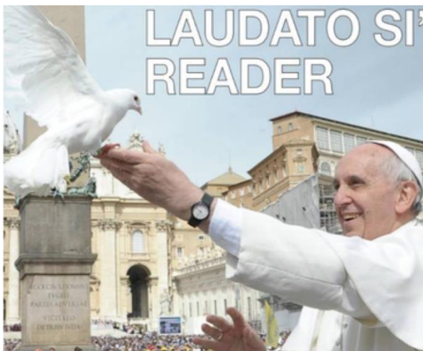
Figure 4: Laudato Si' Reader: An Alliance of Care for Our Common Home

The Dicastery for Promoting Integral Human Development published a special e-book about the various ways people have brought Laudato Si' to life over the last six years. Laudato Si' Reader: An Alliance of Care for Our Common Home includes Faith for Earth's journey since 2017, inspired by Pope Francis' vision, the Dicastery, and the global Faith community, and how Laudato Si' inspired Faith for Earth as a programme and the launch of Al-Mizan: Covenant for the Earth .