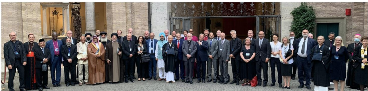
Figure 6: Participants of the Faith & Science Meeting

Under the Working Group on Climate Change of the Multi-Faith Advisory Council (MFAC) to the UN IATF-R in partnership with UNEP, UNFCCC, and several faith-based organizations including the Parliament of World’s Religions, the World Council of Churches, Brahma Kumaris, Bhumi Global, and the Anglican Communion Office worked together to organise the interventions of the faith network.