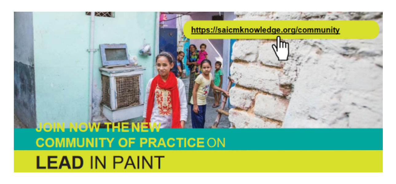
Lead in Paint Community of Practice (LiP CoP)

The Lead in Paint Community of Practice brings together global practitioners from different sectors in a learning network about the elimination of lead paint. The most recent session, "Is there lead in my paint? All about testing and labs," took place on 8 December 2021. Presenters included representatives from UNEP, the International Pollutants Elimination Network (IPEN), Israel's Ministry of Health, and Mercer University. The discussion included the role of lead paint testing in eliminating lead paint: for awareness raising, for regulatory development and implementation, and for research to compare screening and compliance testing applications. A summary of the discussion with important takeaways is available in English and French. Join the LiP CoP to be notified of all events and receive additional materials. The following upcoming LiP CoP sessions are available to the public.