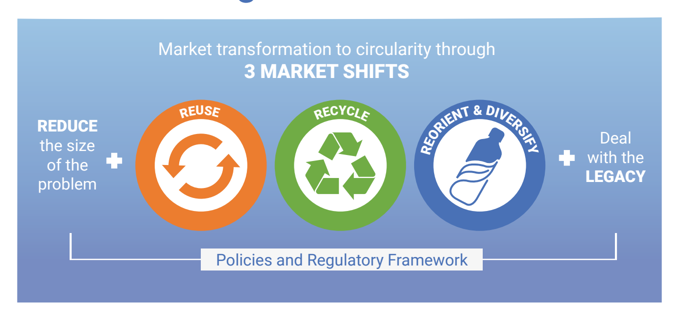
Figure ES 1: The systems change towards a new circular plastics economy.