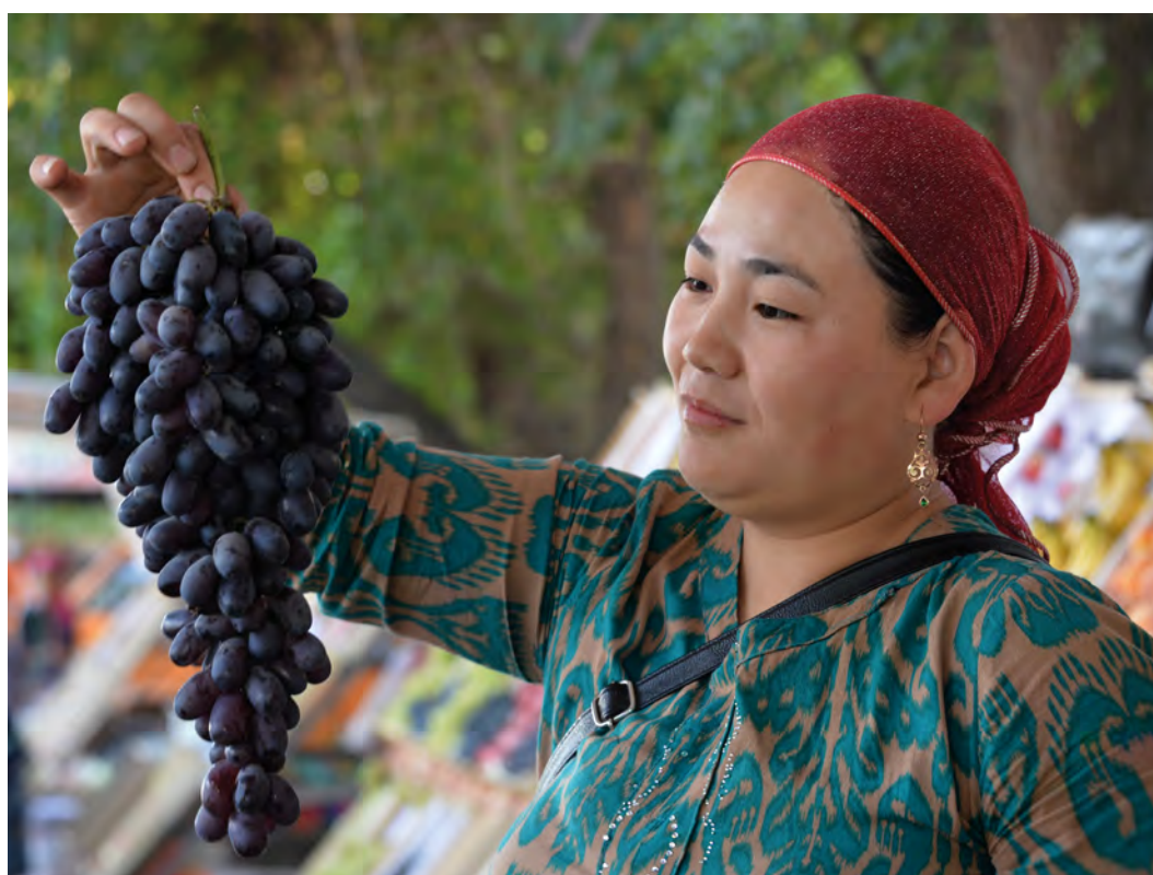
A Woman sells vegetables and fruits on the road near Kant 20 km from Bishkek, Kyrgyzstan on 22 August 2016.