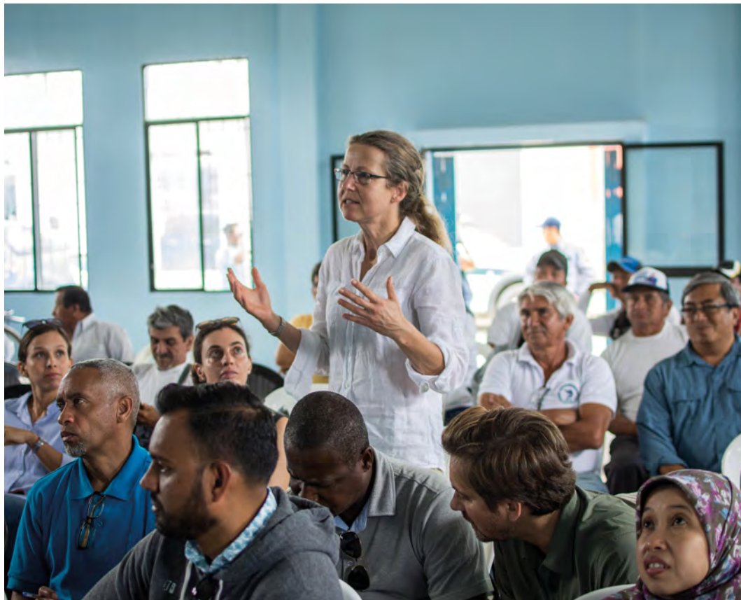
26 October 2018, Guayaquil, Ecuador – Multi-partners “Coastal Fisheries Initiative (CFI)” to promote sustainable fisheries management practices aimed at building vibrant coastal communities in Ecuador.

This section examines concrete ways to help stakeholders agree on a shared vision and, from that, develop realistic action plans with a clear strategic view behind them.