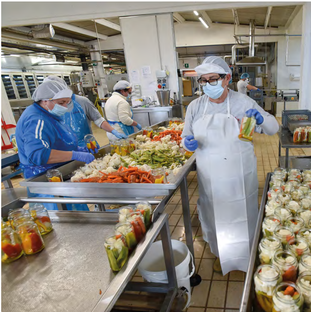
24 November 2021, Albinia (Tuscany), Italy - Workers of La Selva organic farm preparing canned vegetables.

Communication is a core pillar of any MSC initiative, requiring a variety of processes to engage people and develop understanding, consensus, ownership, meaningful alliances and strong partnerships. 92 Communication takes place on a range of levels – for instance, through individuals, where the quality of personal interactions will depend on the extent to which individuals listen and engage in dialogue; as well as collectively, where stakeholders develop and communicate a common message to contribute to change. 25 Several challenges that can adversely affect communication include: divergent views and preconceived ideas, not listening to others, lack of trust, and an uncondusive environment for sharing experiences and discussion. 78,92