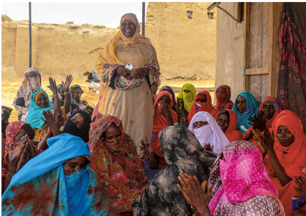
Community-based conflict resolution communities in Kanem gathering to fight against malnutrition.

However, the participation of all non-governmental organizations cannot be considered the same, with efforts needed to include the direct representatives of marginalized groups. 53 Also there is the risk that "civil society" participation could be skewed in favour of non-governmental organizations that are better resourced and with better capacities. In addition, some non-governmental organizations may lack a clear mandate for the groups they are representing. 54 Consumers are also an important actor in the agrifood system, but their voice can also be absent from the dialogue table. Involving consumers' organizations in MSC initiatives can help to raise awareness among citizens of the opportunities and challenges facing the food system and the role they can play in shaping a sustainable food system.