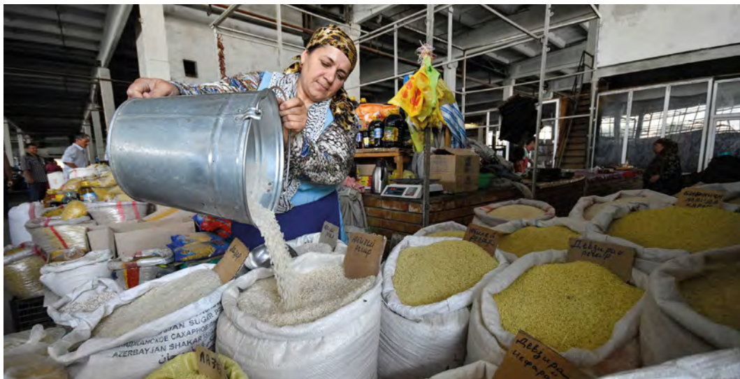
16 August 2016, Hissar, Tajikistan – FAO project enhanced government's capacities in Agrarian Reform and support the development of the agriculture and rural sector in Tajikistan.

The City Region Food System Toolkit 75 , for instance, highlights several steps, covering: an initial scan of secondary data and stakeholder interviews or focus groups for an identification of priority issues, as well as gaps for further research with primary data collection. This is followed by additional data collection and research and may involve the re-interpretation of secondary data. Well-designed data display is then developed in order to share the results of the assessment phase and prepare multi-stakeholder action planning.