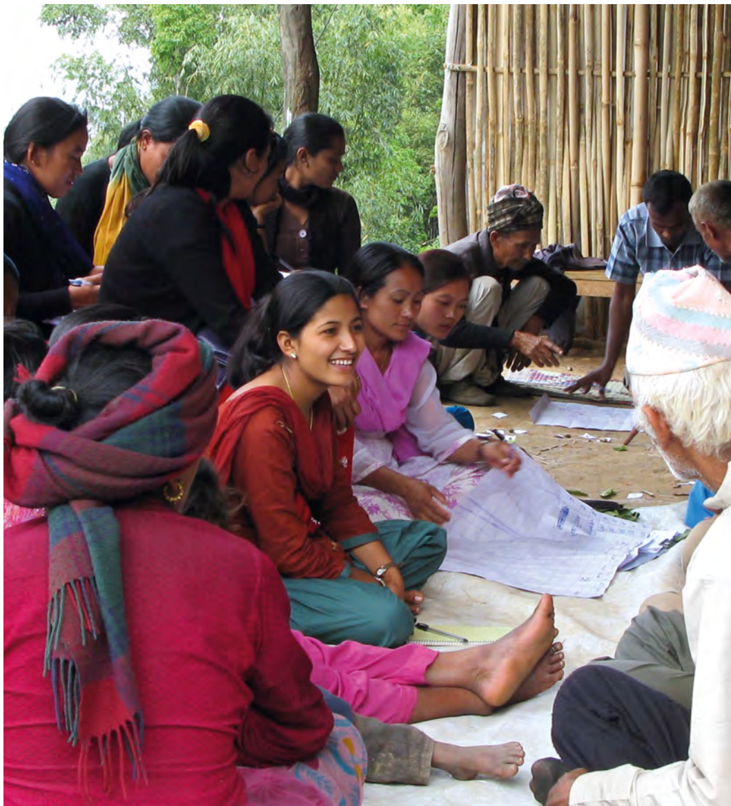
Discussion with rural women. Agriculture in Nepal.

>> Annex 1, Building Block 5 provides a list of tools and resources for financing MSC initiatives.