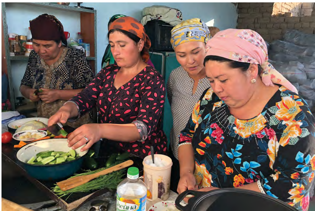
As part of community-based nutrition education sessions, beneficiaries of FAO Productive Social Contract / Cash+ pilot project learn how to improve traditional dishes to enhance their dietary diversity and address nutritional needs.

Building Block 3 provides more insights into capacity-building for MSC engagement (see also related tools and resources in >> Annex 1, Building Block 3 ).