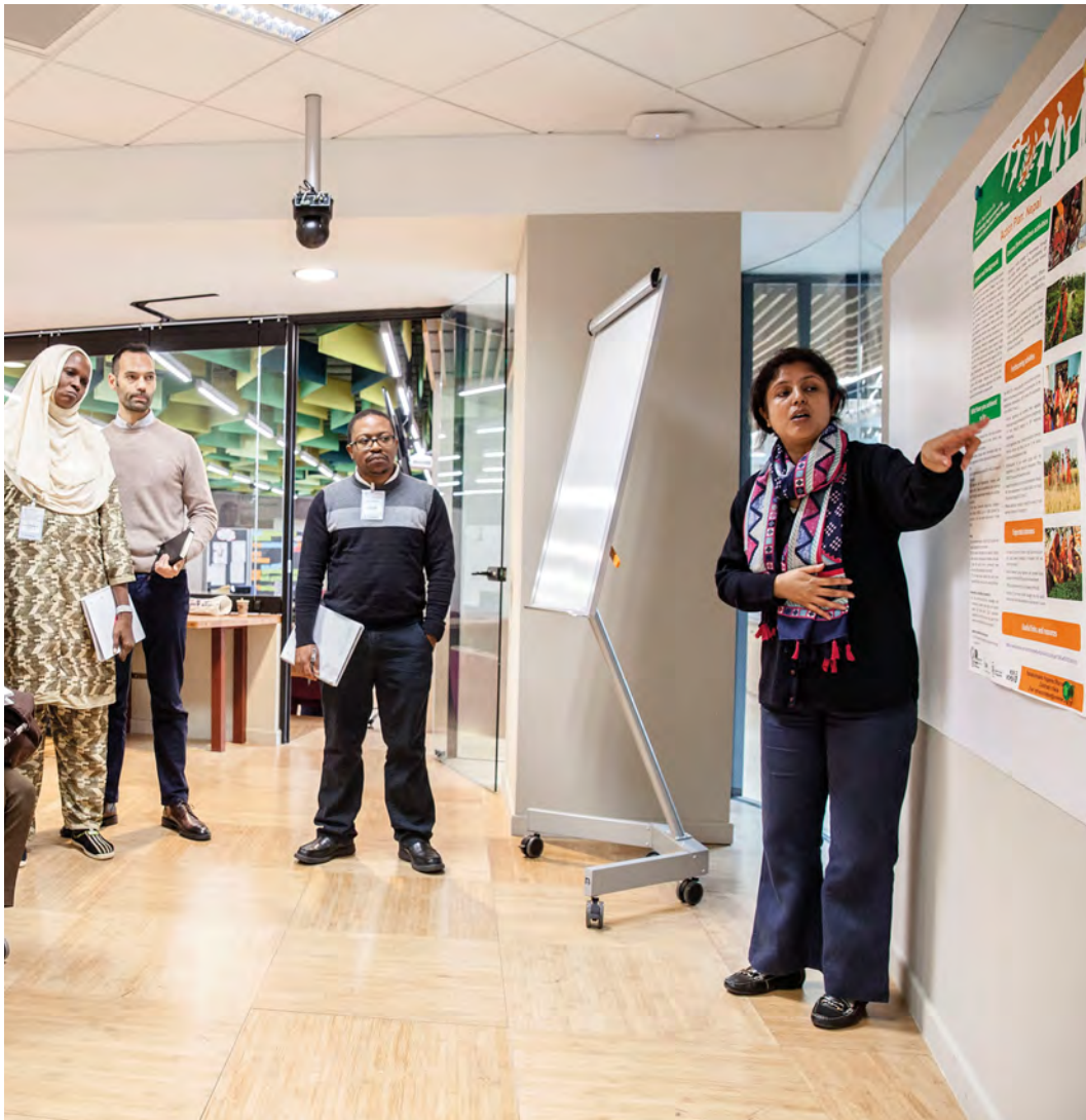
23 February 2017, Rome Italy - Workshop: Accelerating progress towards the economic empowerment of rural women with 7 country coordinators from the UN Joint Programme (FAO, IFAD, WFP and UN Women), FAO headquarters (Iraq Room).