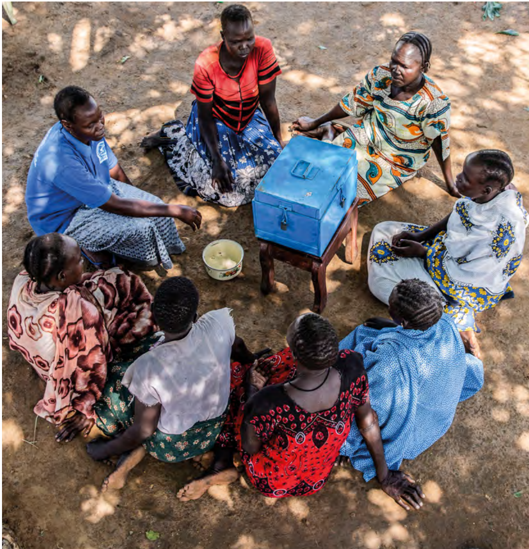
29 May 2018, Torit, South Sudan - FAO Agropastoral field schools (APFS) project provided a flexible and responsive platform for building the knowledge and skills of farmers and livestock keepers of all ages in South Sudan.

Once action plans, as described above, have been put into motion, a monitoring and evaluation (M&E) system will be required to continuously monitor the initiative’s success and to evaluate learnings for any adjustments needed to the strategy. The M&E process will also require the allocation and embedding of resources (i.e., time, funds and human resources) within the action plan. 116 When technical competencies on M&E are not available, capacity-building from development partners may be provided, or expertise hired. 120 It is also important that M&E is internalized in the initiative, so that it is not perceived as a standalone reporting task. 105