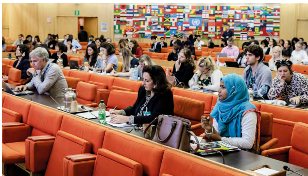
17 October 2019, Rome, Italy - CFS 46 Side-Event on data and information systems can empower family farmers, advance goals of the United Nations Decade of Family Farming (UNDF) and guide better policy.

>> Annex 1, Building Block 4 provides a list of tools and resources to develop a strategy.