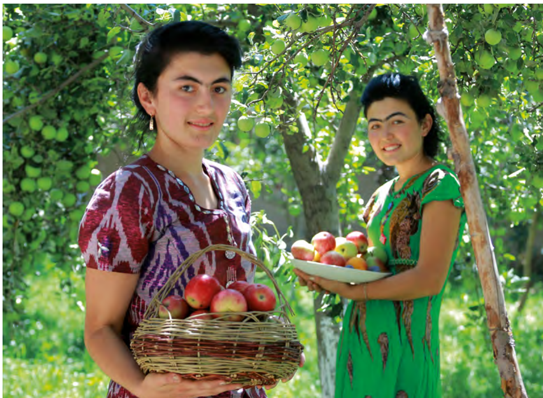
Yangikurgan rayon, Namangan province, Uzbekistan. Farmers care for their apple gardens thanks to modern drip irrigation technologies they got with support of FAO project “Promotion of water saving technologies in the Uzbek water scarce area of the transboundary Podshaota river basin”.

This does not mean that MSC will be easy, simple or even be successful, but it does offer a way to address complex challenges involving the stakeholders needed to have a chance of success.