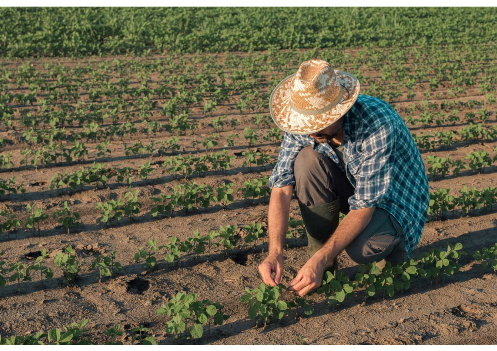
Farmer working on soybean plantation, examining crops development in early growth stages, Responsible organic farming of soya bean plants.

Public-interest, civil society, non-governmental and similar organizations often have good knowledge of and access to resources that can be helpful in identifying problematic pesticides and finding viable alternatives to HHPs. The involvement of such organizations in discussions is beneficial in terms of finding appropriate solutions to priority problems and of gaining the confidence and support of communities served by such organizations. Public interest groups can also play a key role in raising awareness among community-based organizations about the gender-specific risks of hazardous pesticides and the related needs of women and vulnerable groups.