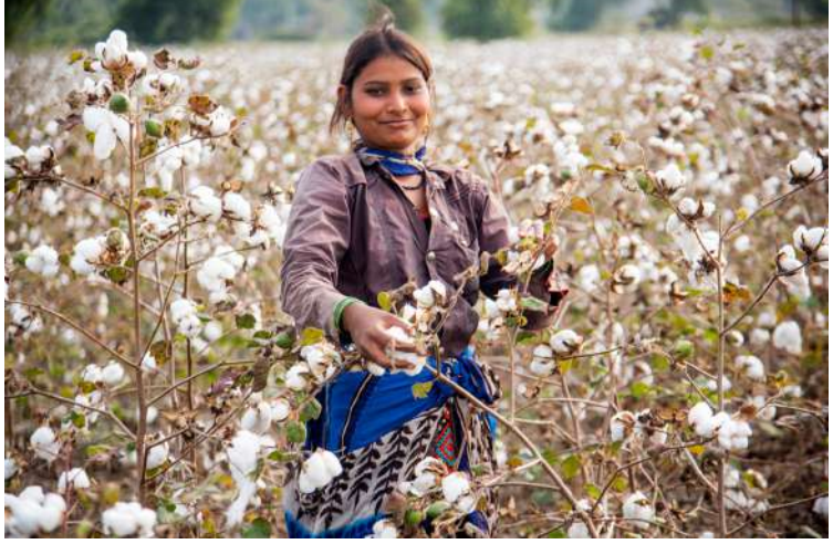
Indian woman harvesting cotton in a cotton field, Maharashtra, India.

As stated previously, the replacement of an HHP with another synthetic chemical pesticide may be unnecessary given that so many agroecological. cultural. mechanical and available. The biological options are replacement of an HHP with another chemical pesticide may be an option as a temporary measure, while long-term more sustainable options are sought or developed or when no other non-chemical option is available. Nevertheless, it should be borne in mind that all chemical pesticides have some undesirable health and