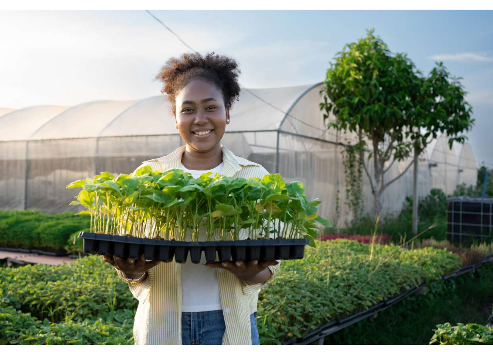
A portrait of a young woman who owns an African organic vegetable farm holding a seedling tray of vegetable seeds. to be transported to the nursery, greenhouse. Female business owner.

from hazardous chemicals and air, water and soil pollution and contamination. The continued use of HHPs risks undermining the achievement of these objectives in many ways. This justifies the removal of HHPs from use.