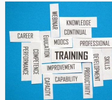
Capacity building information