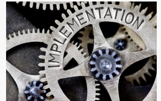
Information on the status of implementation