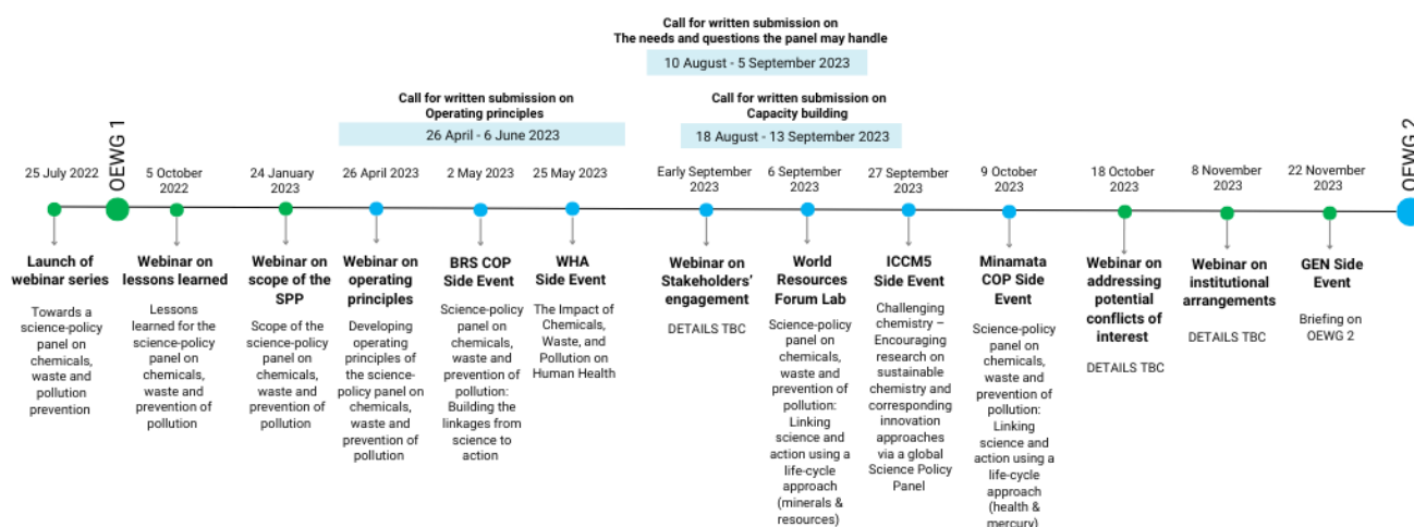
Figure 2: Timeline of intersessional webinars and side events and calls for written submissions in preparation of OEWG-2.