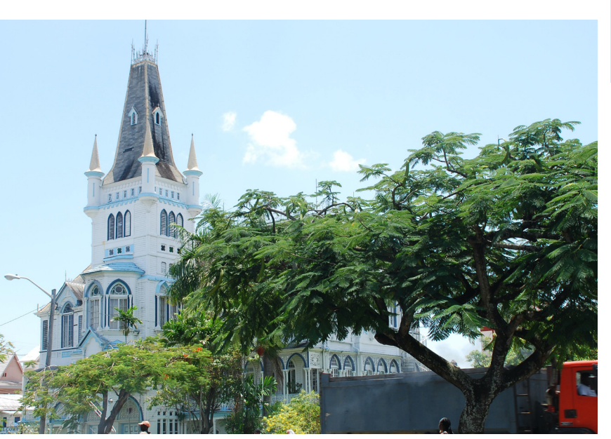
Guyana

The United Nations agencies present in Guyana cooperate under the United Nations Multi-Country Sustainable Development Framework in the Caribbean 2017–2021, which was developed instead of country-specific development assistant frameworks, and under the Socioeconomic Response and Recovery Plan prepared by the United Nations country team in response to the coronavirus disease (COVID-19) pandemic. As part of a region-wide effort, the Guyana country team is currently preparing the country implementation plan for the next five-year Multi-country Sustainable Development Cooperation Framework (2022-2026). The need to enhance the generation, management and use of national data to monitor progress towards achieving the Sustainable Development Goals is recognized in the Framework, along with the continuing challenge of reporting on