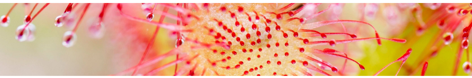
Europe, UK, Yorkshire Moors, Round-leaved sundew on a peatland bog.

government entities' awareness of the mandate of the Bureau of Statistics is insufficient. It is unclear which of the environmental agencies are responsible for setting standards in relation to data-collection techniques, quality control and monitoring and development of environment databases. Institutions that would be well placed to do the coordination do not necessarily have the legislative mandate or the capacity required.