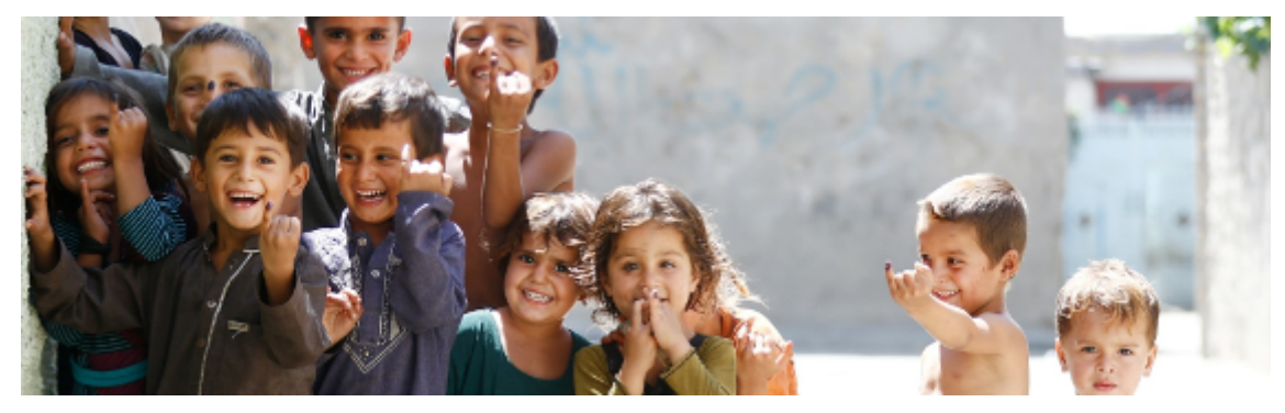
What Can You Do? Organize events for the 2023 International Lead Poisoning Prevention Week of Action!